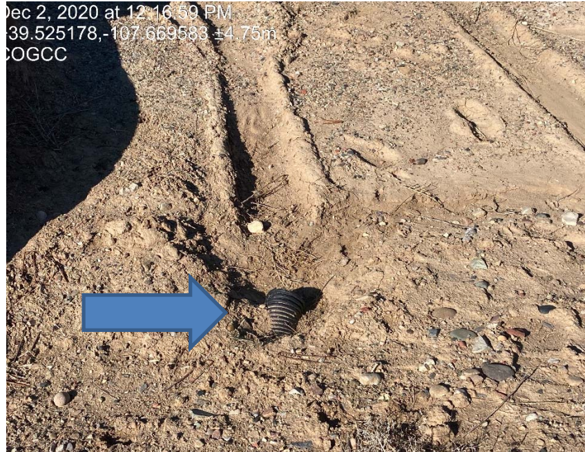
Drain inlet by tank battery south east corner of pad