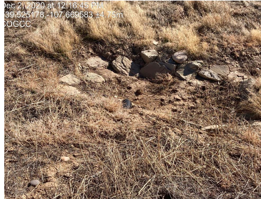
Drain outlet south east corner of pad