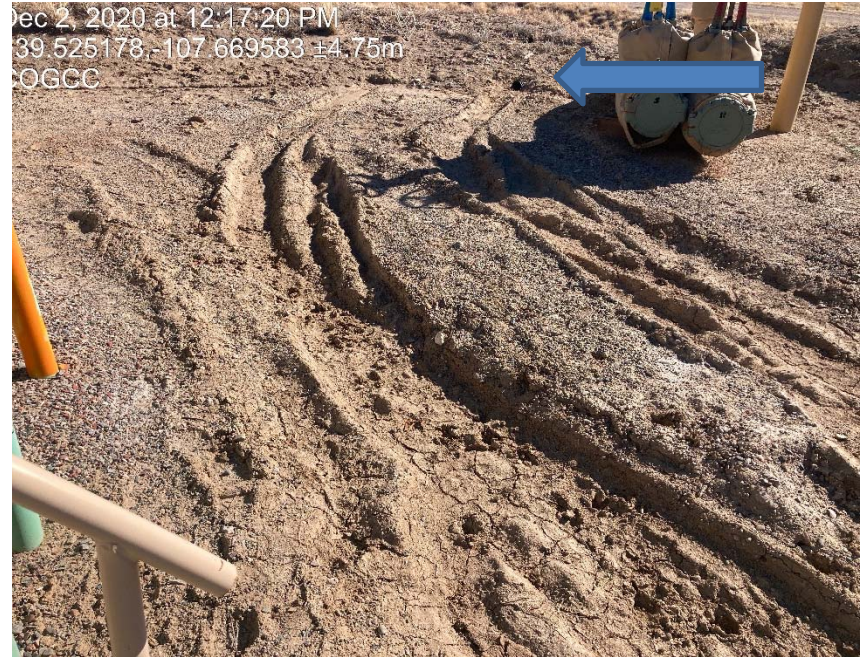
Drain inlet marked with arrow