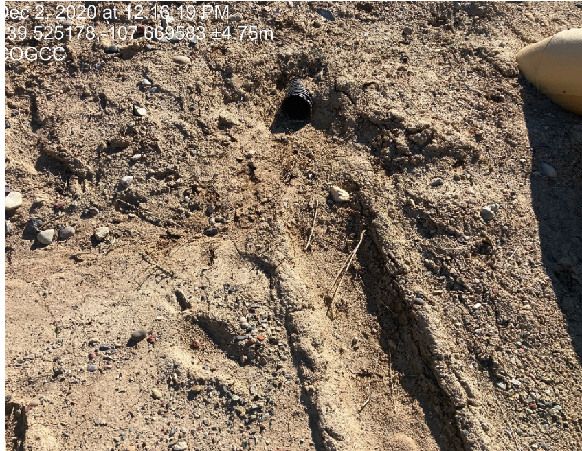
Drain inlet south east side of pad