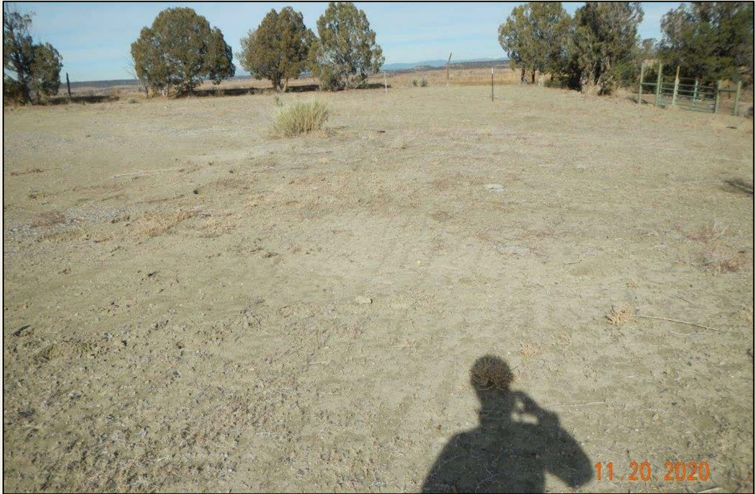
Photo 2. View of the northern project area from the northeastern corner facing westward. Area appears to be recently seeded.