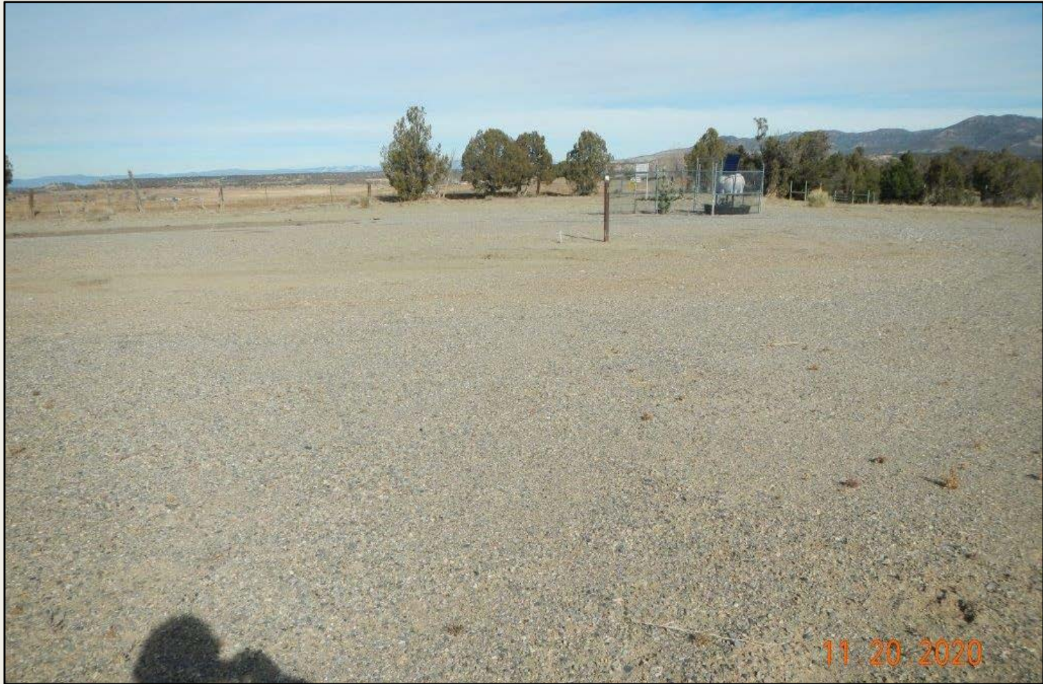
Photo 1. View of the project area from the southeastern corner facing center.