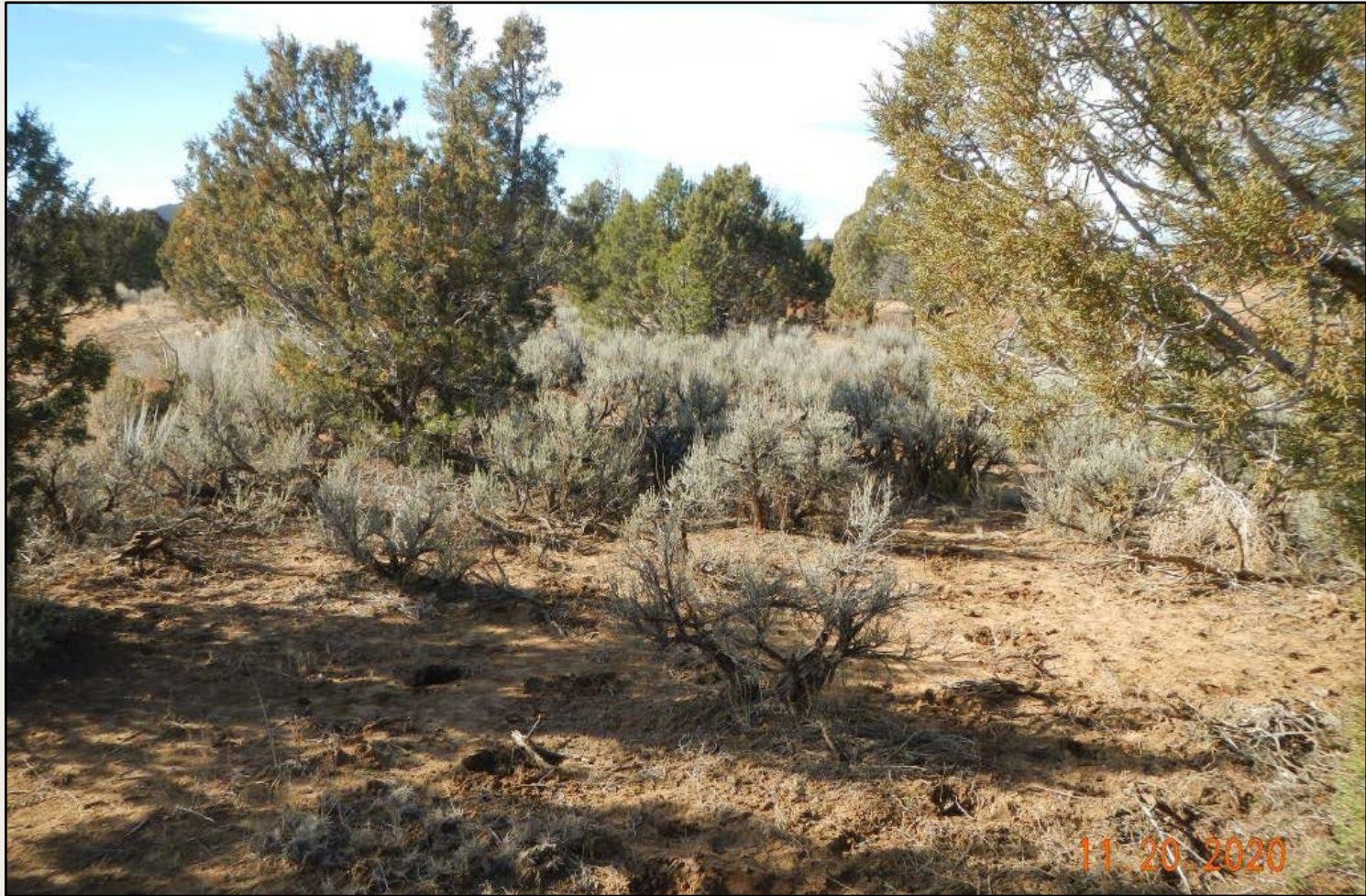
Photo 5. View of the reference area comprised of sagebrush shrubland with scattered pinyon and juniper trees and understory of grasses and forbs such as squirreltail, prickly pear, and crested wheatgrass.