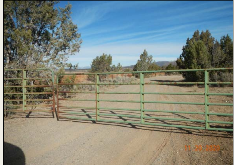
Photos 6/7. View of closed gates after entering and leaving location.