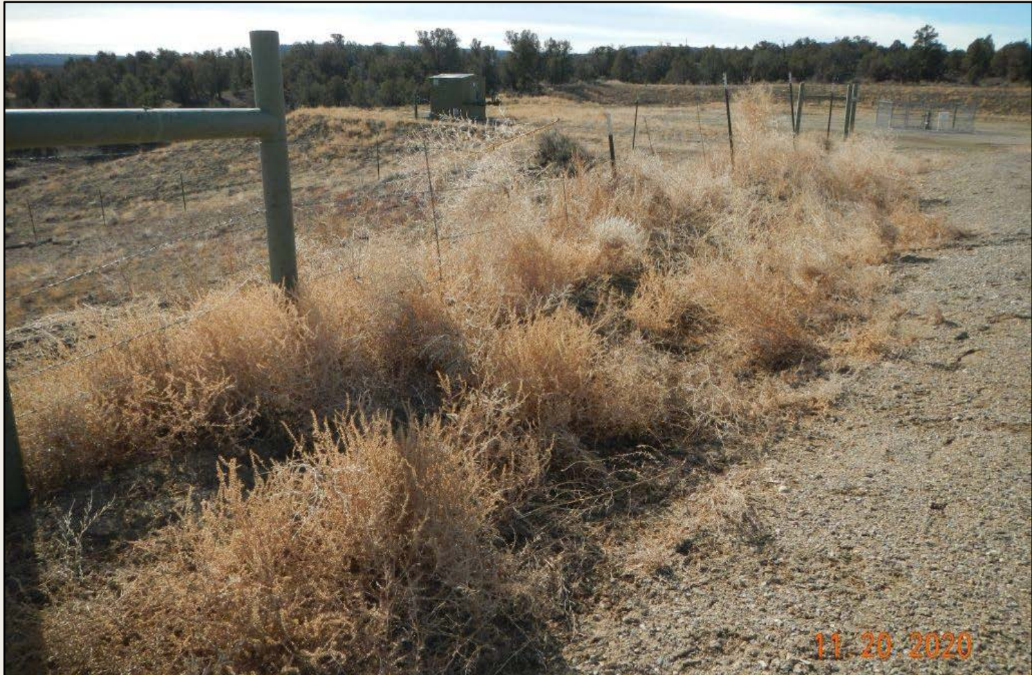
Photo 3. View of Russian thistle debris along the eastern well pad fence.