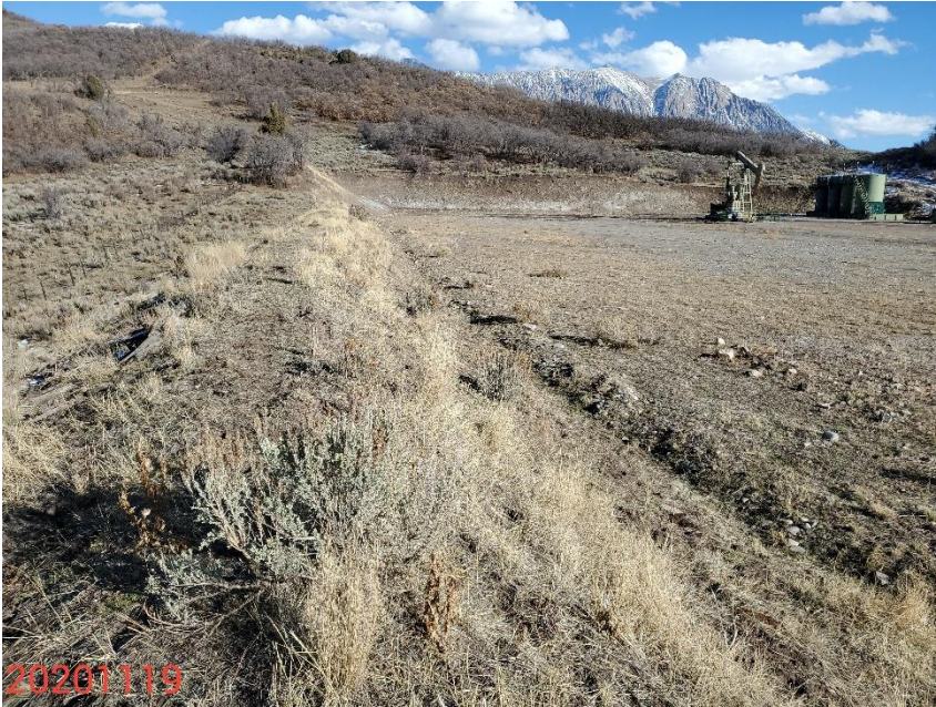
Photo 1: Photo taken from the northwest corner of the Location, facing east. Photos 1-2 provide an overview of the Location from east to southeast.