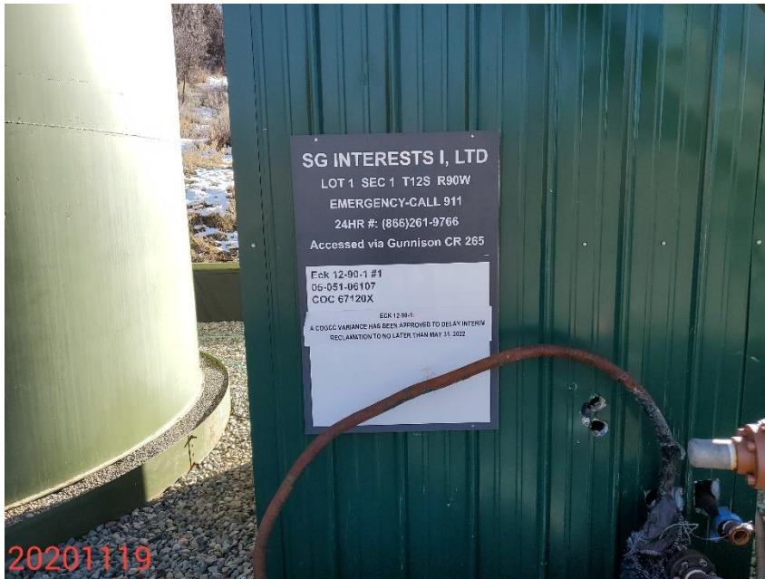
Photo 7: Photo shows sign located at the tank battery identifying that Location has a delayed IR variance until 5/31/2022