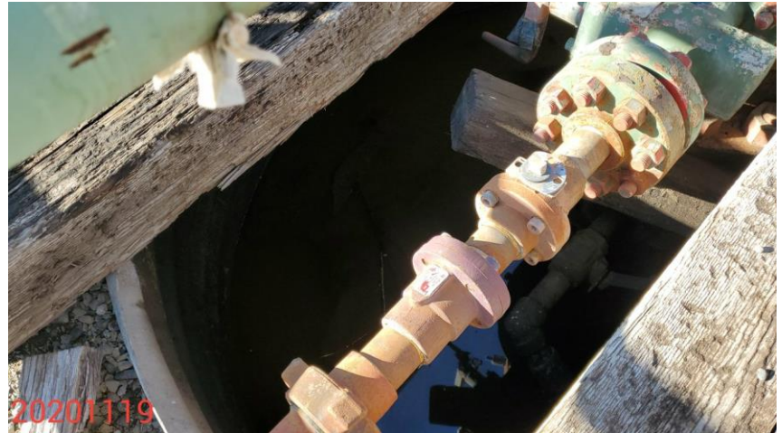
Photo 10: Continued from photo 9. Photo shows cellar has filled with fluids/chemicals, BMPs to prevent wildlife access to the cellar are insufficient.