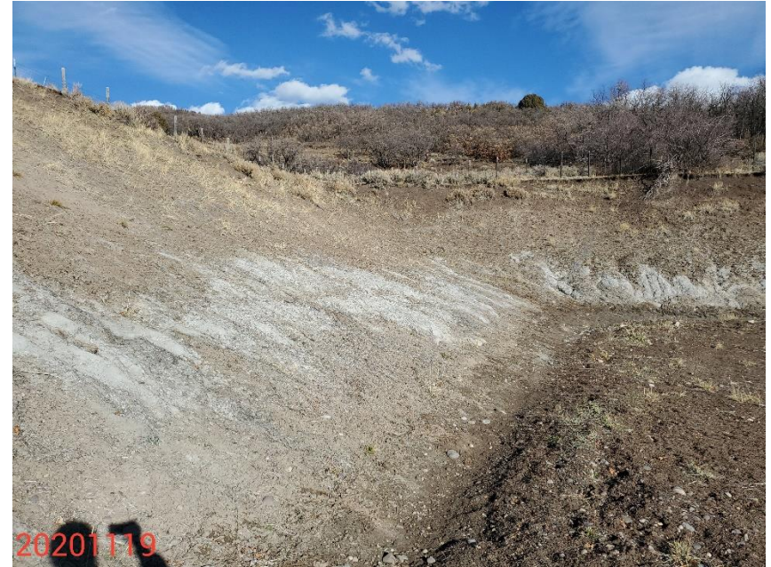
Photo 4: Photo taken from the northeast corner of the Location. Photo erosion degradation on the cut slopes of the Location. Photo shows that long-term erosion control BMPs do not appear to have been installed in conjunction with the erosion matting, appears insufficient and/or has not been maintained in a proper functioning condition.