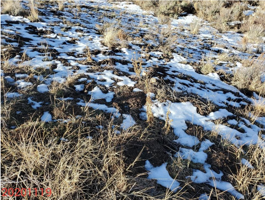
Photo 3: Photo taken from the fill slopes on the north end of the Location. Photo shows Musk thistle is evident on the Location. Due to the onset of winter conditions and plant dormancy, a followup inspection will need to be conducted in the 2021 growing season to determine compliance with Rule 1003.f.