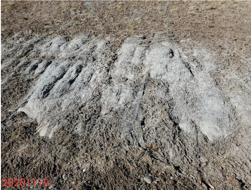
Photo 5: Photo taken from the northeast corner of the Location. Photo erosion degradation on the cut slopes of the Location. Photo shows that long-term erosion control BMPs do not appear to have been installed in conjunction with the erosion matting, appears insufficient and/or has not been maintained in a proper functioning condition.