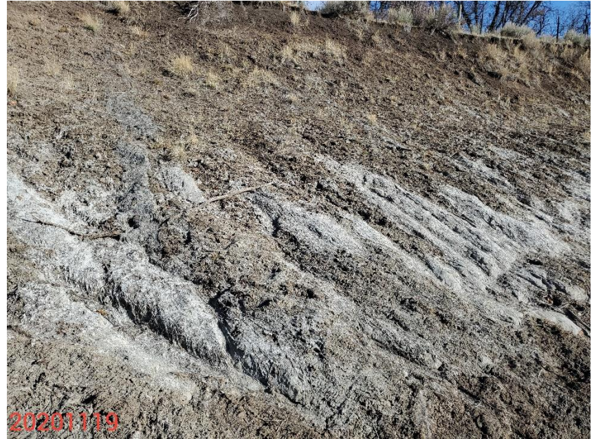
Photo 6: Photo taken from the northeast corner of the Location. Photo erosion degradation on the cut slopes of the Location. Photo shows that long-term erosion control BMPs do not appear to have been installed in conjunction with the erosion matting, appears insufficient and/or has not been maintained in a proper functioning condition.