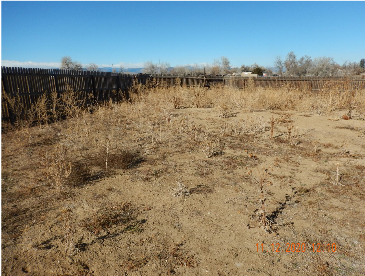
Photo 5. Photo taken from the location, facing West. See comments under Photo 3-4.