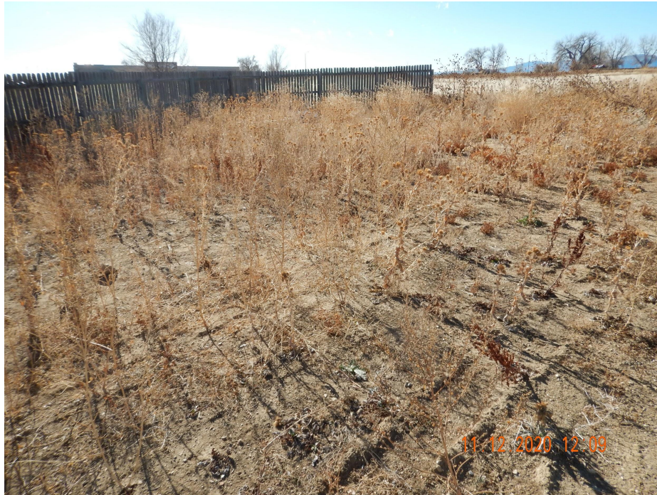
Photo 3. Photo taken from the location, facing South. Photo illustrates the Operator has failed to perform final reclamation activities and failed to manage noxious weeds.