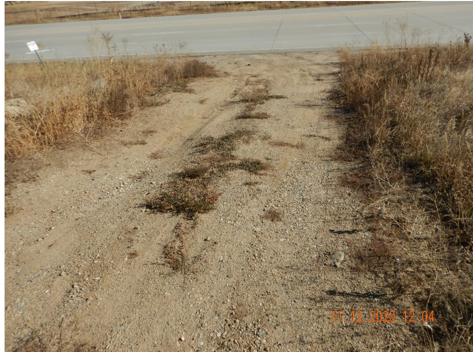
Photo 2. Photo taken from the entrance of the location off Hwy 287, facing East. See comments under Photo 1.