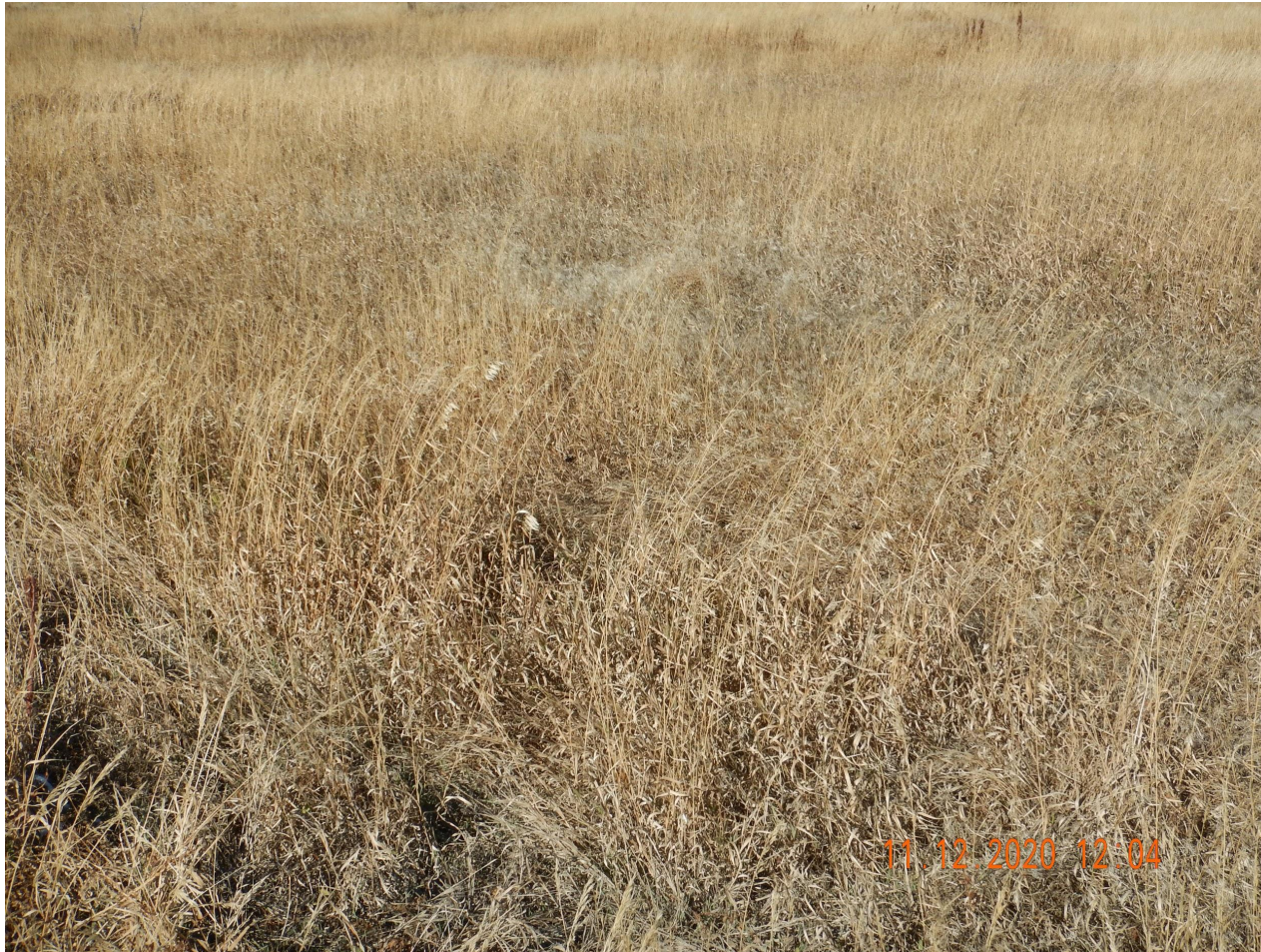
Photo 7. Reference vegetation photo taken north of the location entrance, facing Northwest.