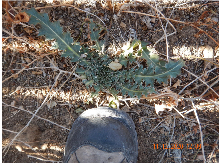
Photo 4. Photo taken from a portion of the location. Photo illustrates a Musk thistle, List B, Colorado noxious weed.