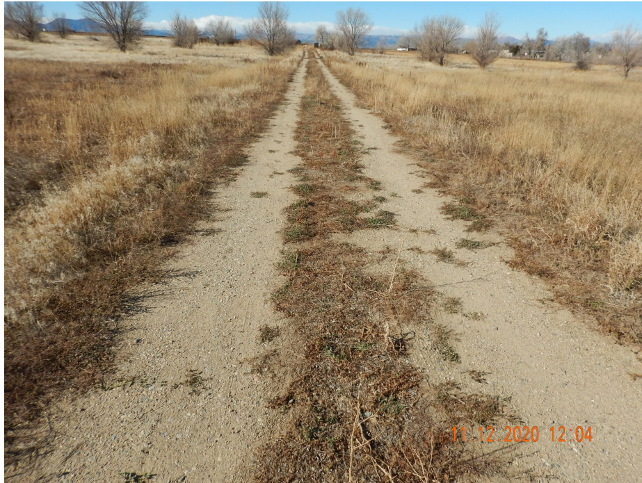
Photo 1. Photo taken from the entrance of the location off Hwy 287, facing West. Photo illustrates the Operator has failed to perform final reclamation activities.