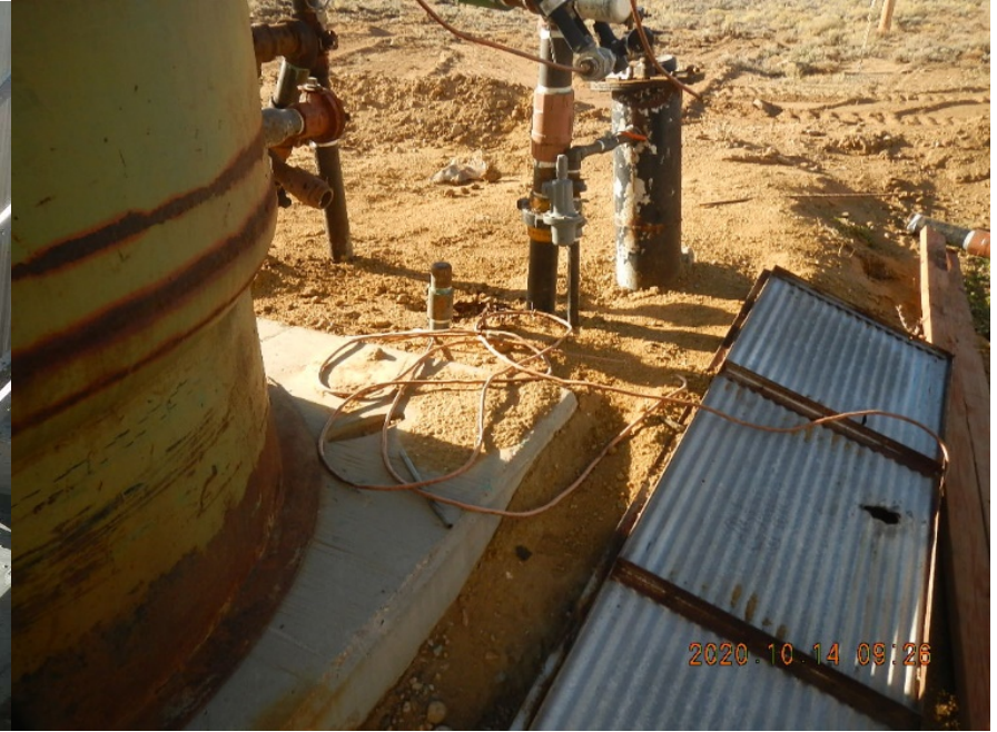
Un marked flowline risers, trash, and debris.