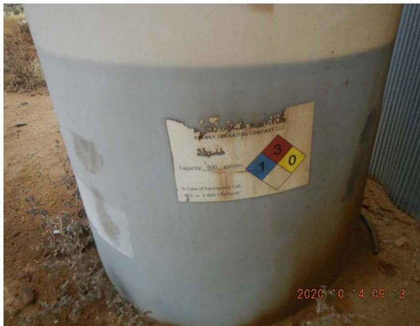
Unlabeled but placard tank. Contents unknown.

Location Name: Dwinell Tank Battery Location ID: 324591; Spill ID: 473059; REM 15326; Pit ID: 115239