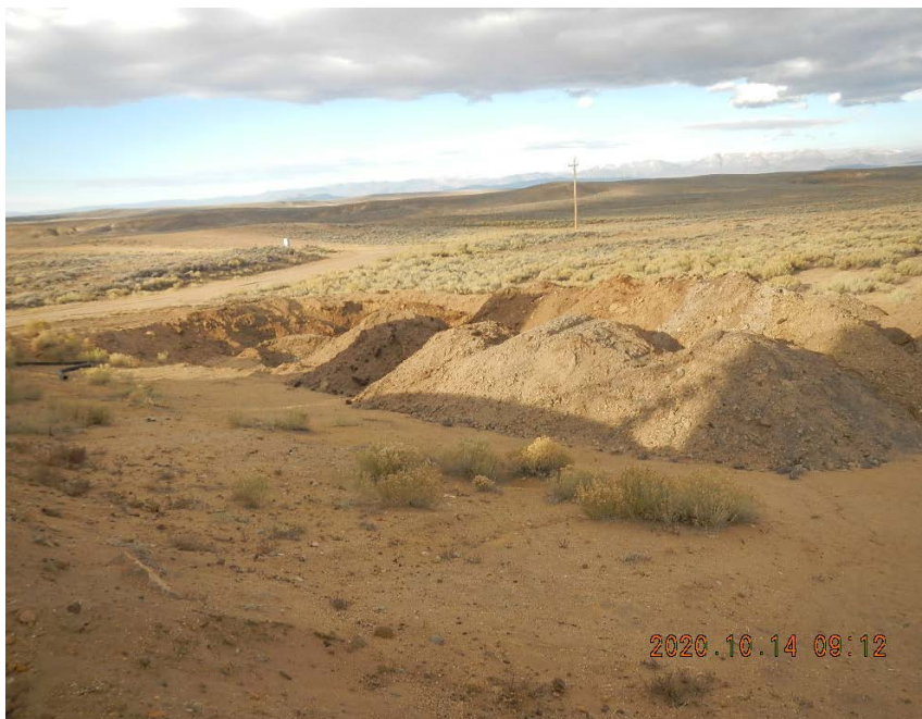
Oil impact material from Spill ID 473059 discovered on 03/09/2020.

Location Name: Dwinell Tank Battery Location ID: 324591; Spill ID: 473059; REM 15326; Pit ID: 115239