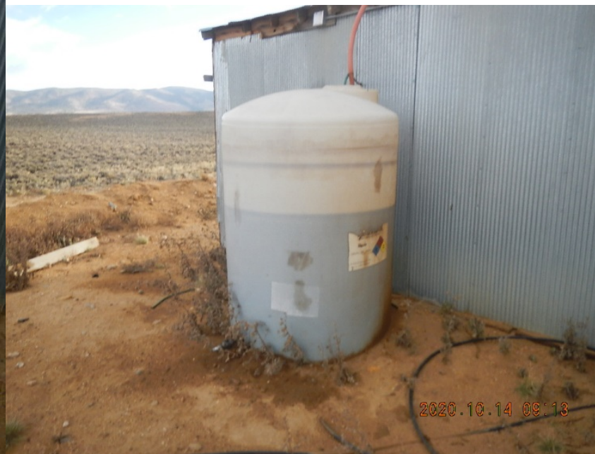
Unlabeled but placard tank. Contents unknown.