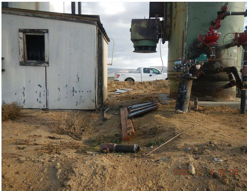
Unused equipment and trash.

Location Name: Dwinell Tank Battery Location ID: 324591; Spill ID: 473059; REM 15326; Pit ID: 115239