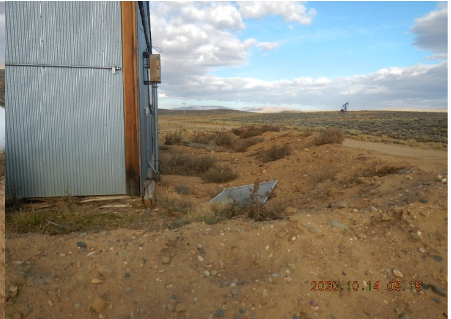
Weed and debris.