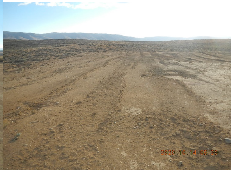
Apparent recently constructed fireline around location.