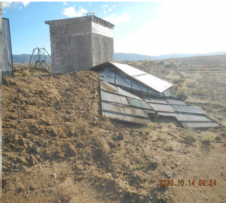
Unused equipment and trash.