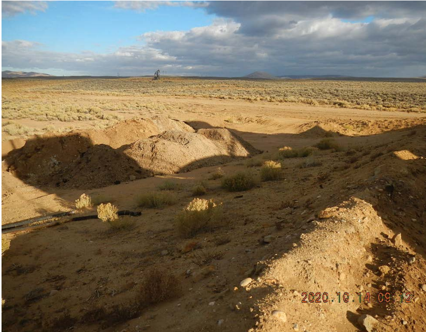
Unused equipment (hoses) and material generated from remediation efforts.

Location Name: Dwinell Tank Battery Location ID: 324591; Spill ID: 473059; REM 15326; Pit ID: 115239