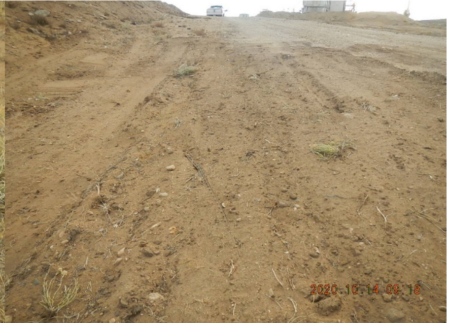
Trash/debris. Note metal fence post.