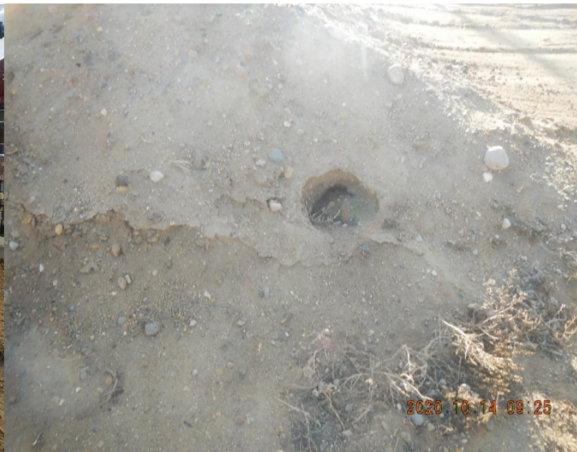
Burrow within secondary containment berm.