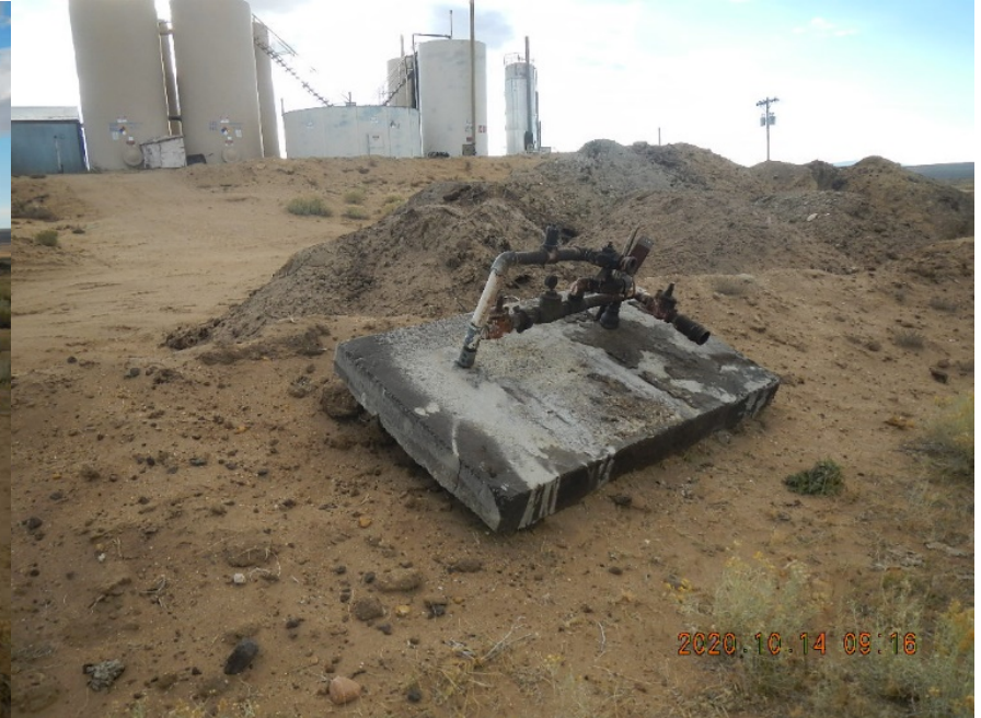
Unused equipment and debris. Impacted material from Spill ID 473059.