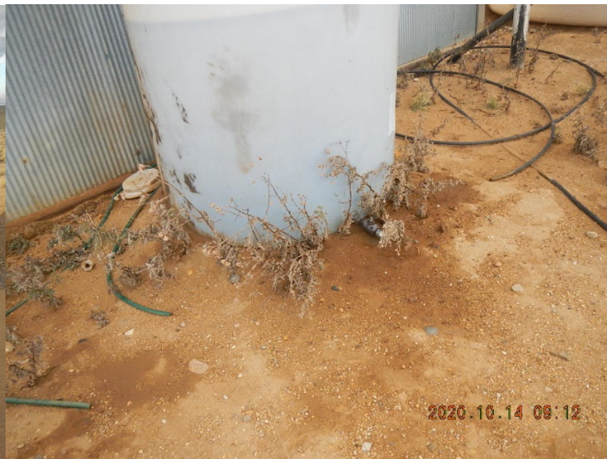
Hoses, debris, and weeds.