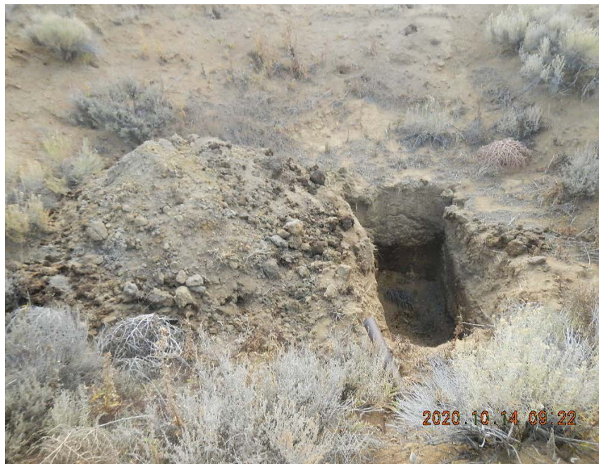
Bell hole dug in base of pit. Visual hydrocarbon impacts.

Location Name: Dwinell Tank Battery Location ID: 324591; Spill ID: 473059; REM 15326; Pit ID: 115239