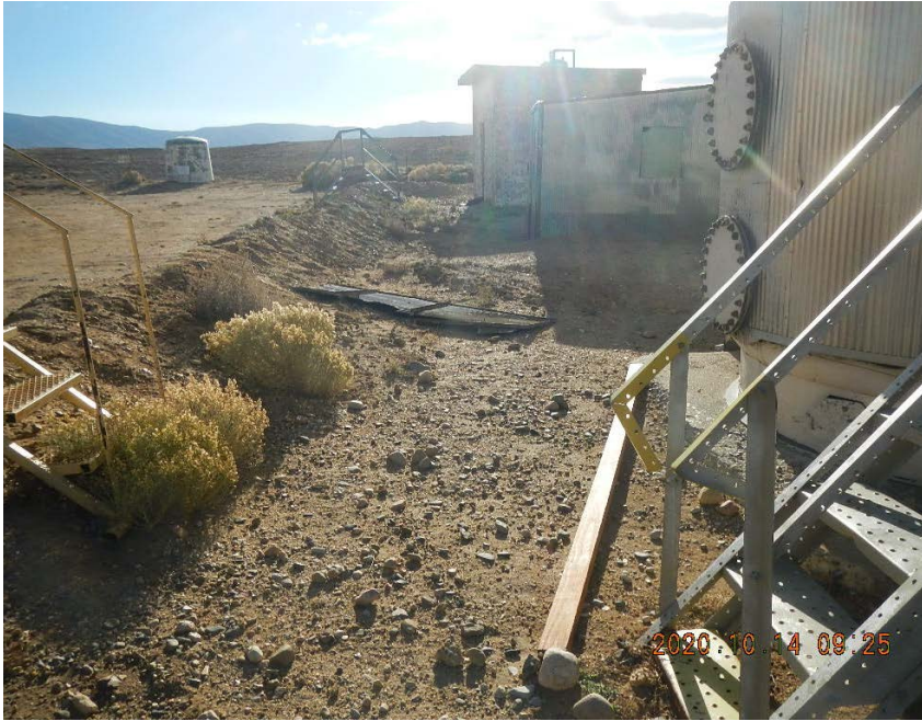
Weeds, trash, and debris.

Location Name: Dwinell Tank Battery Location ID: 324591; Spill ID: 473059; REM 15326; Pit ID: 115239