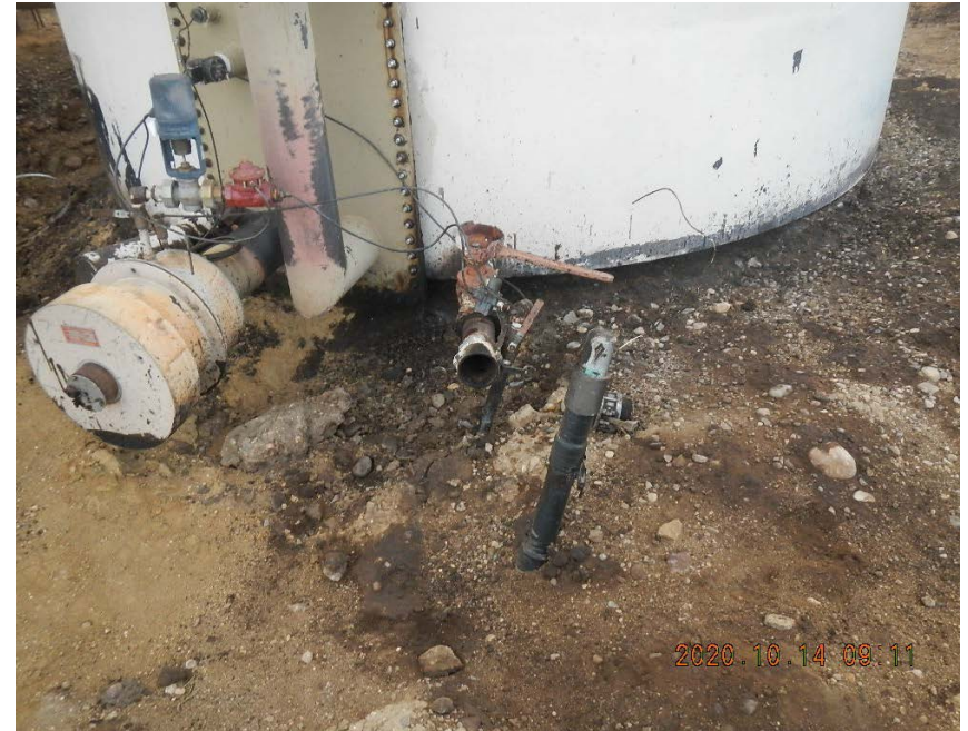
Unmarked flowline risers.