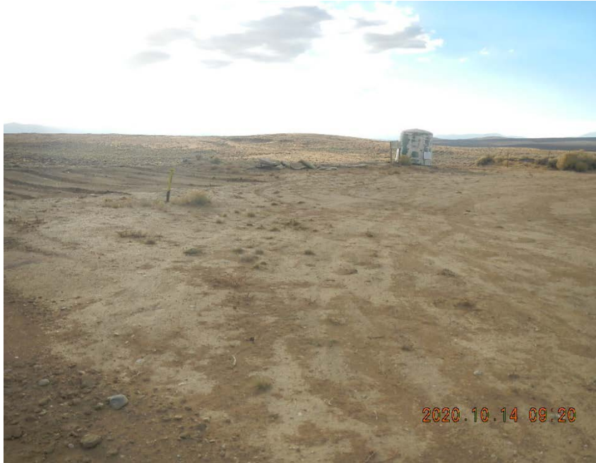
Apparent recently constructed fireline around location.

Location Name: Dwinell Tank Battery Location ID: 324591; Spill ID: 473059; REM 15326; Pit ID: 115239