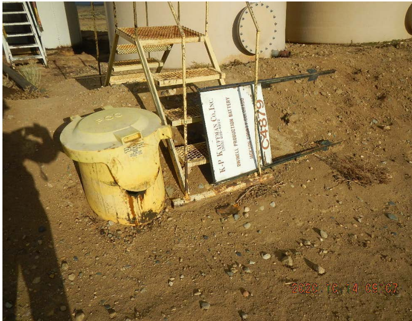
Tank battery Sign.

Location Name: Dwinell Tank Battery Location ID: 324591; Spill ID: 473059; REM 15326; Pit ID: 115239