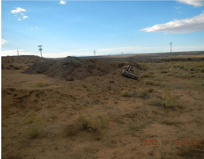
Unused equipment and debris. Impacted material from Spill ID 473059.

Location Name: Dwinell Tank Battery Location ID: 324591; Spill ID: 473059; REM 15326; Pit ID: 115239