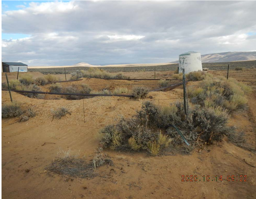
Pit Facility ID: 115239

Location Name: Dwinell Tank Battery Location ID: 324591; Spill ID: 473059; REM 15326; Pit ID: 115239