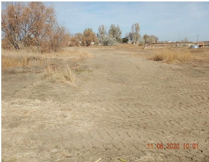
View of UPPR 43 PAN AM G Consolidation flowline trench after being backfilled and re-contoured; Looking N-NW