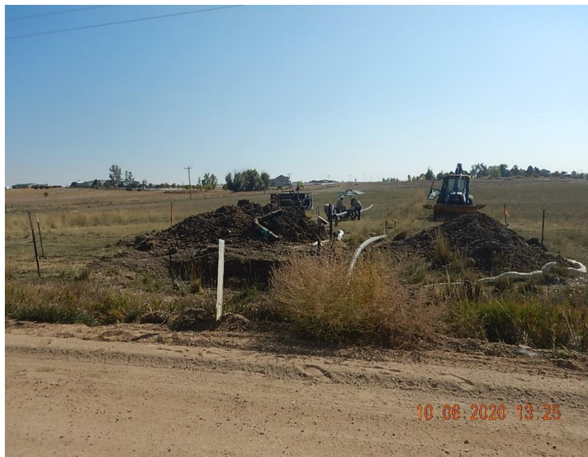
KPK roustabout crew in process of completing HDPE poly fusion welding to construct new consolidation flowline; View S from WCR 4