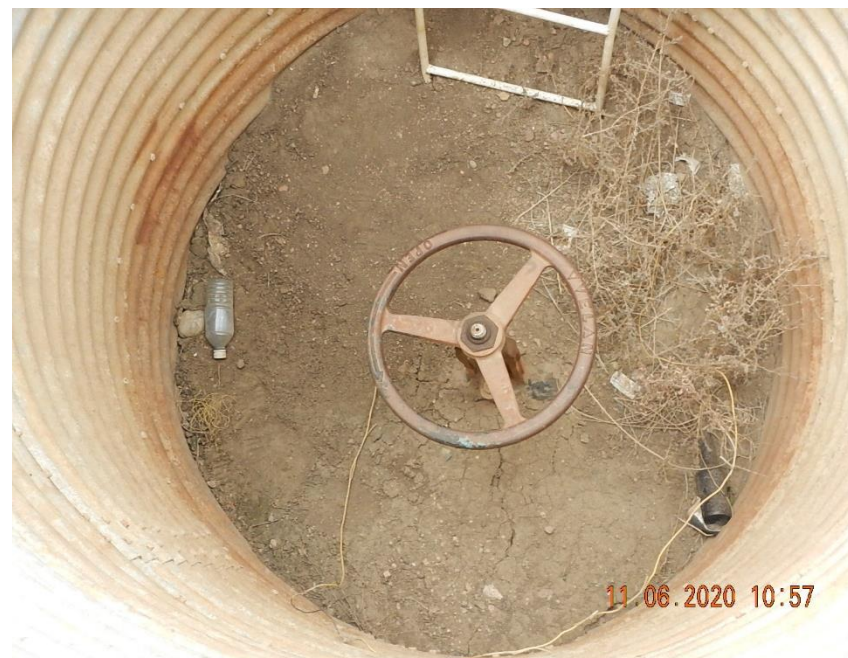
View into SE flowline isolation valve can; Valve handle