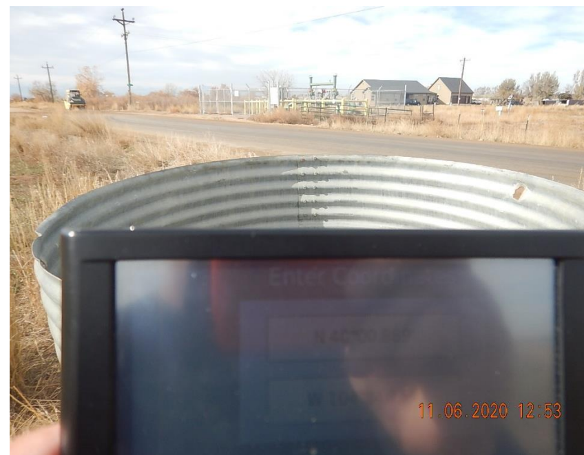
View and location of SE isolation valve; looking NW