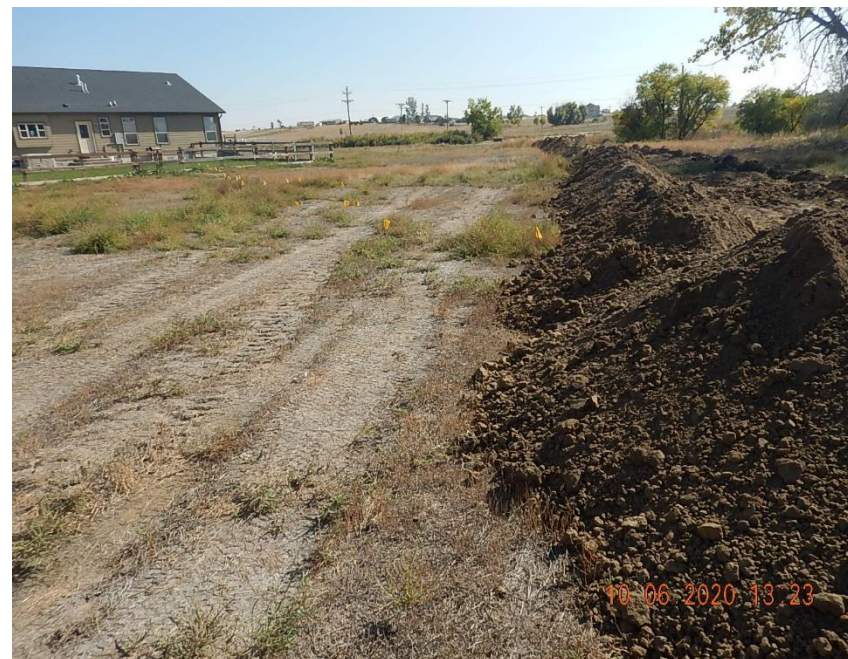
View of existing (abandoned/ OOS) flowline marked with pin flags; view of new flowline trench/ spoil pile (realignment) to the west; View looking S-SE