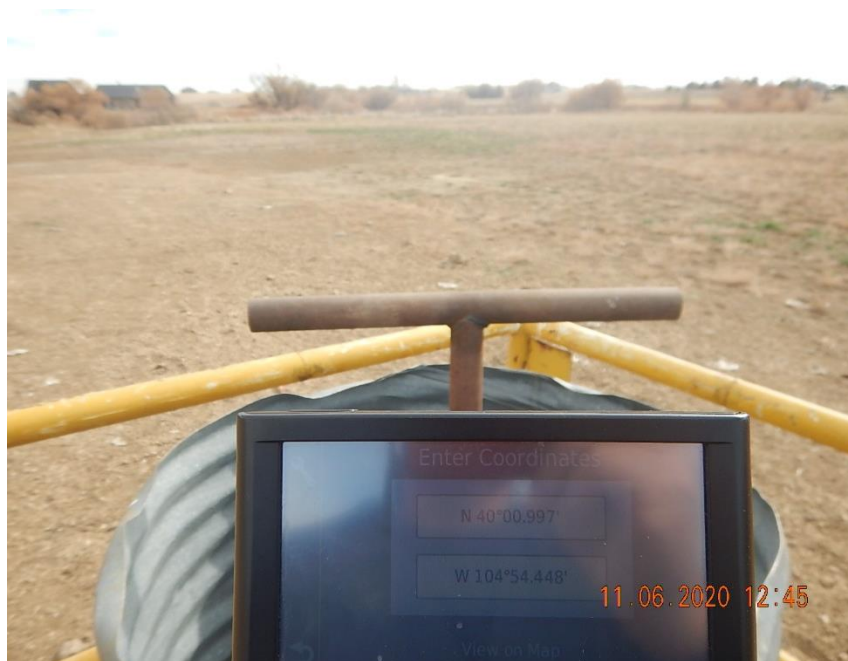
View and location of NW isolation valve; looking SE