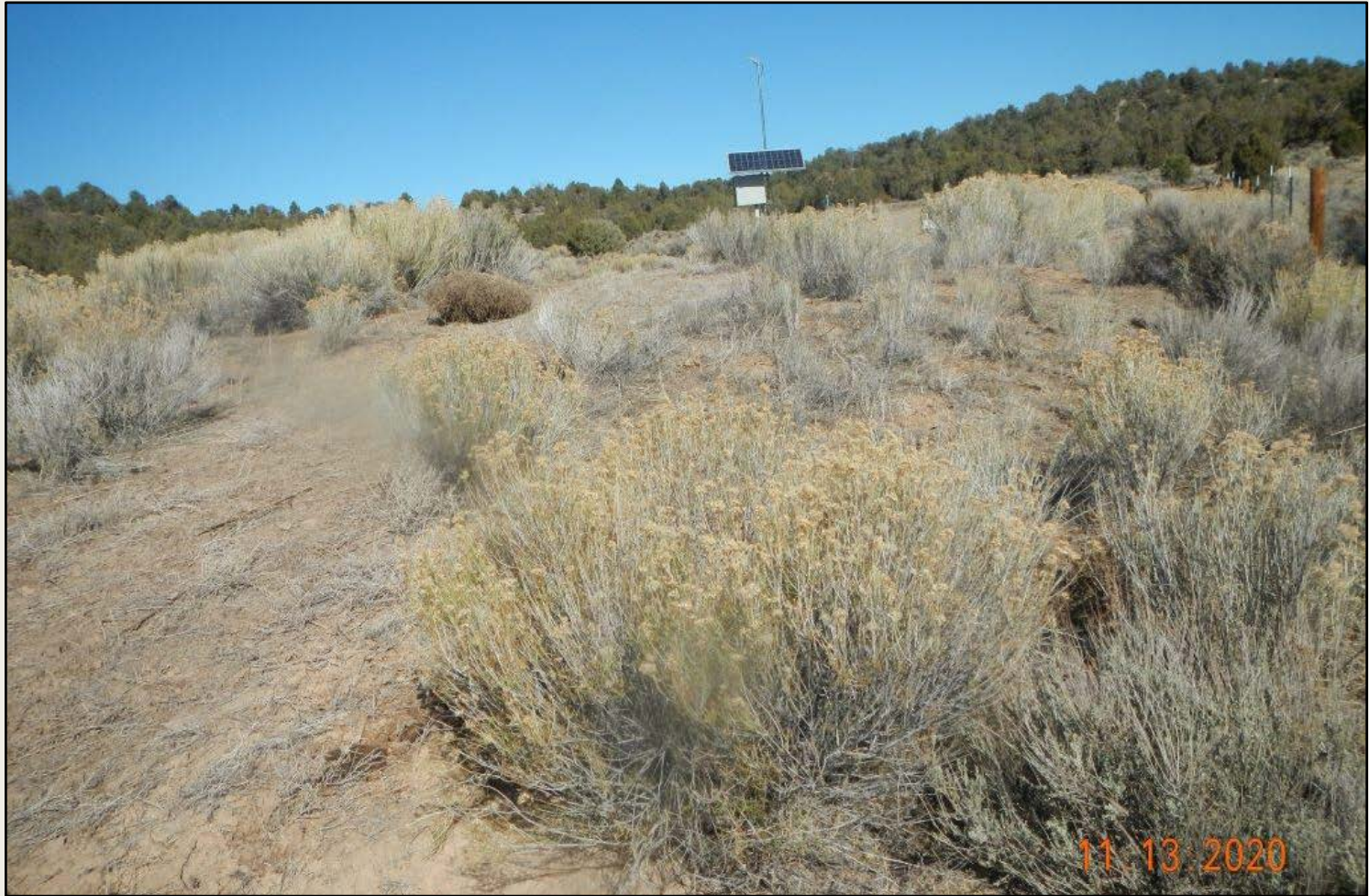
Photo 4. View of the eastern project area from the southeastern corner facing northward.