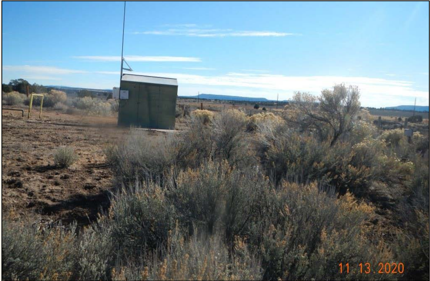
Photo 2. View of the southern project area from the southwestern corner facing eastward. Revegetation is progressing with sagebrush and rubber rabbitbrush.