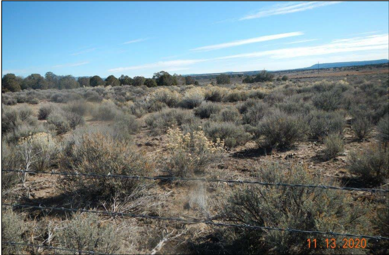
Photo 5. View of reference area comprised of sagebrush shrubland with purple threeawn, James galleta, thickspike wheatgrass, and prickly pear.