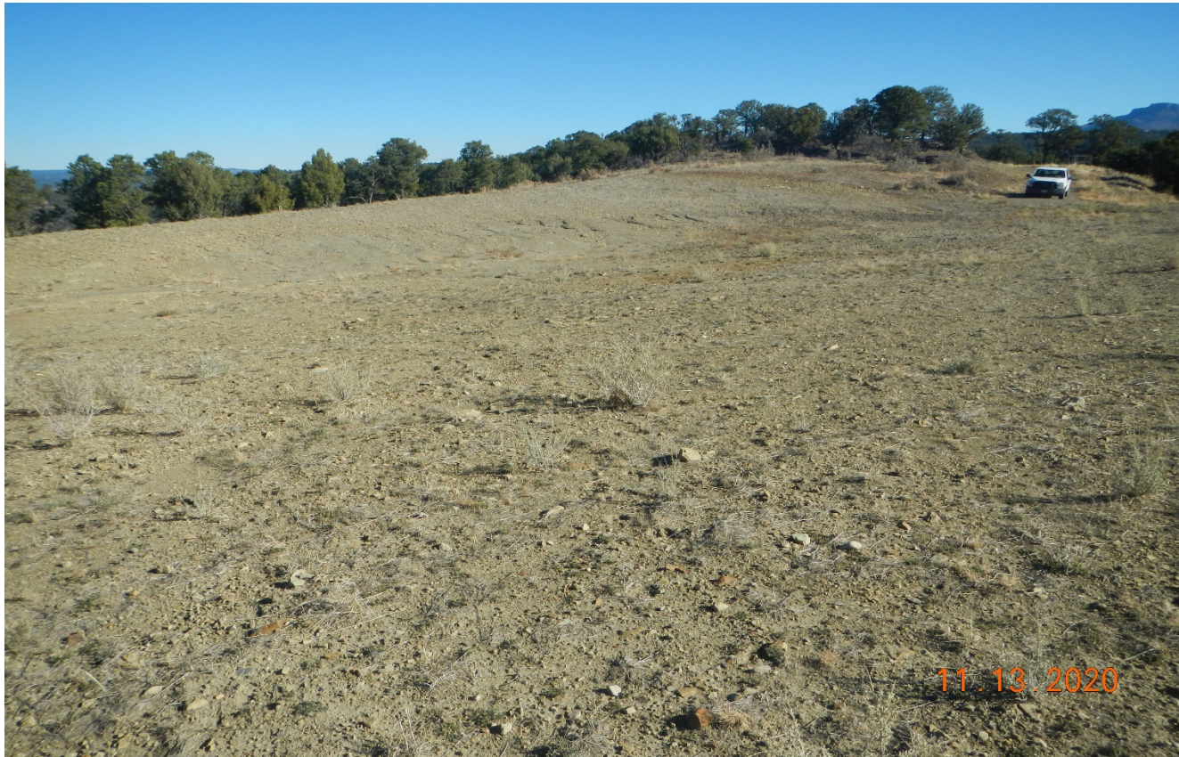
Photo 6. Facing east toward the location. Vegetation has not established at the location.