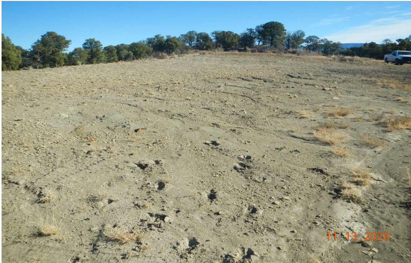
Photo 8. Facing northeast at the location. The location is not stabilized and there are signs of erosion.