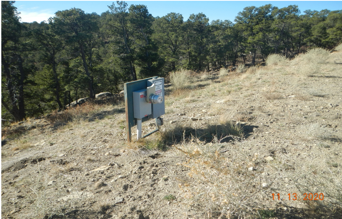
Photo 5. There is an electric utility that remains at the southwest side of the location.