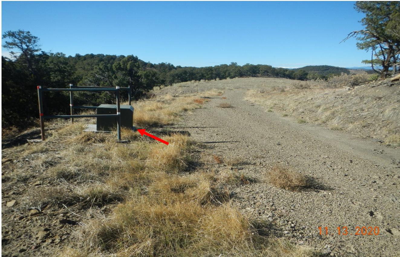
Photo 3. Facing southwest along the access road toward the location. The electric utility remains along the road.