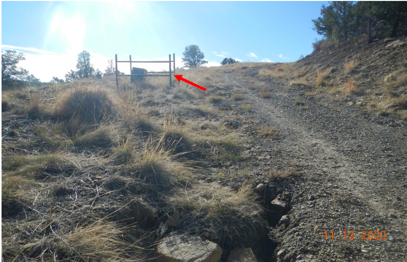
Photo 2. Facing south along the access road. The electric utility remains along the road.