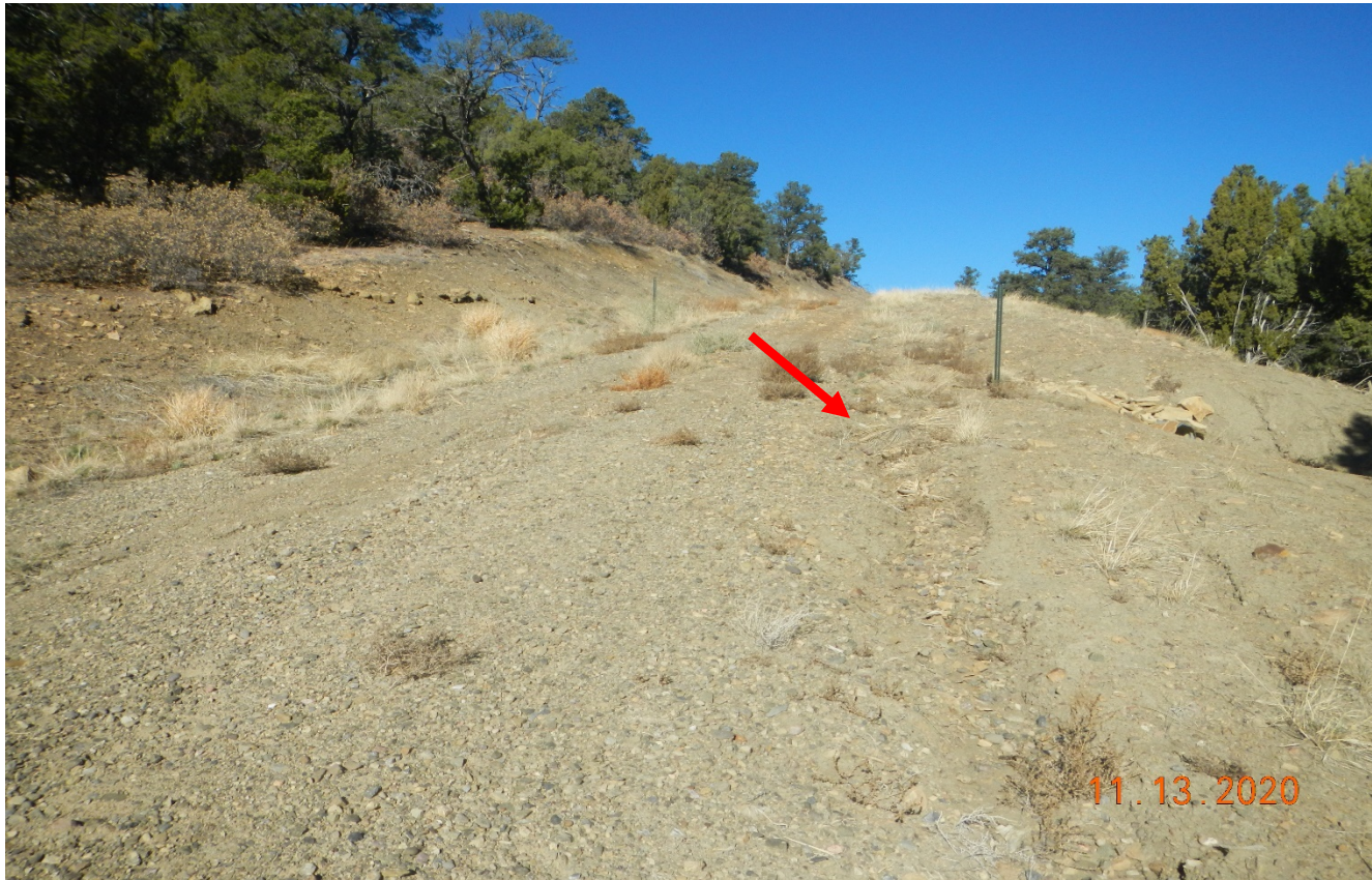
Photo 1. Facing northwest the beginning of the access road. The road has not been recontoured and reclaimed. There are signs of stormwater erosion down the road.