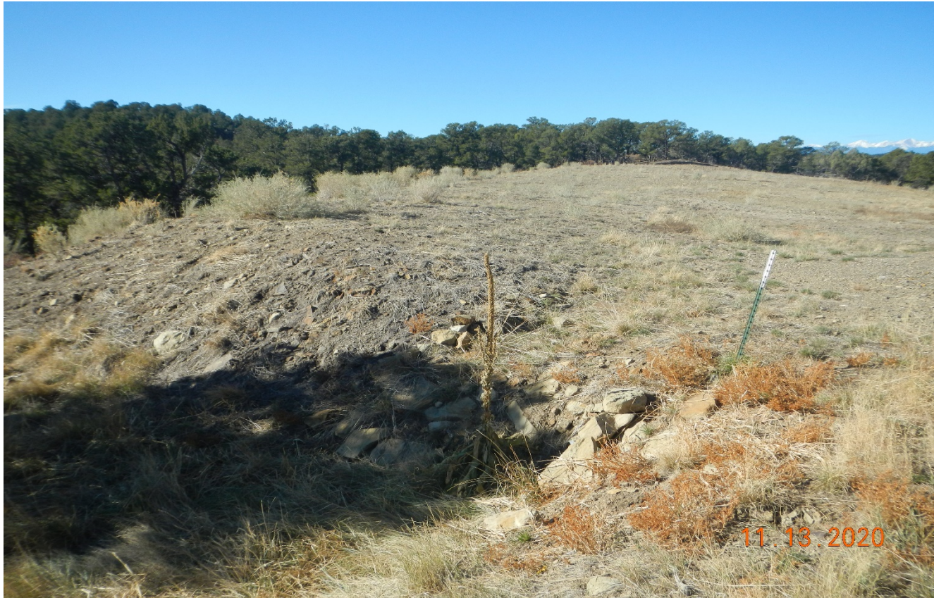
Photo 4. Facing southwest toward the fill slope of the location. The location has not been recontoured.