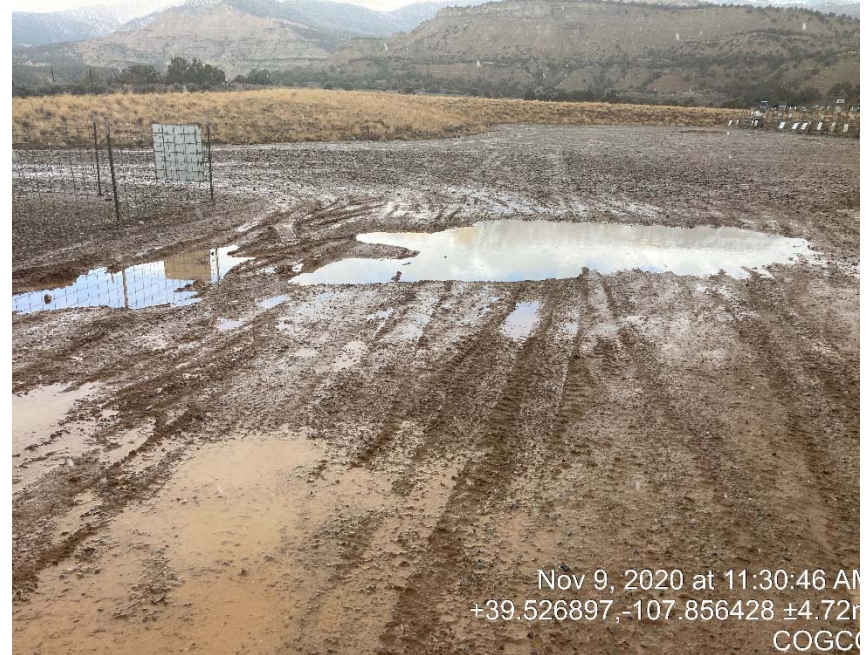
lack of tracking controls