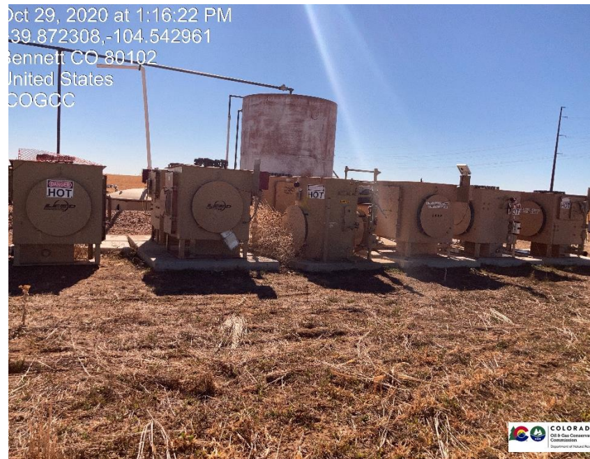
Pic 8 unused equipment

Oct 29, 2020 at 1:16:22 PM 39.872308,-104.542961 Bennett CO 80102 United States COGCC