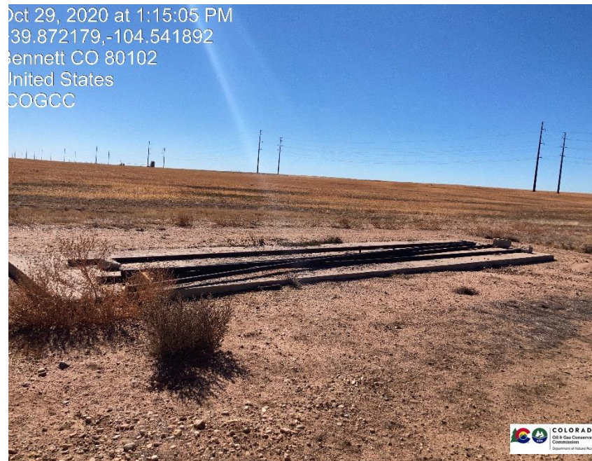
Pic 4 unused equipment tubing

Oct 29, 2020 at 1:15:05 PM 39.872179,-104.541892 Bennett CO 80102 United States COGCC