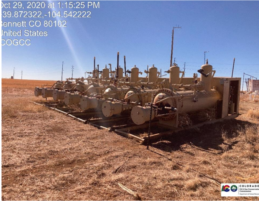
Pic 5 unused equipment

Oct 29, 2020 at 1:15:25 PM 39.872322,-104.542222 Bennett CO 80102 United States COGCC