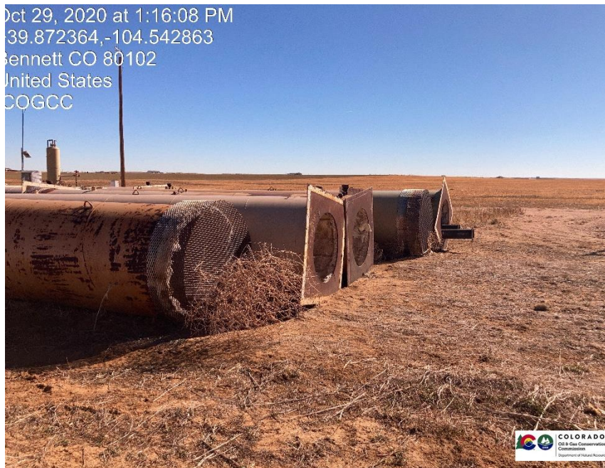
Pic 7 unused equipment

Oct 29, 2020 at 1:16:08 PM 39.872364,-104.542863 Bennett CO 80102 United States COGCC