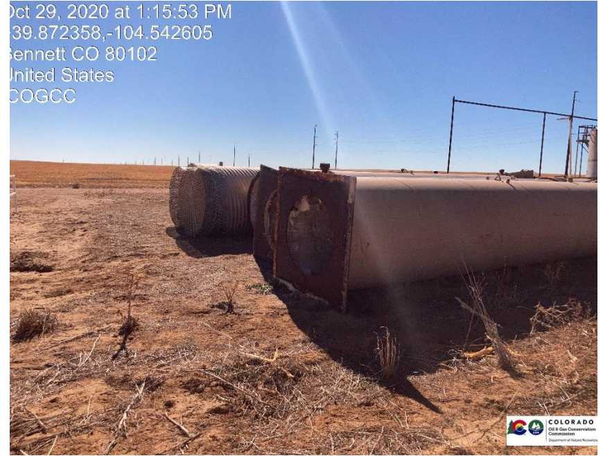
Pic 6 unused equipment

Oct 29, 2020 at 1:15:53 PM 39.872358,-104.542605 Bennett CO 80102 United States COGCC