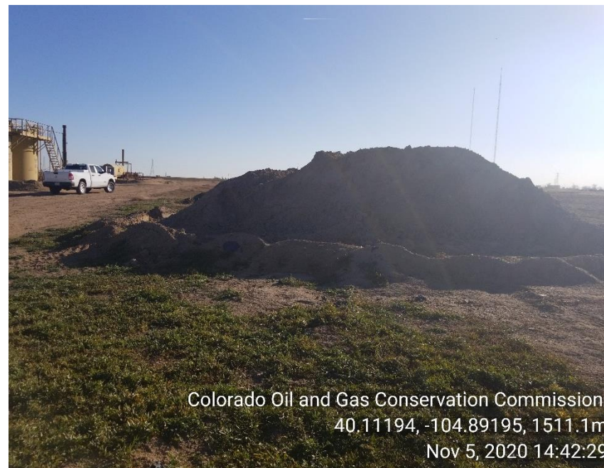
Photo 13 BMP around material from spill remediation not adequate.