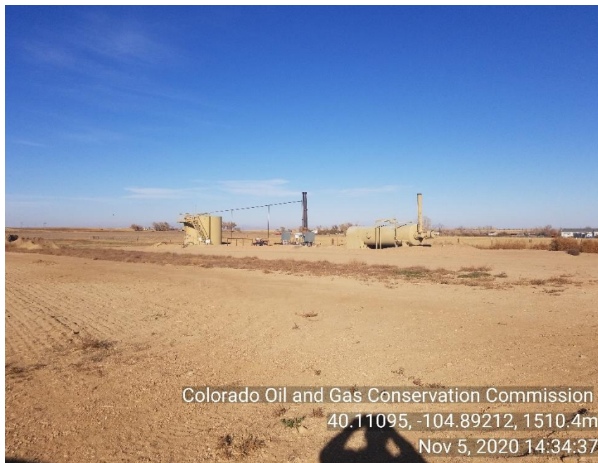
Photo 3 Marvin E. Schutt Unit 1 Treating Facility loc pic