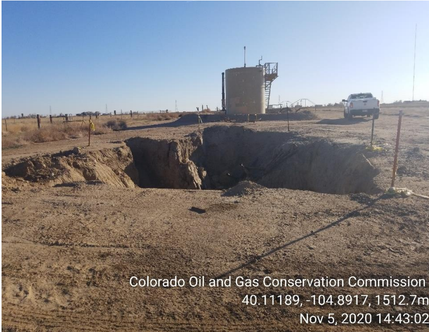
Photo 14 no BMP's around spill remediation in place. No safety fence.