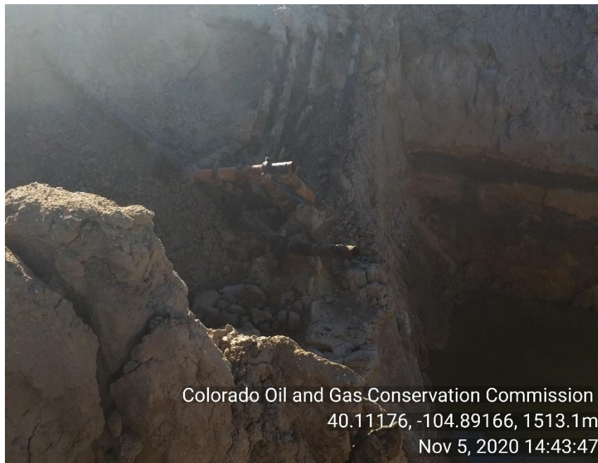
Photo 16 15 Flow lines in excavation not capped or bull plugged and damaged. Stained soil from flow lines leaking.