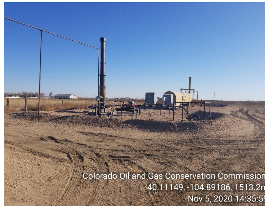
Photo 4 production equipment. Pilot does not appear to be lit on ECD and is venting gas.