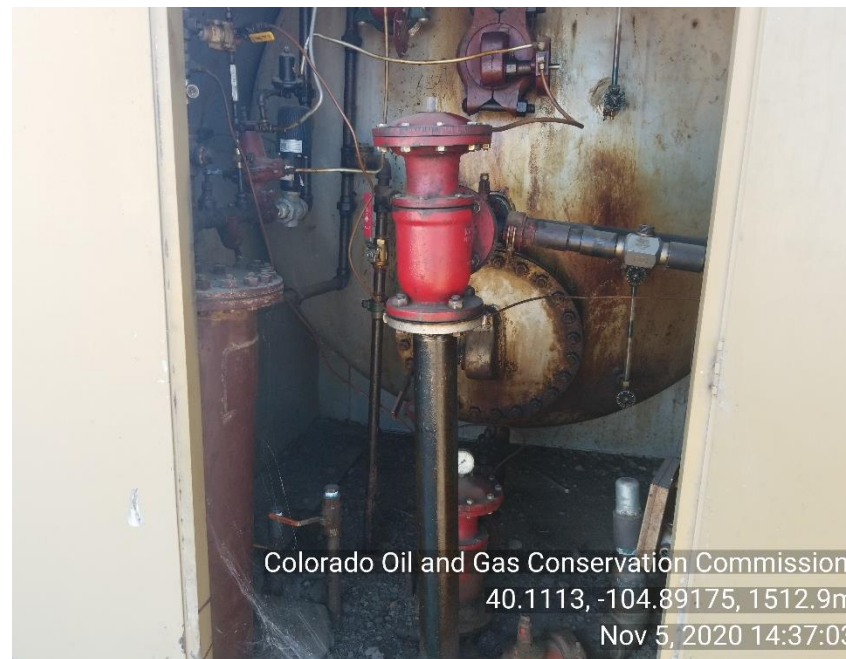
Photo 6 HOZ sep Mechanical issue: piping appear to be wet and seeping.