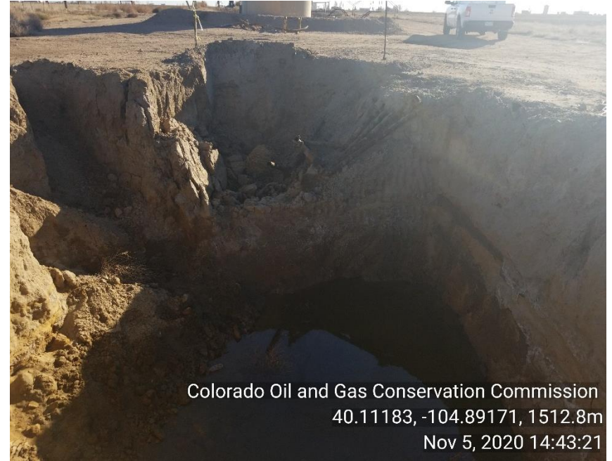
Photo 15 Flow lines in excavation not capped or bull plugged and damaged. Stained soil from flow lines leaking.