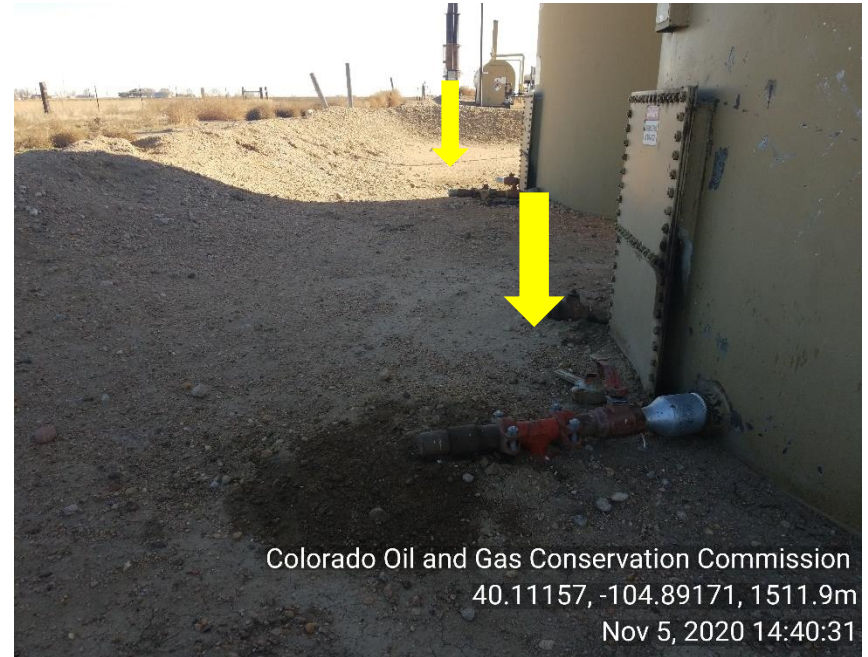
Photo 8 Mechanical issue: back side load lines leaking south crude oil tank actively leaking . Stained soil under each 2" line on crude oil tanks.