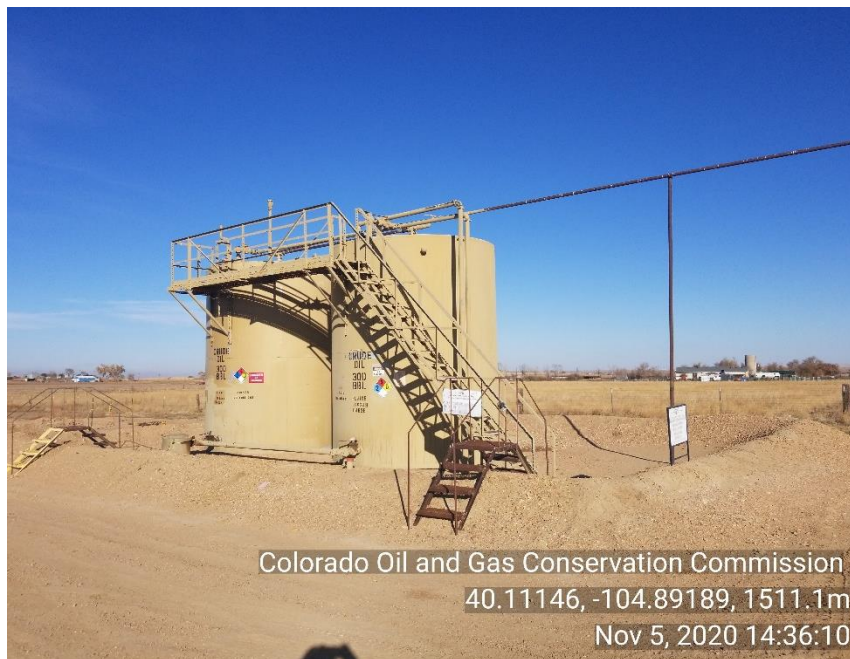
Photo 5 TNK BTRY