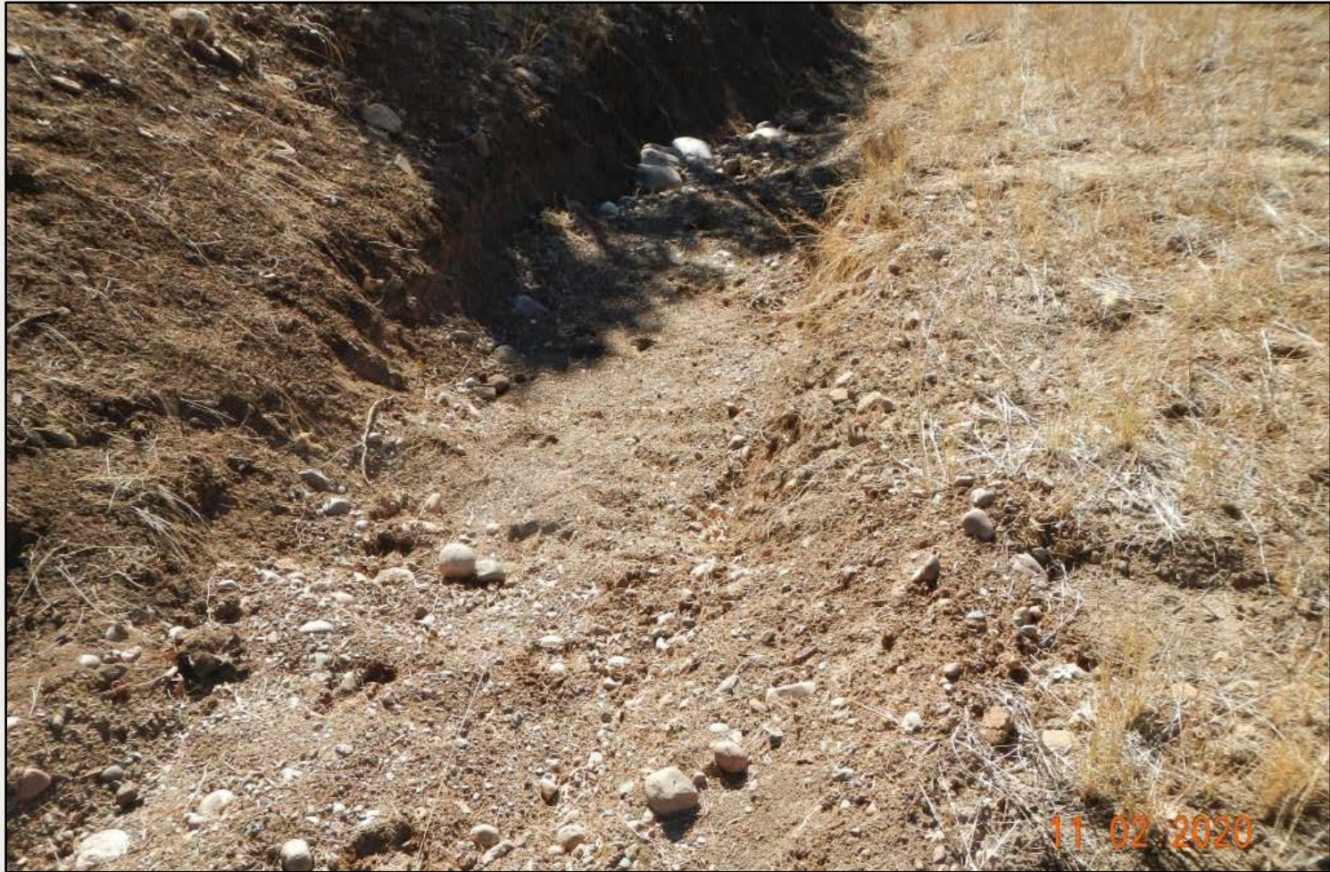
Photo 4. View of repaired headcut within the southeastern corner of the project area. Bare soils need additional stabilization.