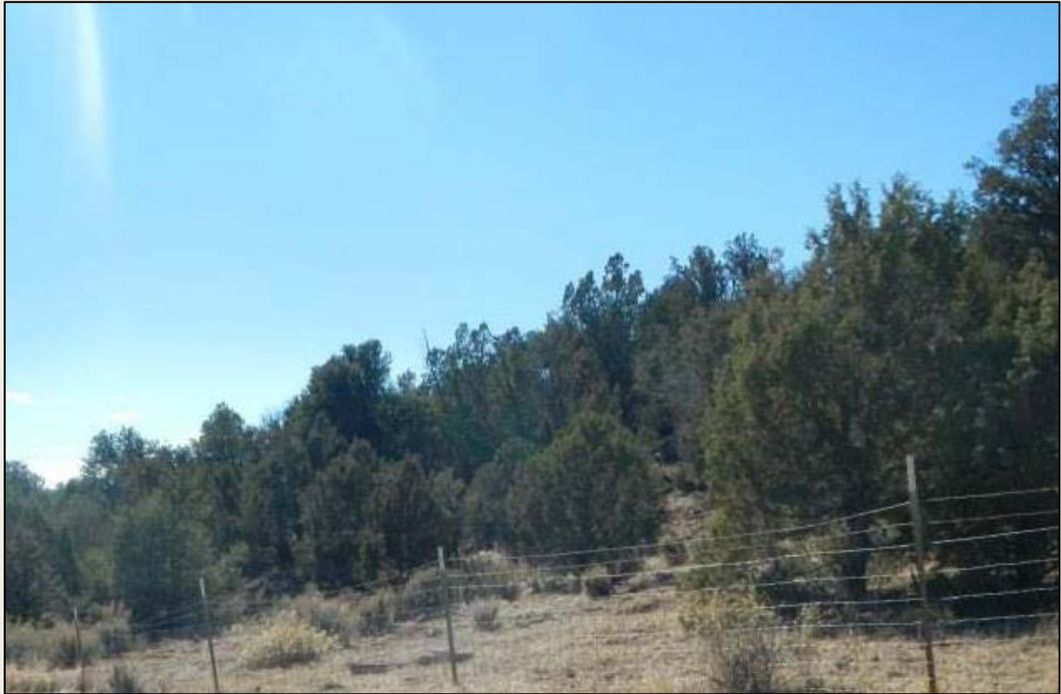
Photo 5. View of reference area comprised of pinyon/juniper woodland with understory of sagebrush, mountain mahogany, squirreltail, and western wheatgrass.