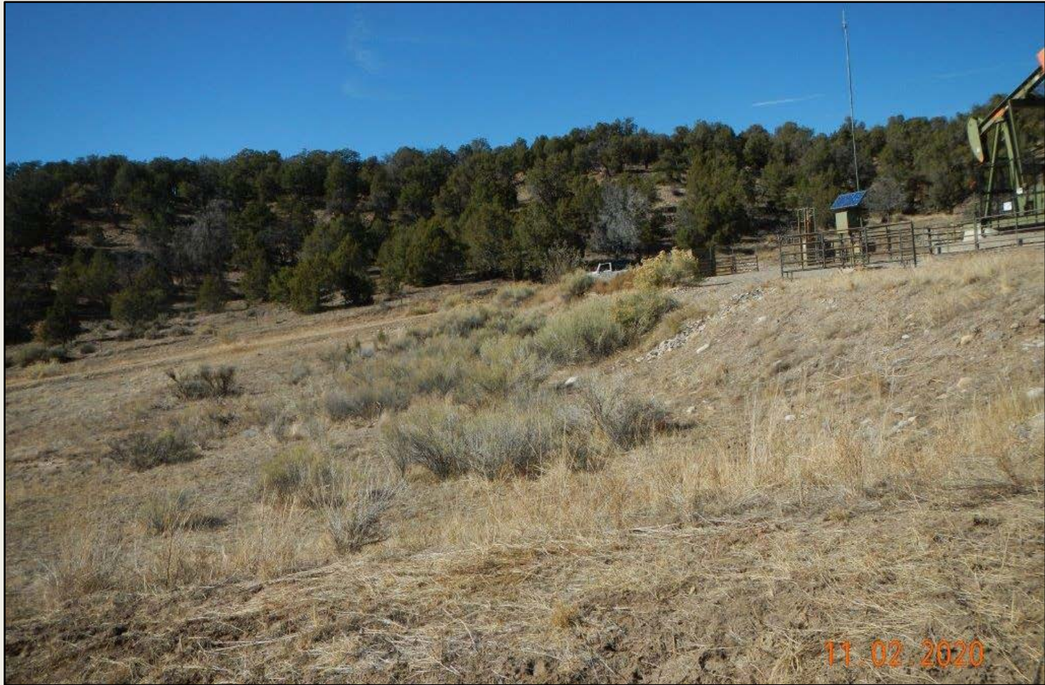
Photo 2. View of the southern fill slope from the southeastern corner facing westward. Revegetation is progressing with rubber rabbitbrush, western wheatgrass, and crested wheatgrass.