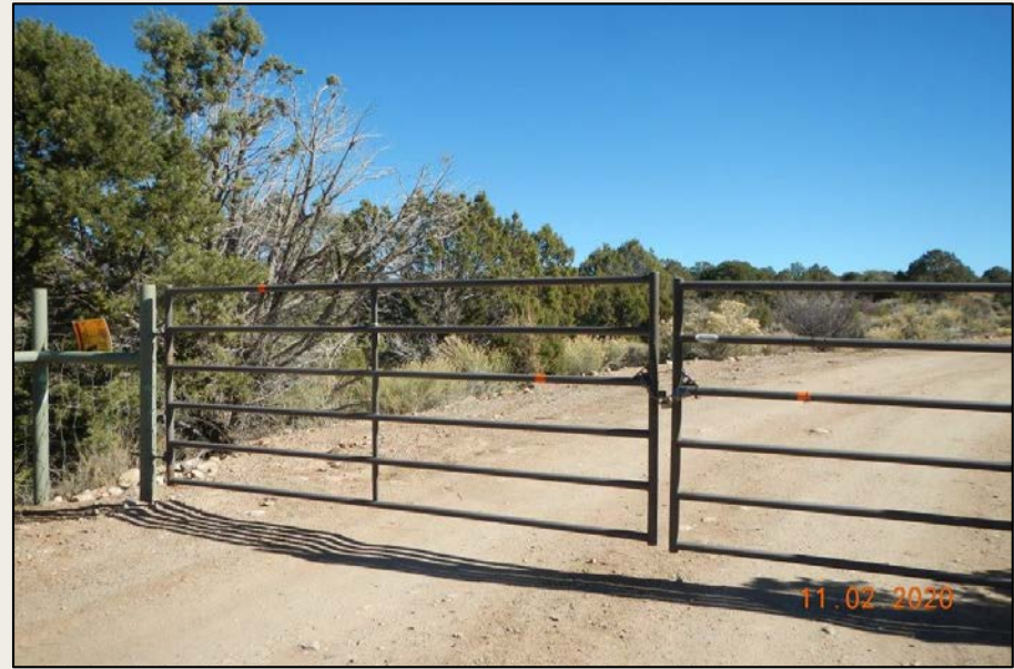
Photos 6/7. View of closed gates after entering (left) and leaving (right) project area.