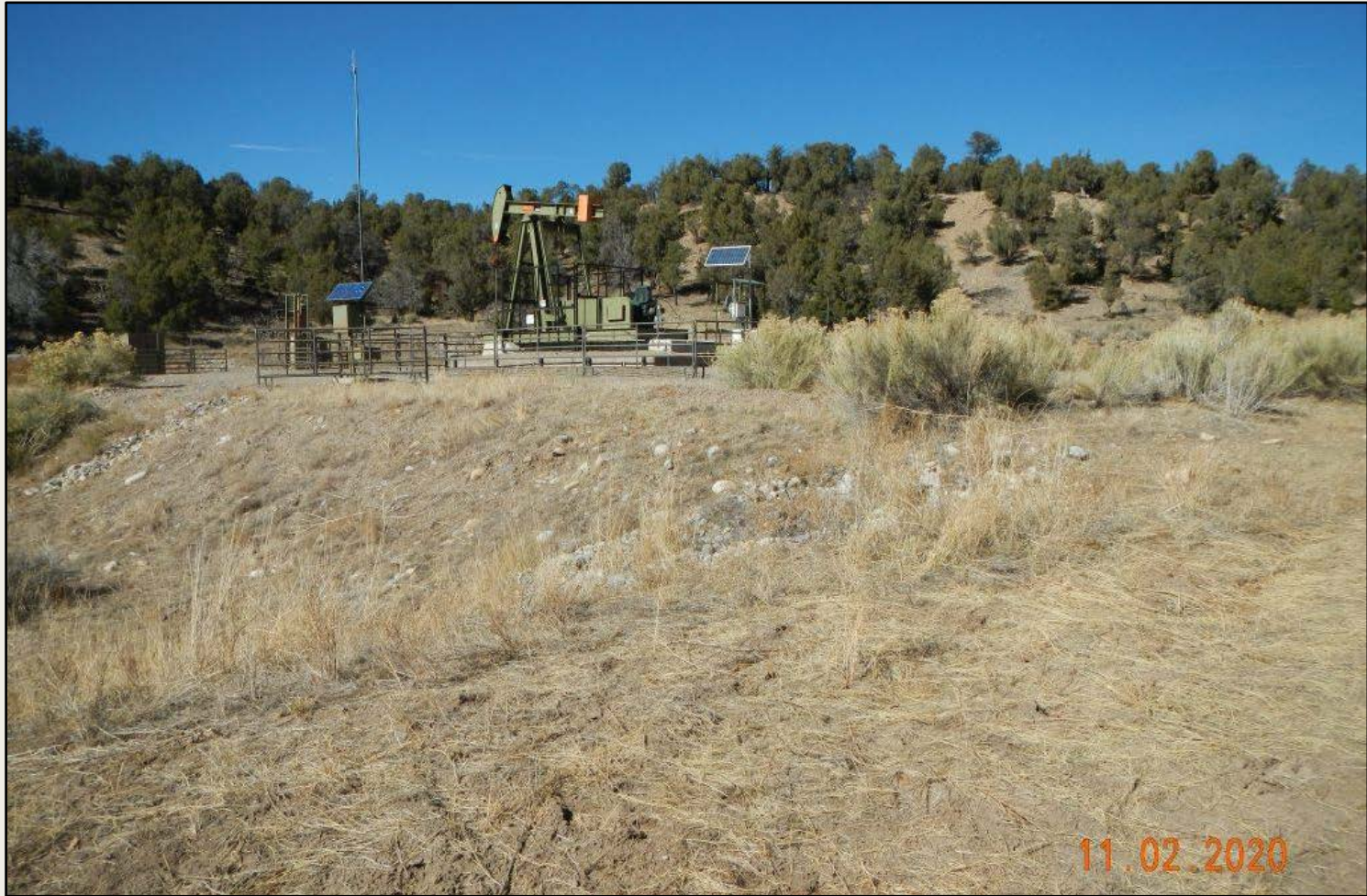
Photo 1. View of the project area from the southeastern corner facing center.