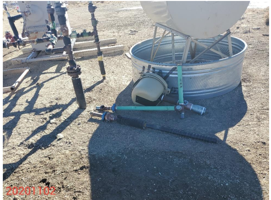
Photo 8: Photo shows unused pipe equipment stored behind the methanol tank.