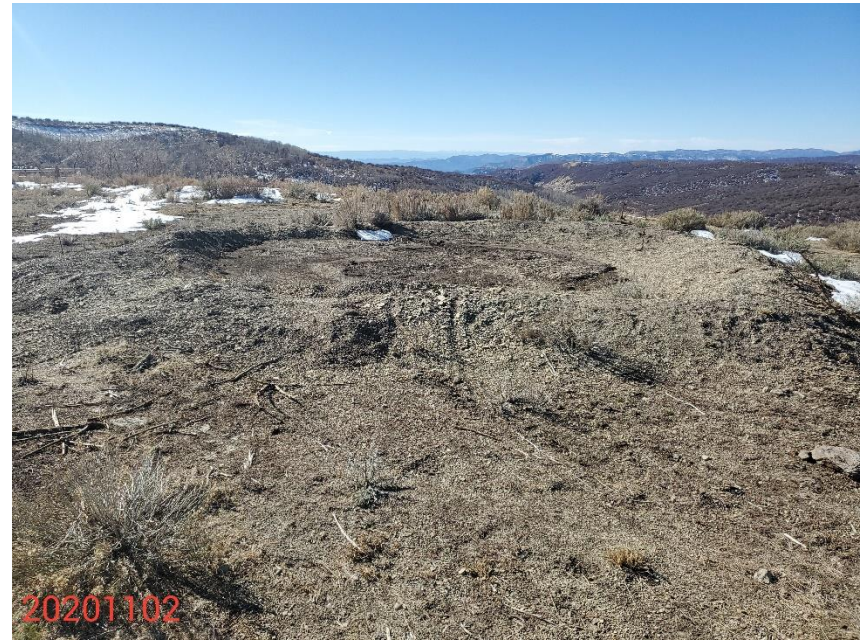
Photo 4: Photo shows 200 bbl condensate tank has been removed. Area does not appear needed for production and is now subject to 1003 interim reclamation