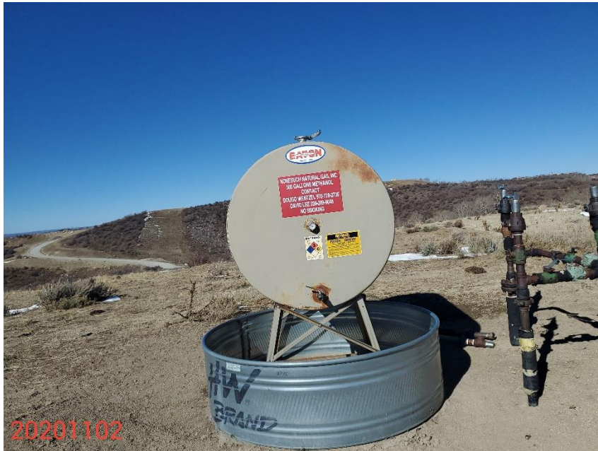
Photo 7: Photo shows methanol tank on the Location. It is unclear to the COGCC as to what the equipment's current use is on the Location, and if equipment is considered active.