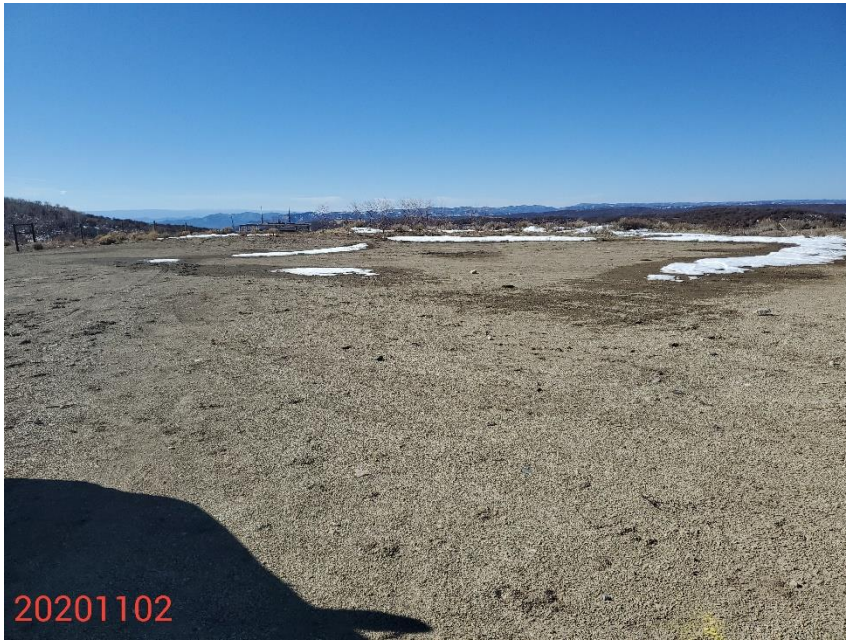
Photo 1: Photo taken from the east end of the Location, facing south. Photos 1-3 provide an overview of the production area from east, west to northwest.