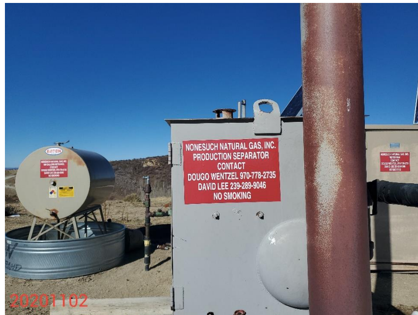
Photo 6: Photo shows separator equipment on Location. It is unclear to the COGCC at to what the equipment's current use is on the Location, and if equipment is considered active.