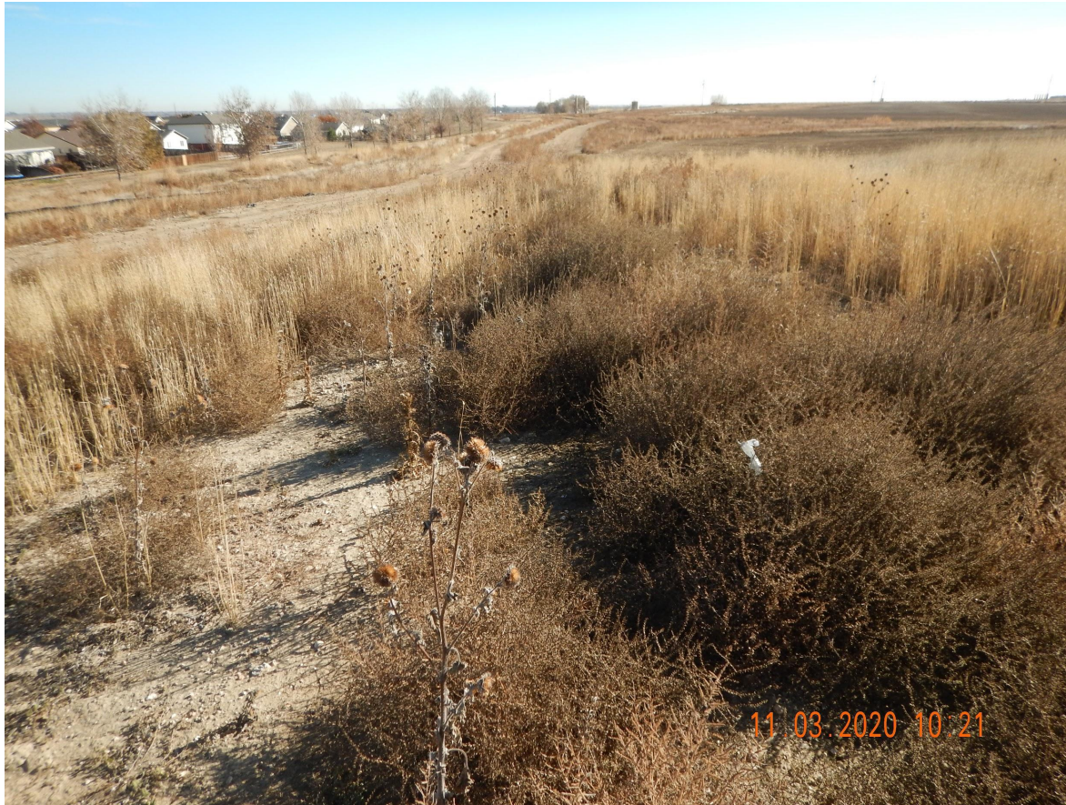
Photo 5. Photo taken from the northeastern well and tank battery location, facing East along the access road. See comments under Photo 1.