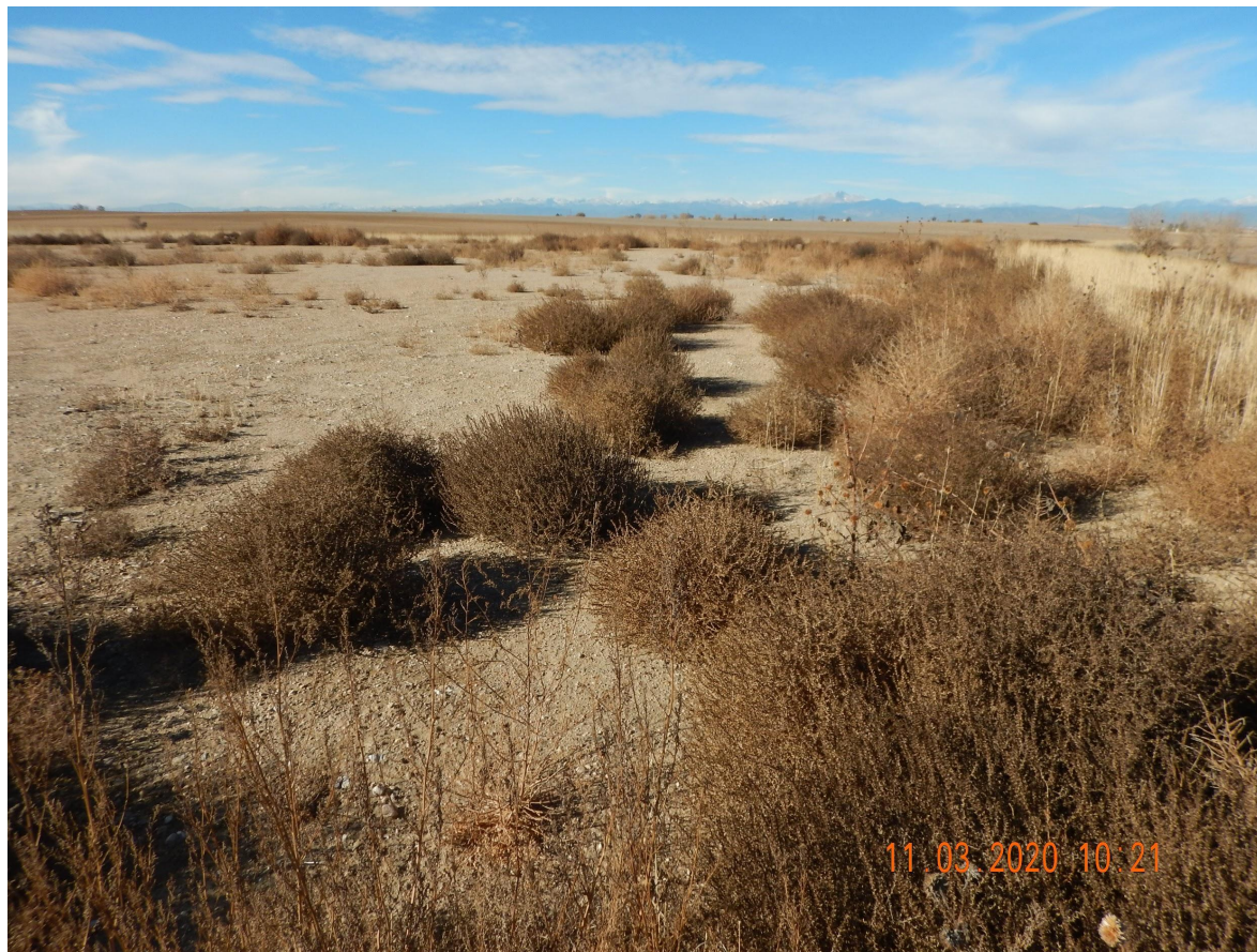
Photo 4. Photo taken from the northeastern well and tank battery location, facing West. See comments under Photo 1.