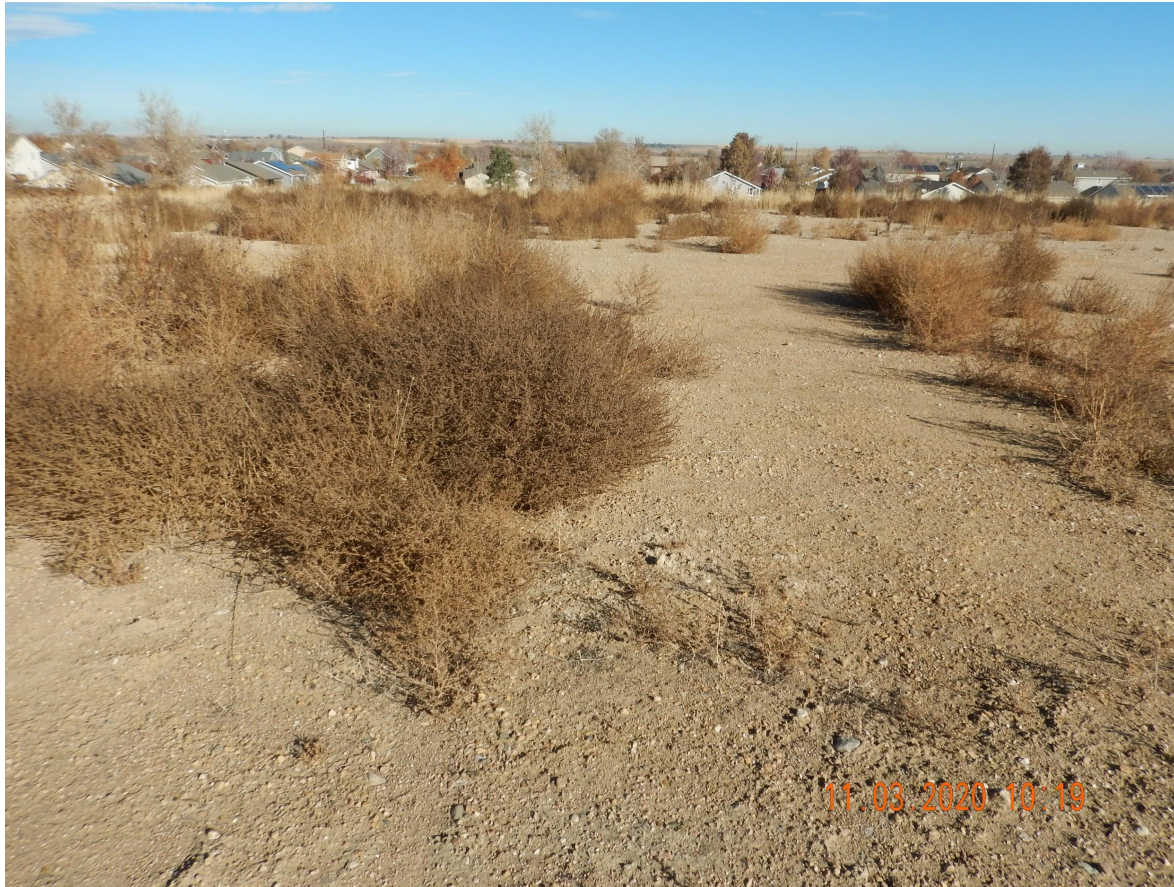
Photo 2. Photo taken from the western well and tank battery location, facing North. Photo illustrates the Operator has failed to perform final reclamation activities per Rule 1004. Also, unmanaged weeds (Russian thistle and Kochia) were observed throughout the locations.