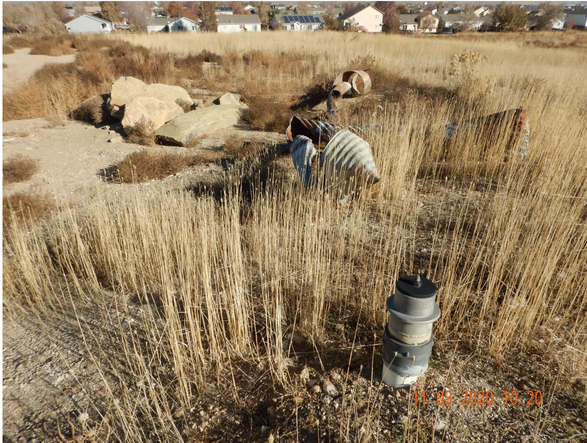
Photo 3. Photo taken from the eastern well and tank battery location, facing North. Photo illustrates the Operator has failed to perform final reclamation activities per Rule 1004 and remove debris.