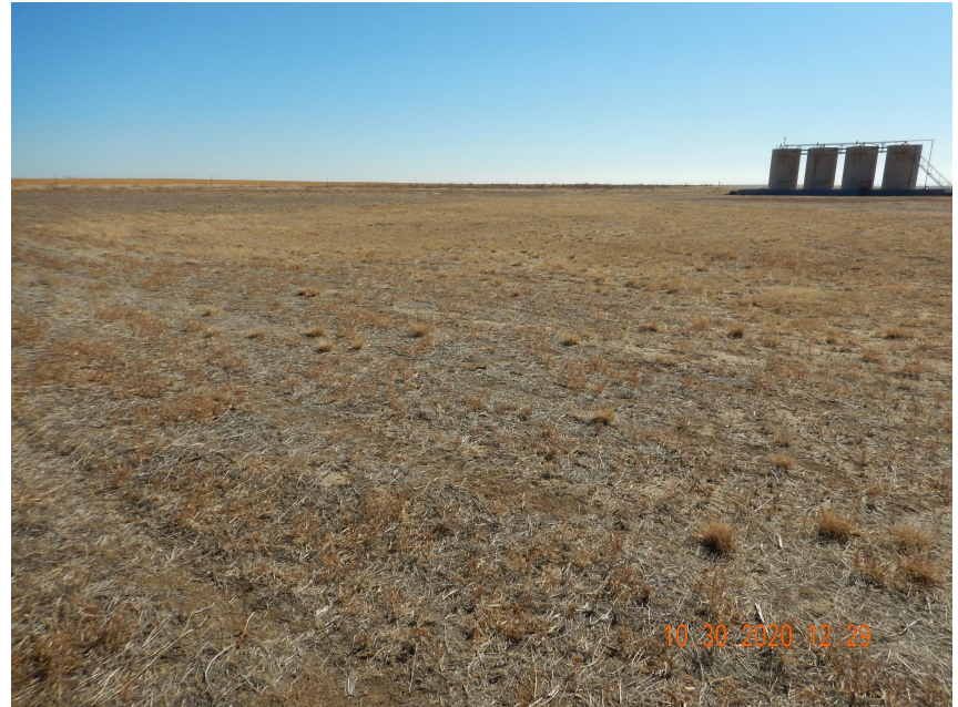
Photo 6. Photo taken from the northeastern well pad, facing Southeast. See comments under Photo 3.