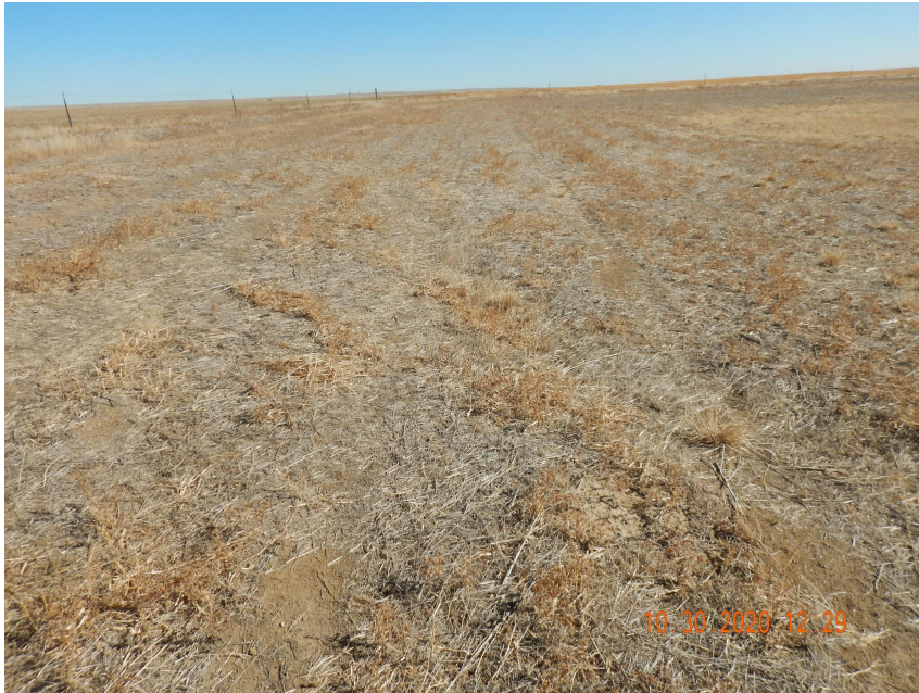
Photo 5. Photo taken from the northeastern well pad, facing East. See comments under Photo 3.