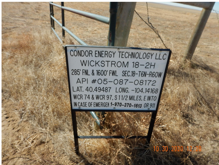
Photo 1. Photo taken from the entrance of location, facing South. Operator has failed to update the Operator Sign, which does not have an accurate emergency contact.