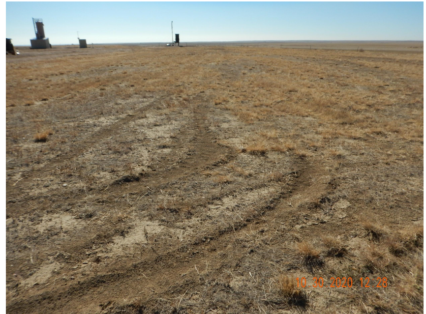
Photo 4. Photo taken from the northwestern well pad, facing South. See comments under Photo 3.