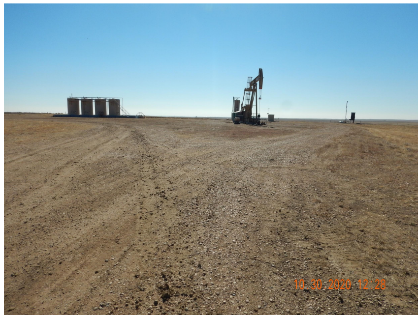
Photo 2. Photo taken from the northern well pad, facing South.