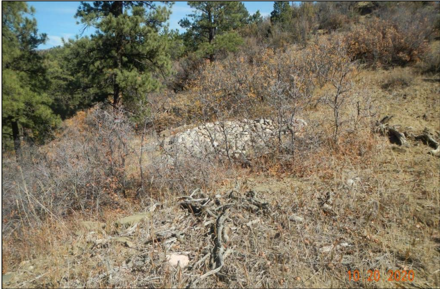
Photo 4. View of reference area vegetation comprised of ponderosa pine woodland with gambel oak, western wheatgrass, prairie junegrass, and Oregon grape in the understory.