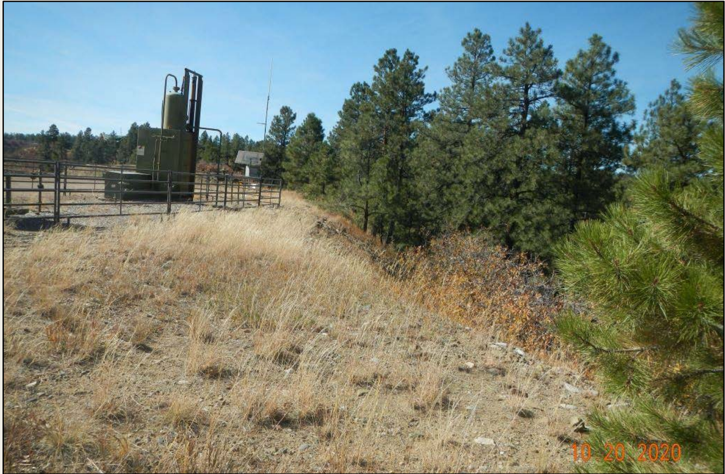
Photo 2. View of the northern project area from the northeastern corner facing westward. Revegetation is progressing with western wheatgrass and smooth brome.