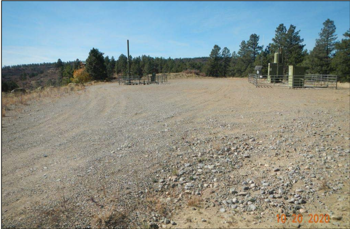
Photo 1. View of the project area from the well pad entrance facing center.