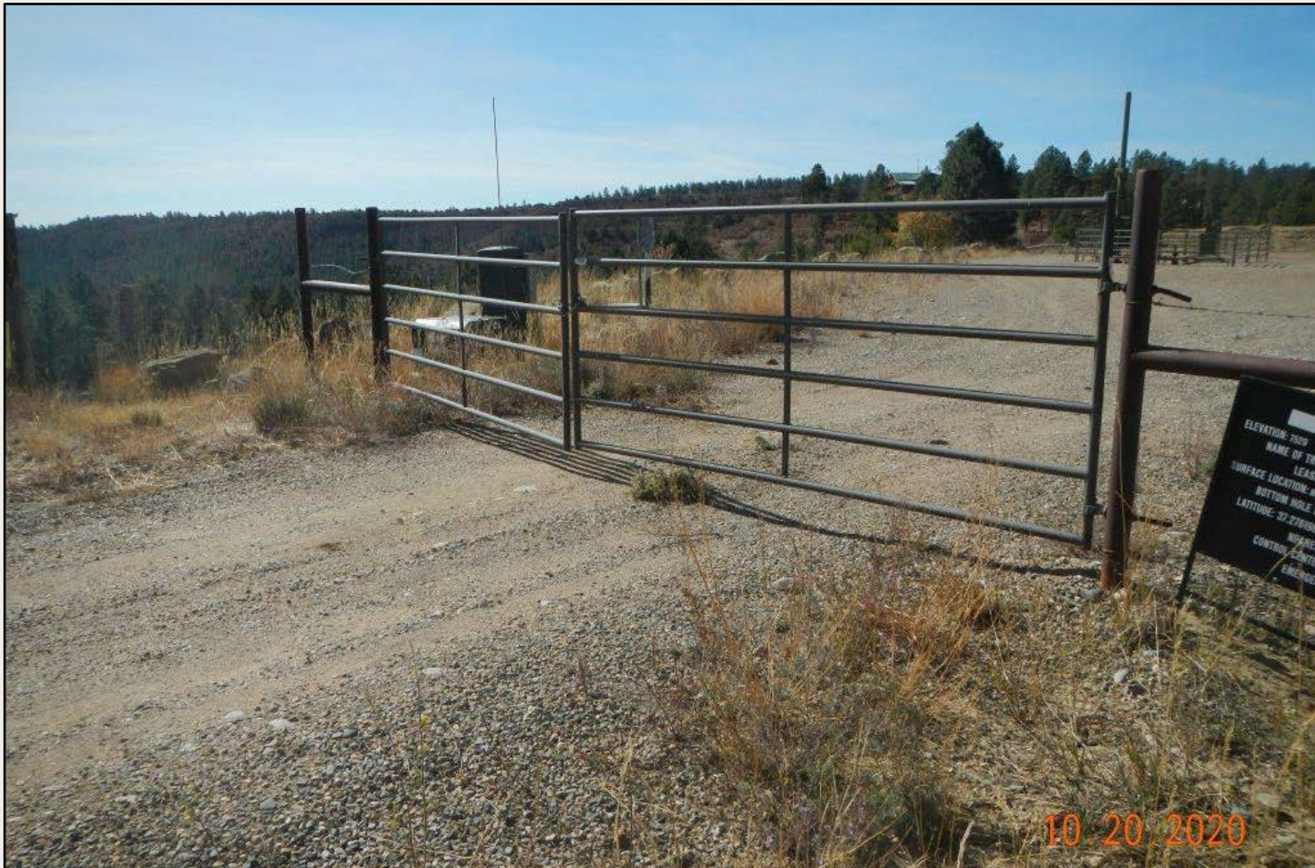
View of closed gate after exiting location.