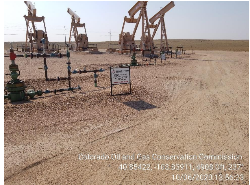
Photo 2 – North Wellheads