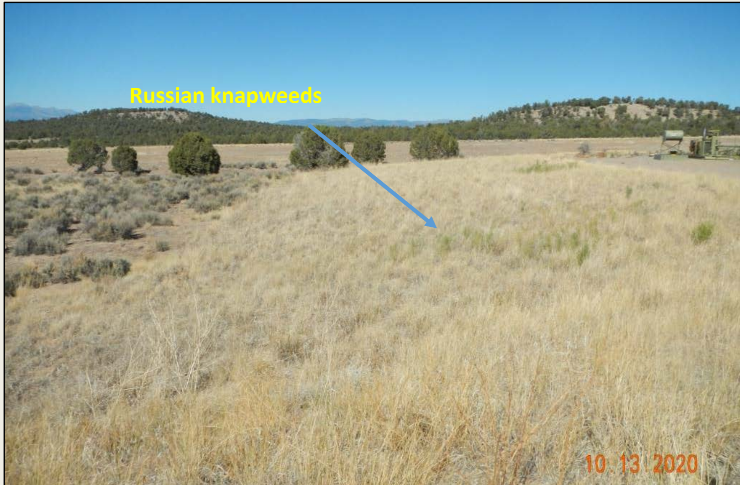
Photo 2. View of the western fill slope from the southwestern corner facing northward. Revegetation is progressing with crested wheatgrass, sand dropseed, and western wheatgrass. Russian knapweeds are scattered here.