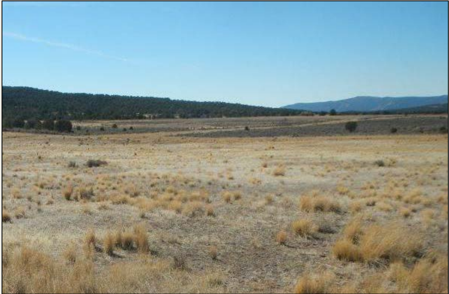
Photo 5. View of reference area vegetation comprised of dryland grass field with western wheatgrass and crested wheatgrass in a dormant vegetative condition at this time.