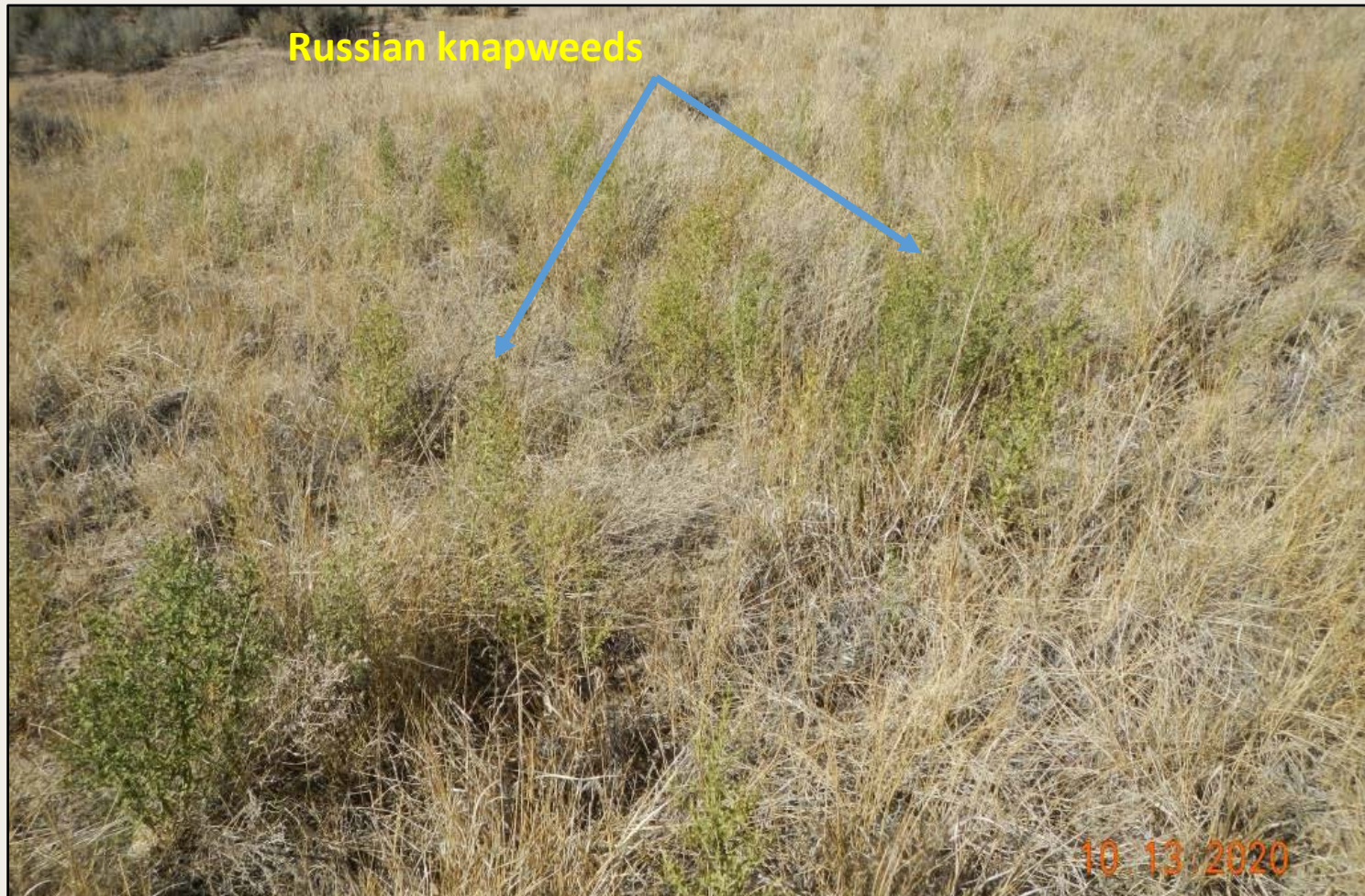
Photo 4. Closeup view of Russian knapweeds within the western project area. Approximately 500 individuals observed.