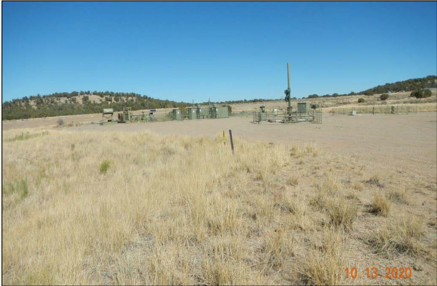
Photo 1. View of the project area from the southwestern corner facing center.