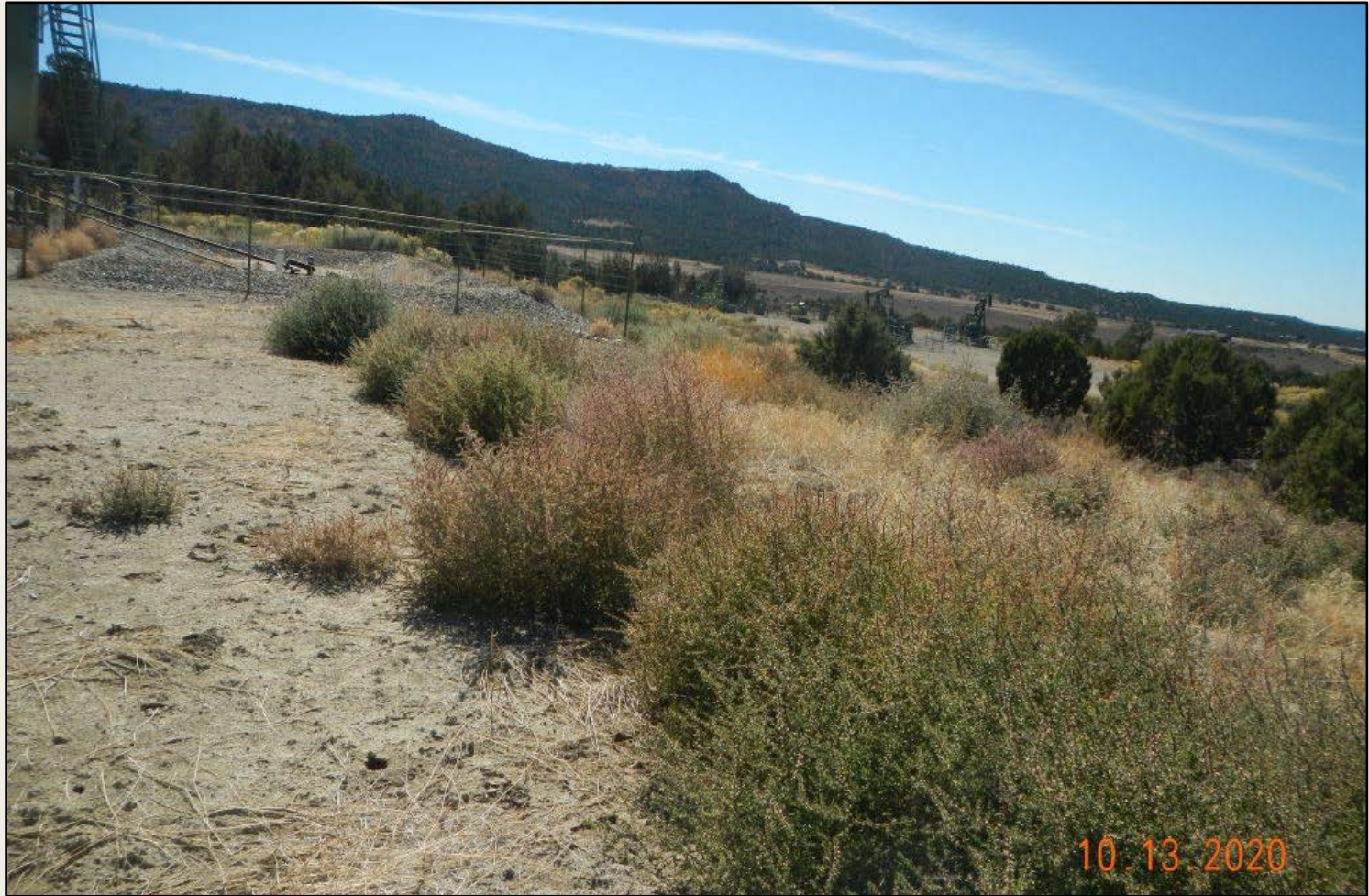
Photo 3. View of Russian thistles approx. 2-3 feet tall within the northwestern project area. Russian thistles will break off and become debris.