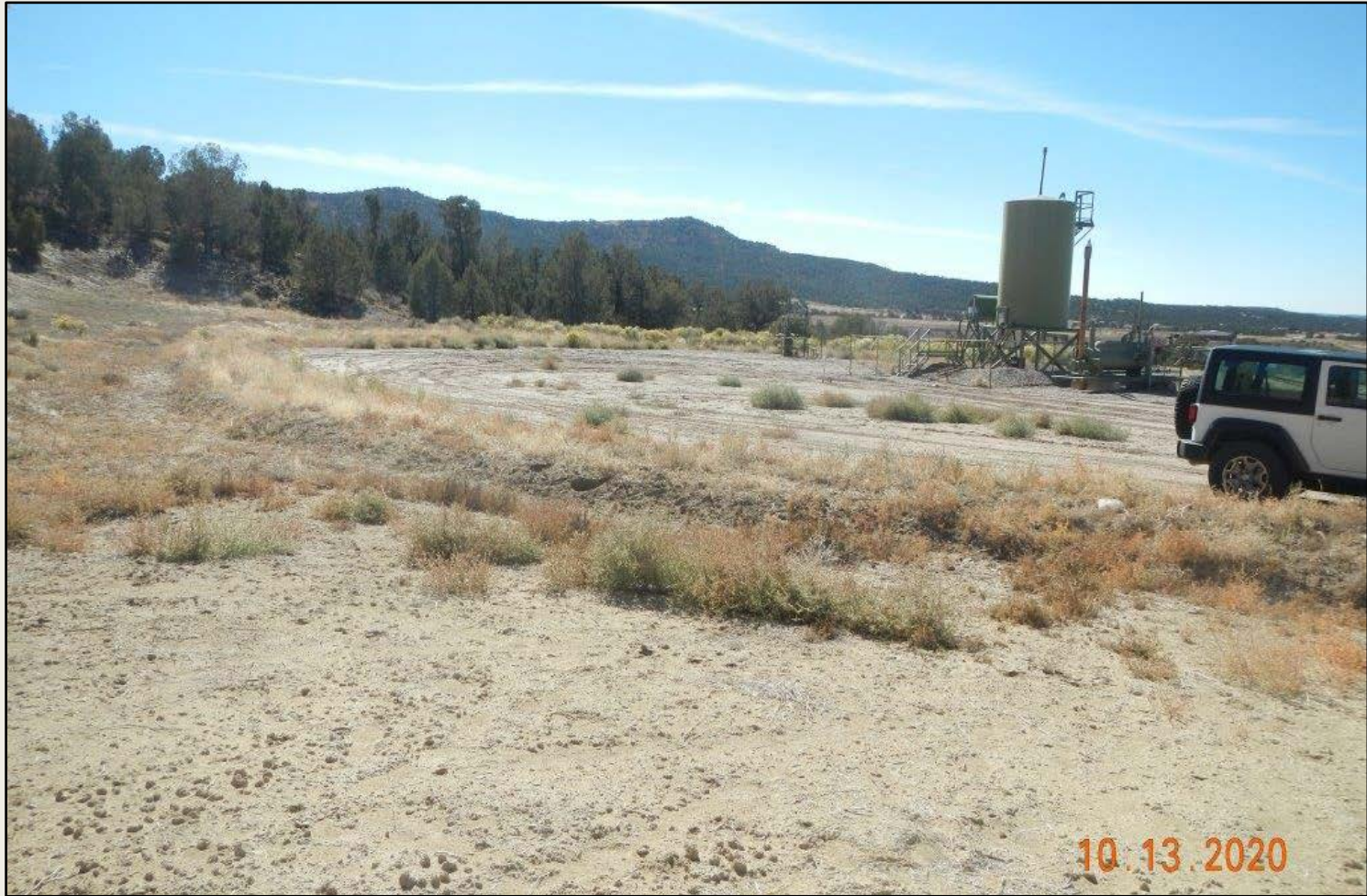
Photo 1. View of the project area from the northeastern corner facing center.