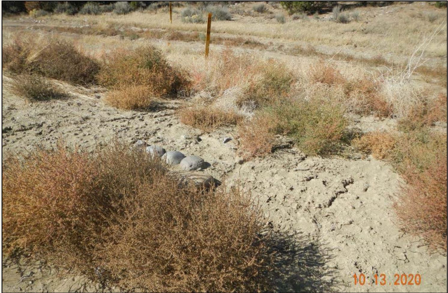
Photo 5. closeup view of erosion and weeds within the northwestern project area.