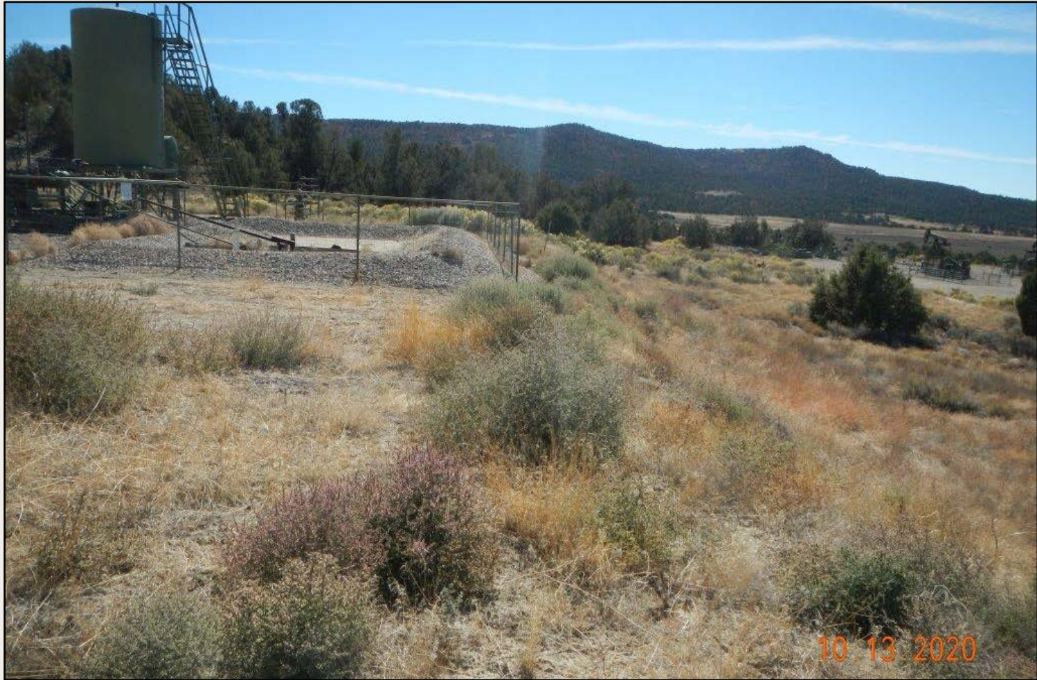
Photo 2. View of the western fill slope from the northwestern corner facing southward. Revegetation is progressing with smooth brome, western wheatgrass, and rubber rabbitbrush. Weeds such as Russian thistle and cheatgrass present. Russian thistle debris needs to be removed.