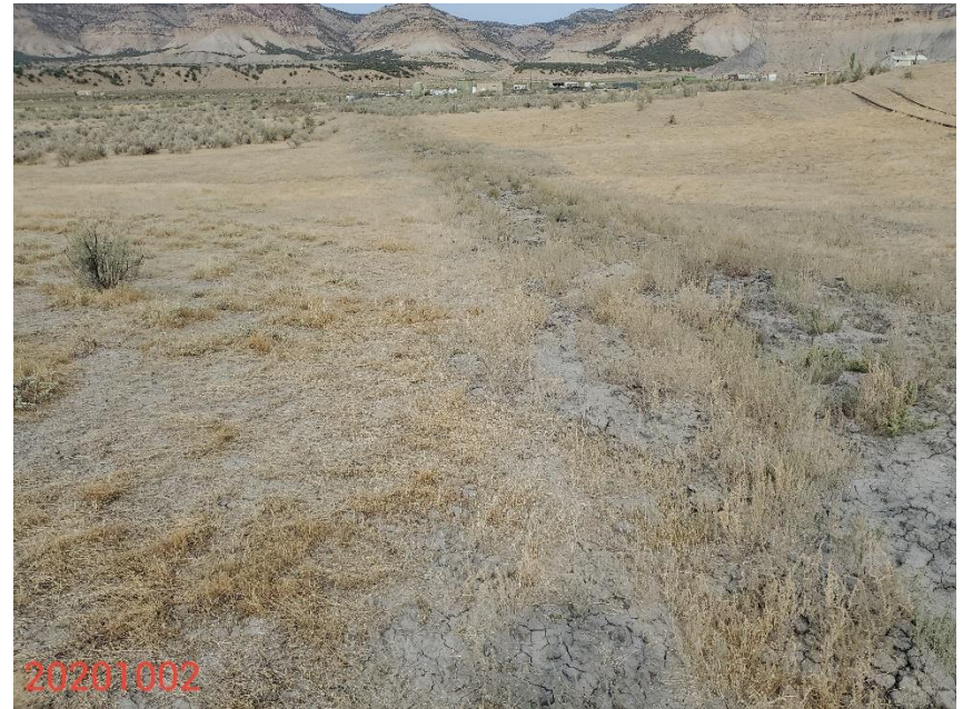
Photo 4: Photo taken from the access road. Photo shows reclamation appears to have been conducted pursuant to 1004 requirements.