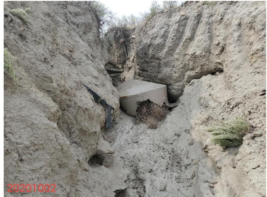
Photo 6: Continued from photo 5, Photo shows what appears to be a Fiberglass tank that's been deposited within the drainage.