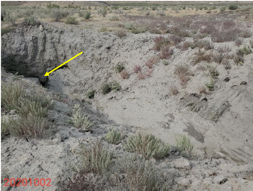
Photo 5: Photo shows area where access road intersects a drainage. Photo shows drainage has been restored to its original relative contour. Photo also show location of tank observed in drainage.