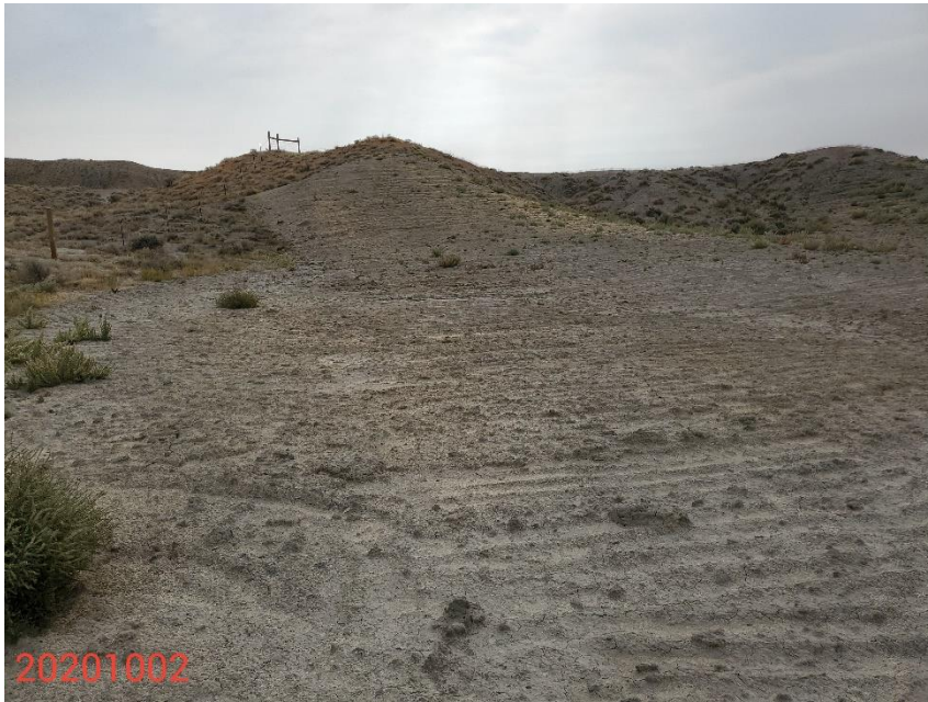
Photo 1: Photo taken from the north end of the Location, facing southeast. Photo provides an overview of the Location and reclamation in process.