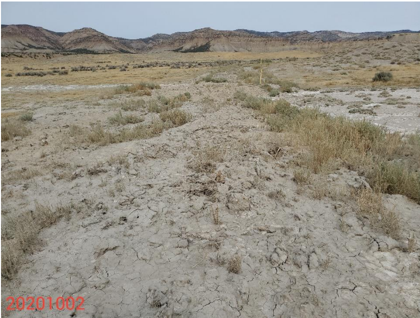
Photo 3: Photo taken from the access road. Photo shows reclamation appears to have been conducted pursuant to 1004 requirements.