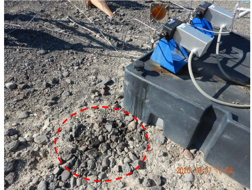
Photo #6 – Localized accumulation of oily waste (stained gravel) located southeast of day tank.