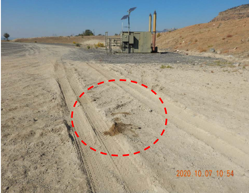
Photo #3 – Localized accumulation of oil-stained soil located between separators and tank battery.