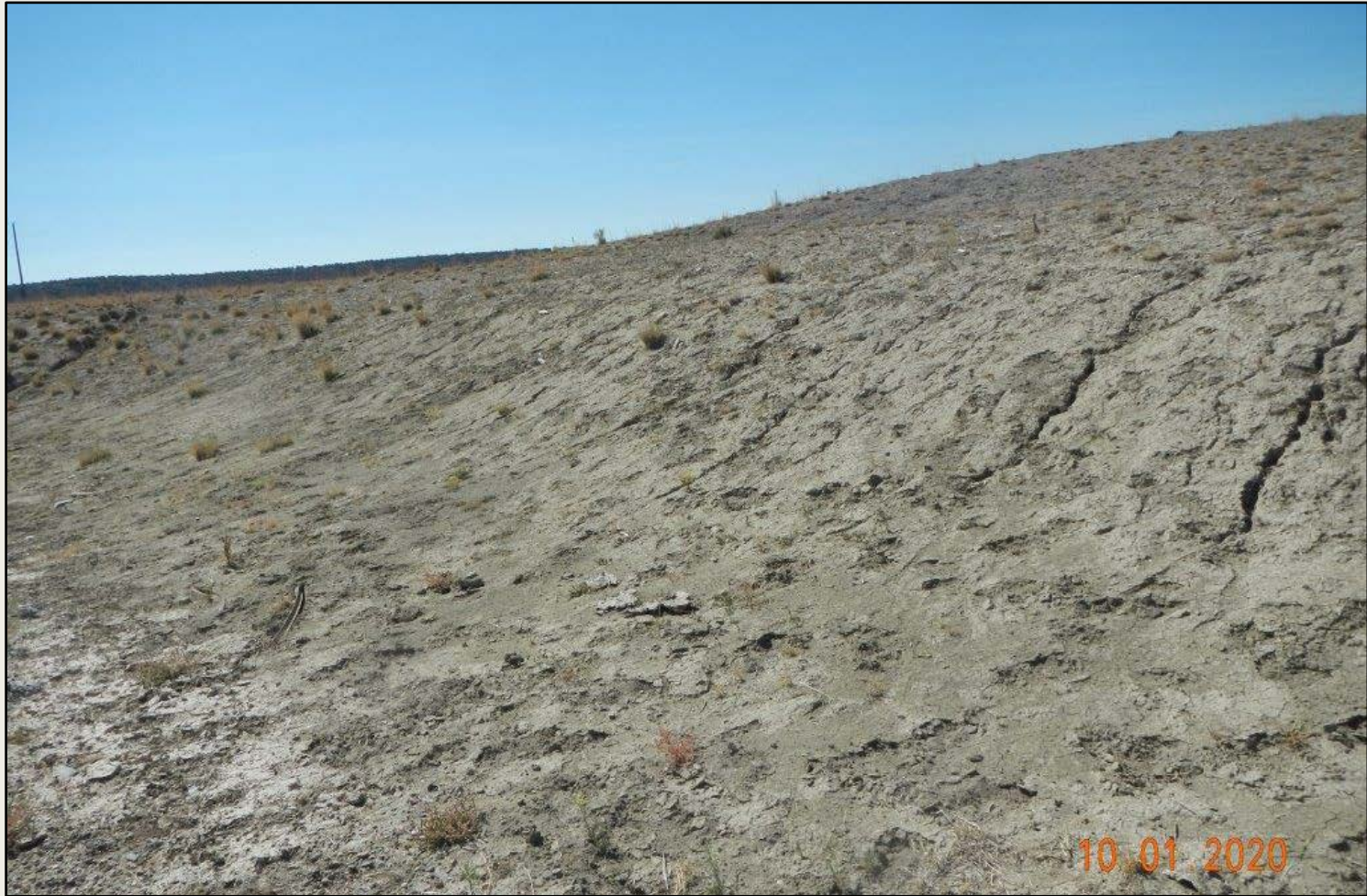
Photo 4. View of erosional rilling and bare soils on the well pad cut-slope. Additional stabilization is needed.