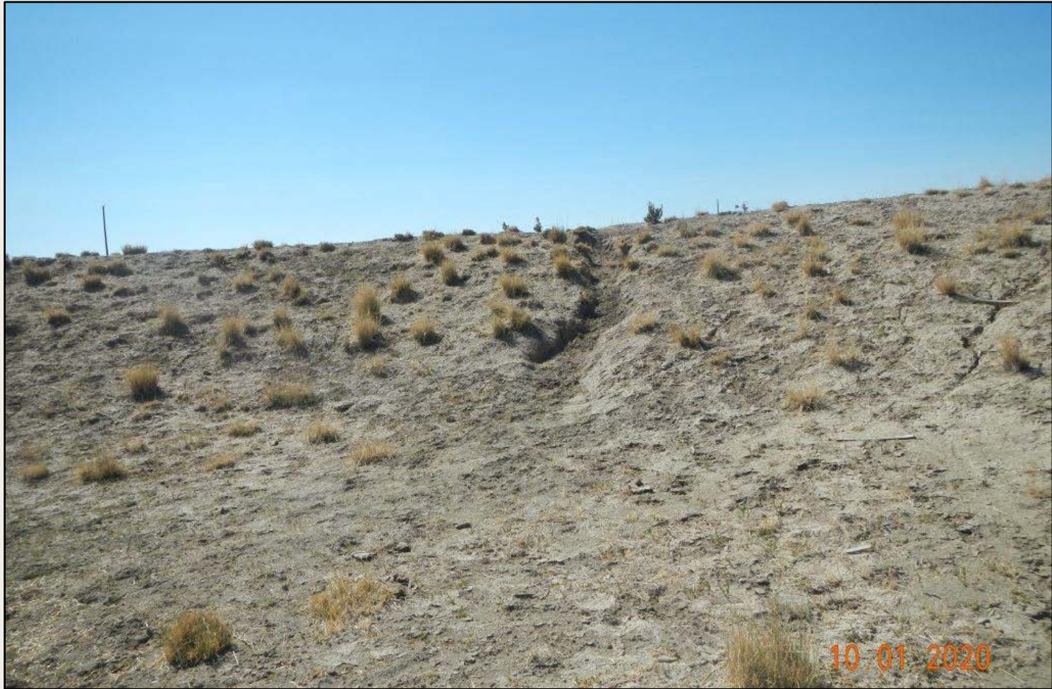
Photo 5. View of erosional channel, approximately 2.5 feet wide and 2 feet deep, within the southwestern cut-slope.