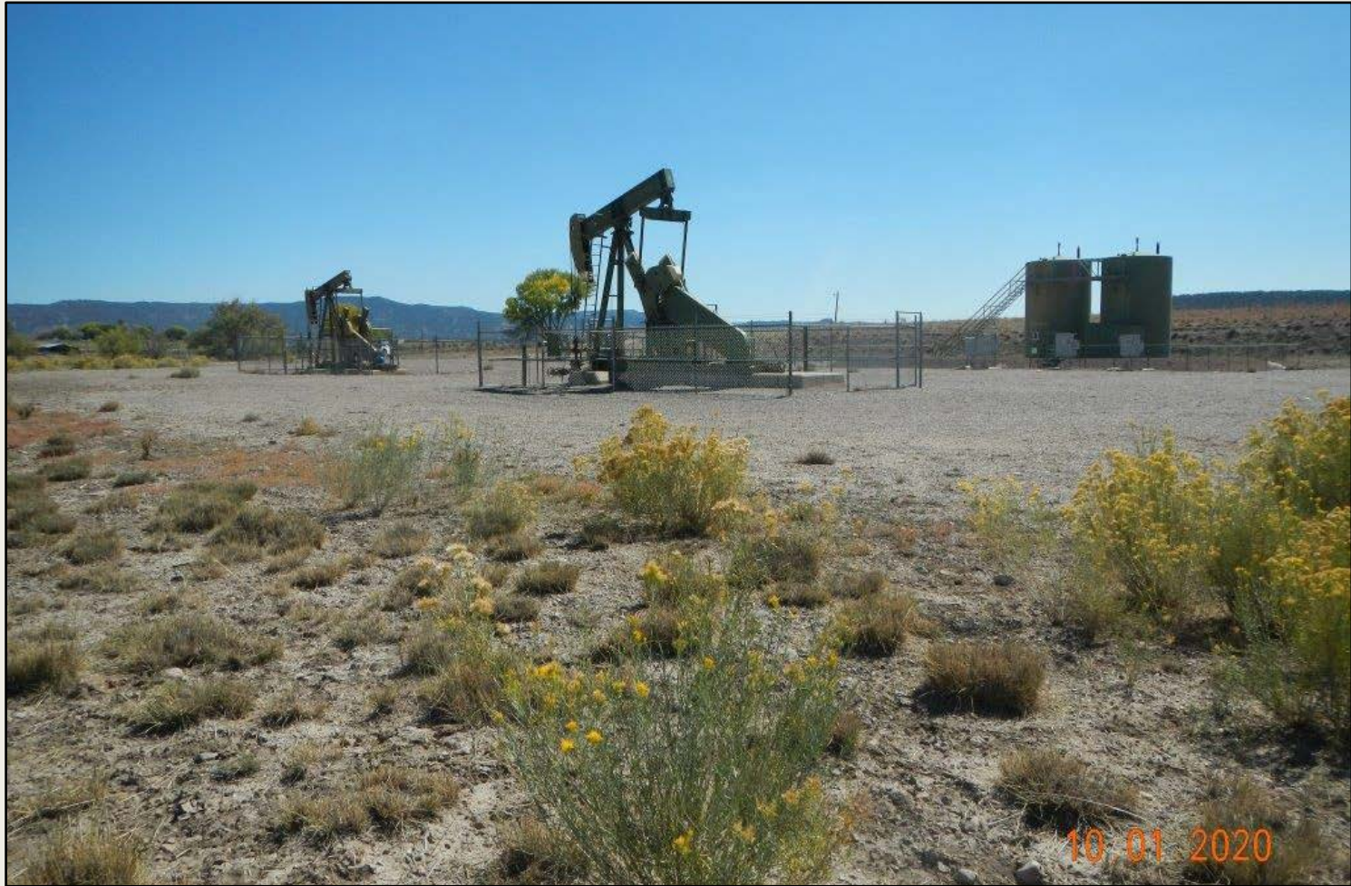
Photo 1. View of the project area from the northwestern corner facing center.