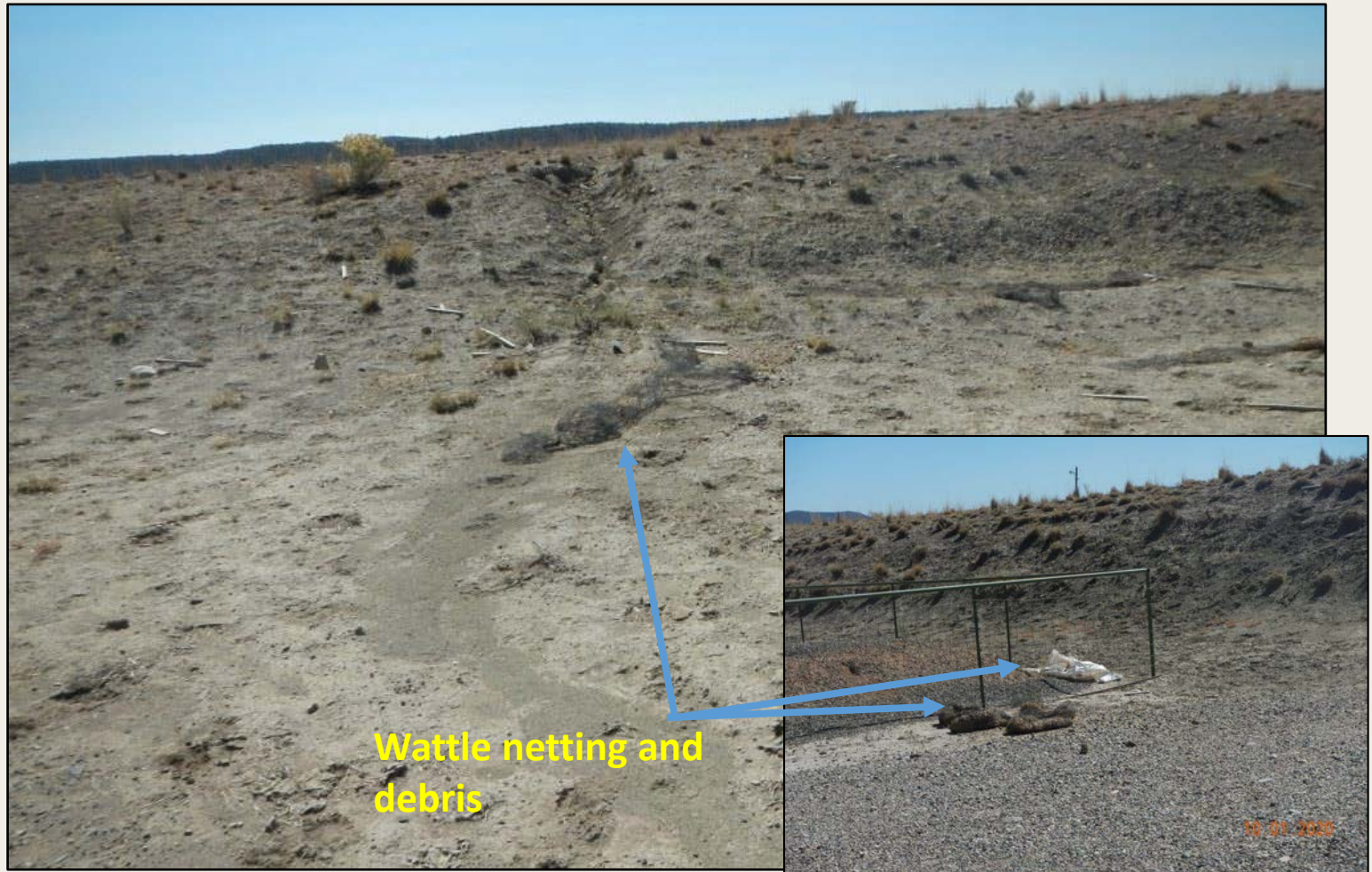
Photo 6. View of erosional channeling in the southeastern cut-slope. Wattle netting and debris present.