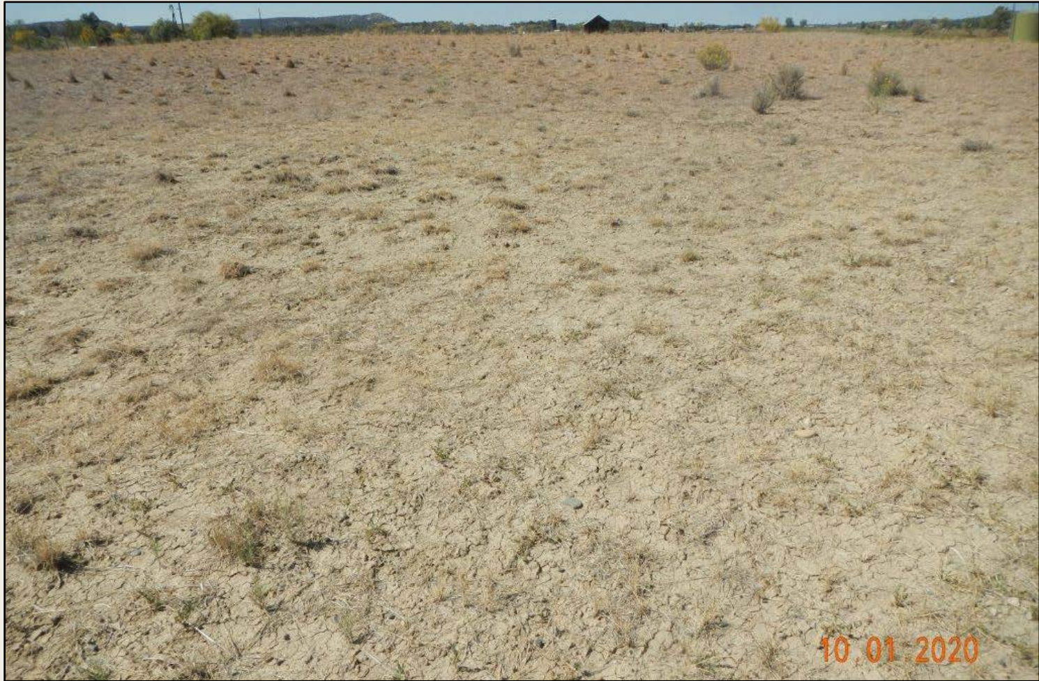
Photo 7. View of reference area comprised of grass field, largely with grazed grasses in a dormant vegetative condition.