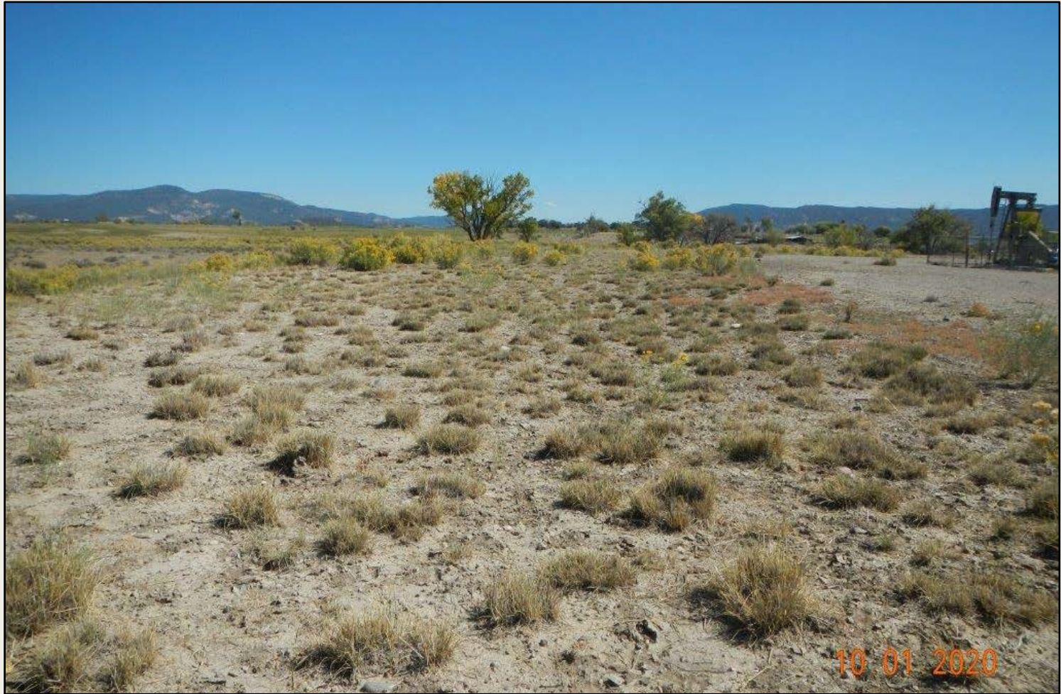
Photo 2. View of the northern project area from the northwestern corner facing eastward. Vegetation appears to be progressing here largely with grasses such as crested wheatgrass, in a grazed condition.