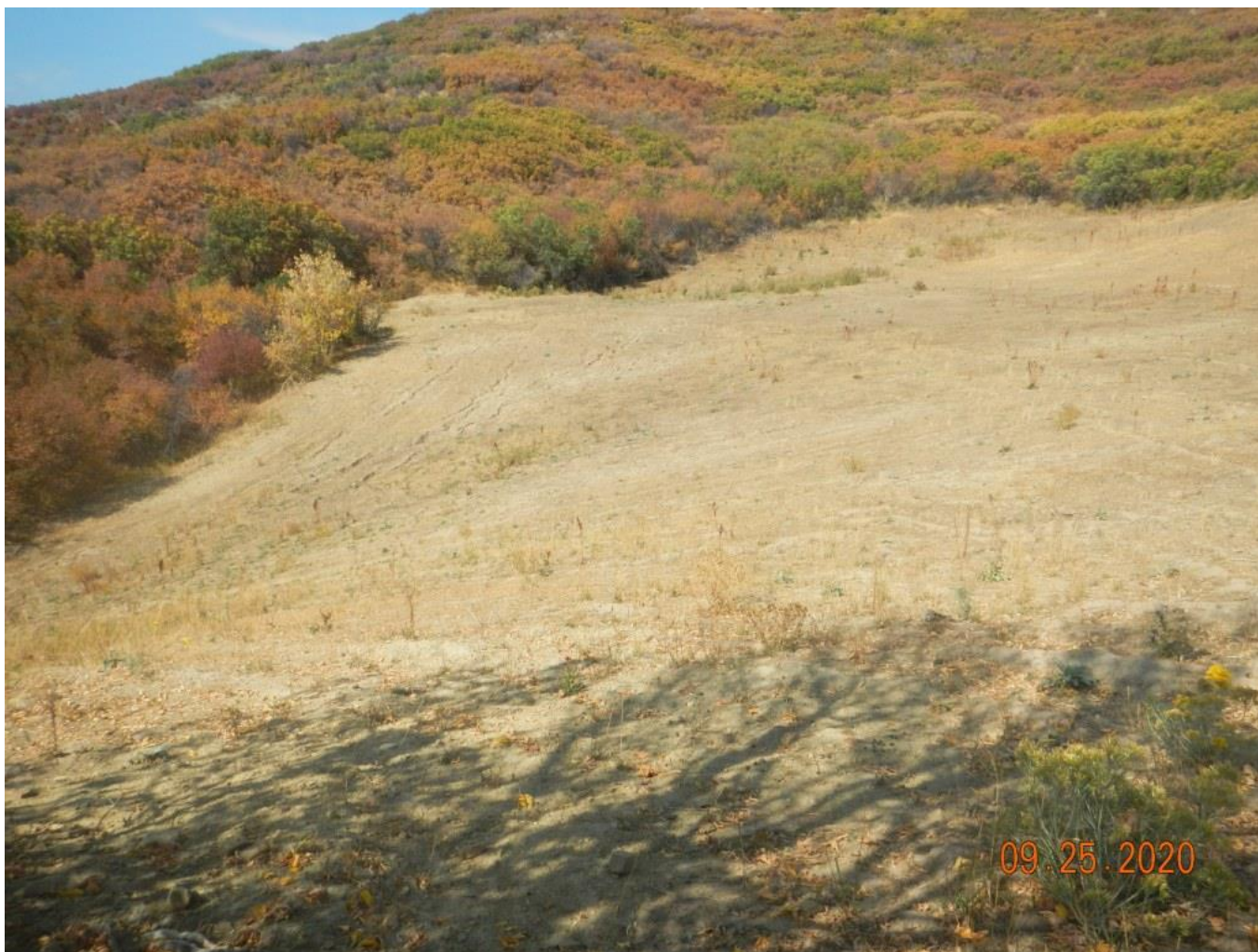
Photo#4: Northwest end of Location where erosion issues are evident.