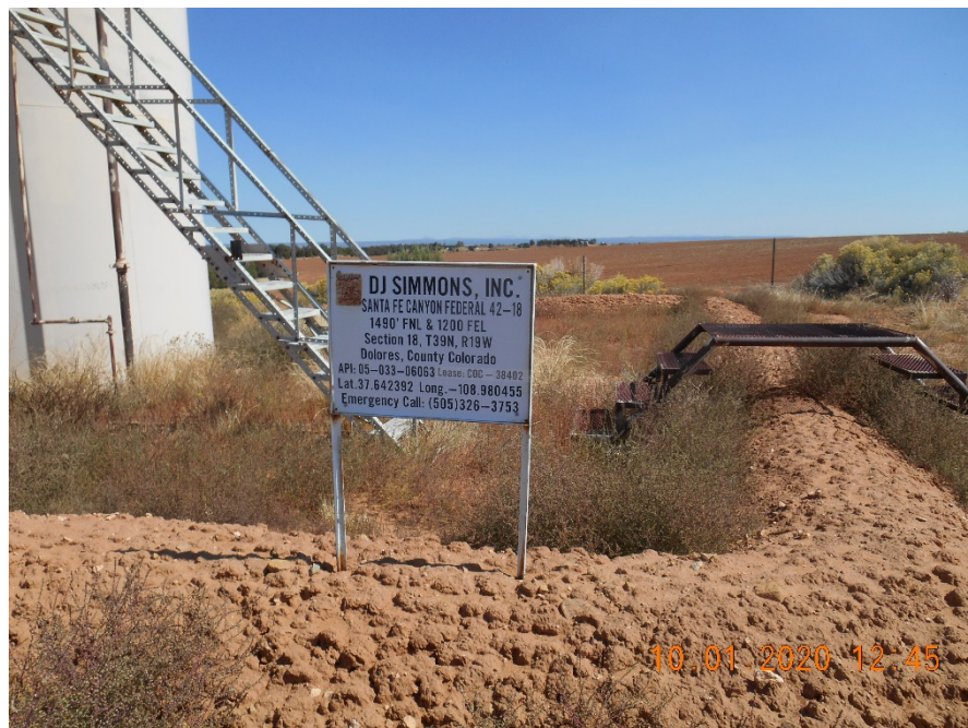
Sign at SW corner of tank battery. Wrong operator information on sign. Needs update emergency contact information and 911