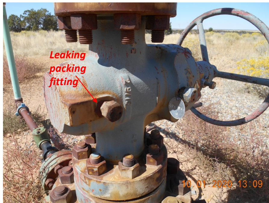
Close up of Broken elbow on flowline.