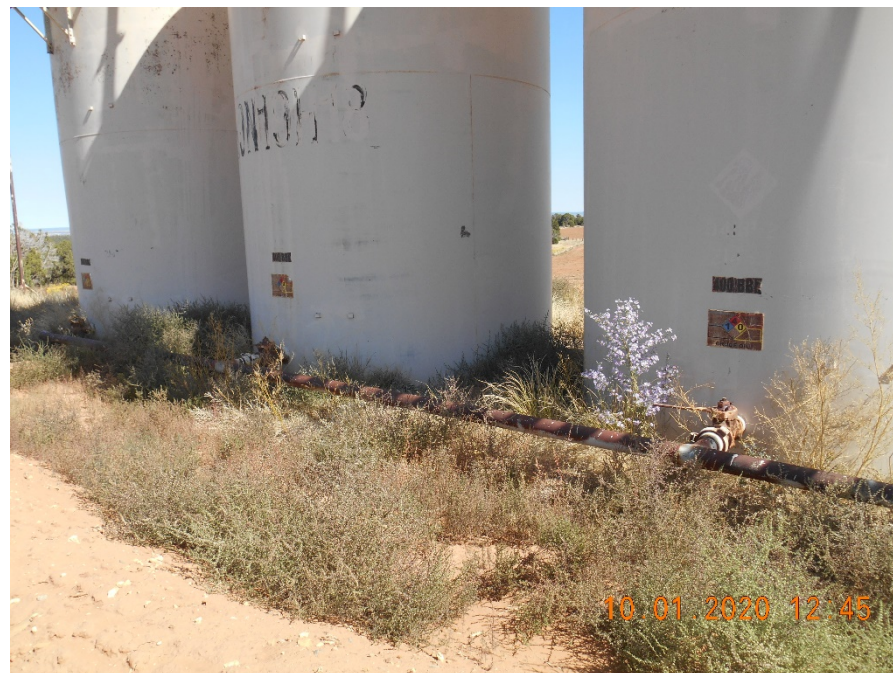
Tank Battery with improper tank labels.