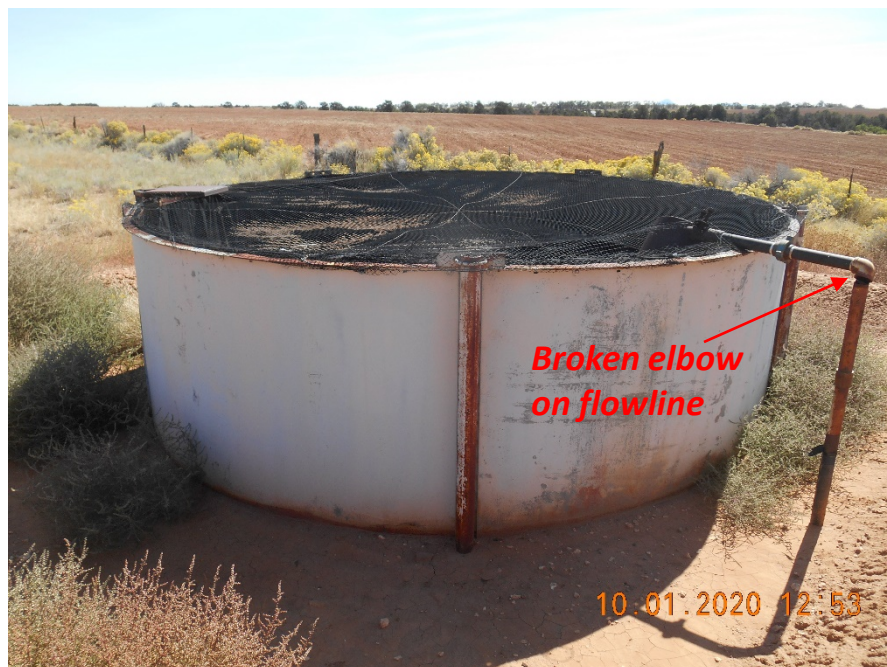
100 bbl produced water tank ½+ full of oil/water. No berms. Broken elbow on flowline.