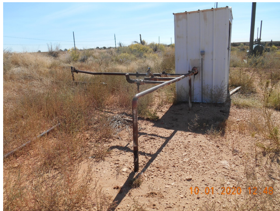
Meter housing and off location flowlines