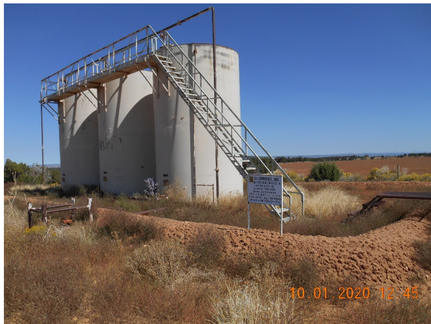
Tank Battery with earth berms. Weeds inside berms.