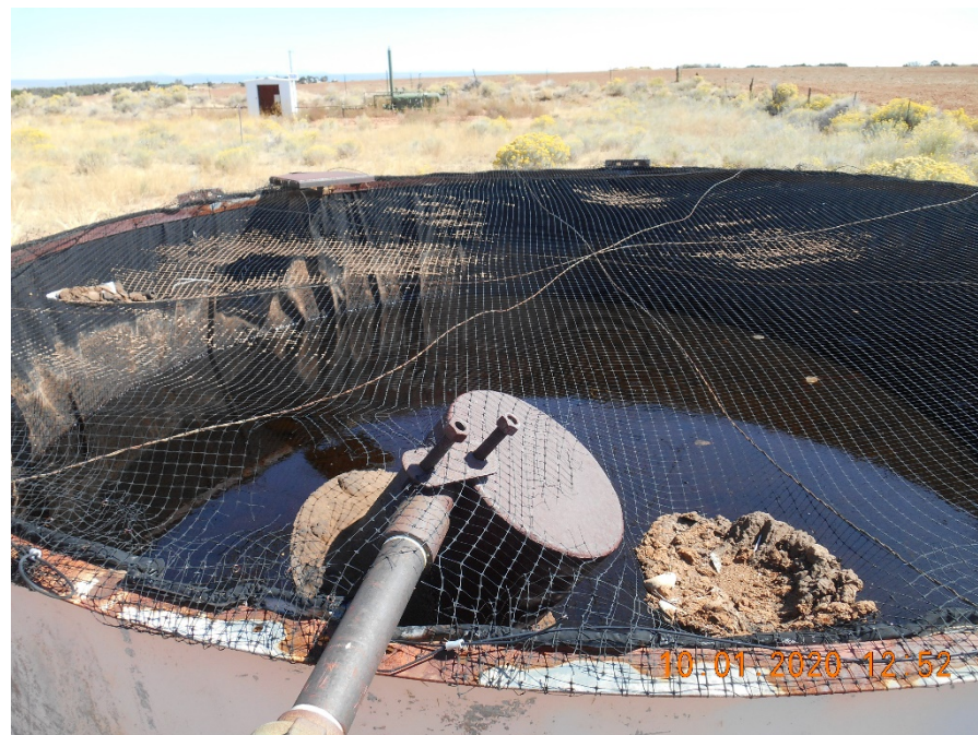
Oil/water level in produced water tank with less than 2 feet freeboard.