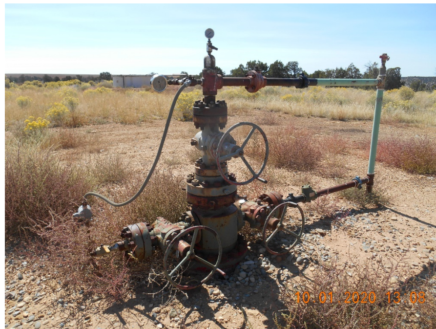
Shut in wellhead. Audible gas leak at tubing valve packing fitting. Bradenhead valve not plumbed to surface.