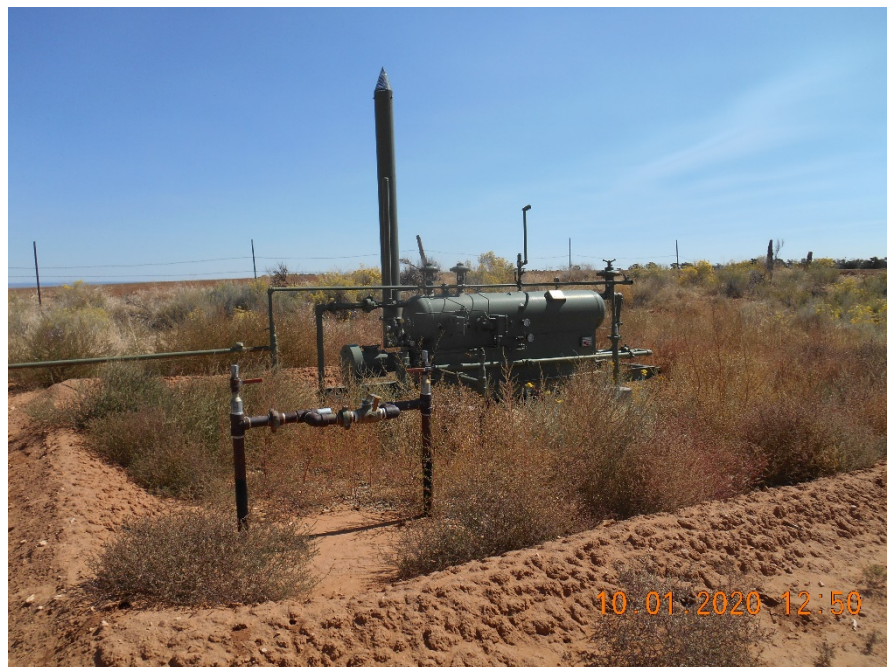
Separator with earth berms. Weeds inside berms.