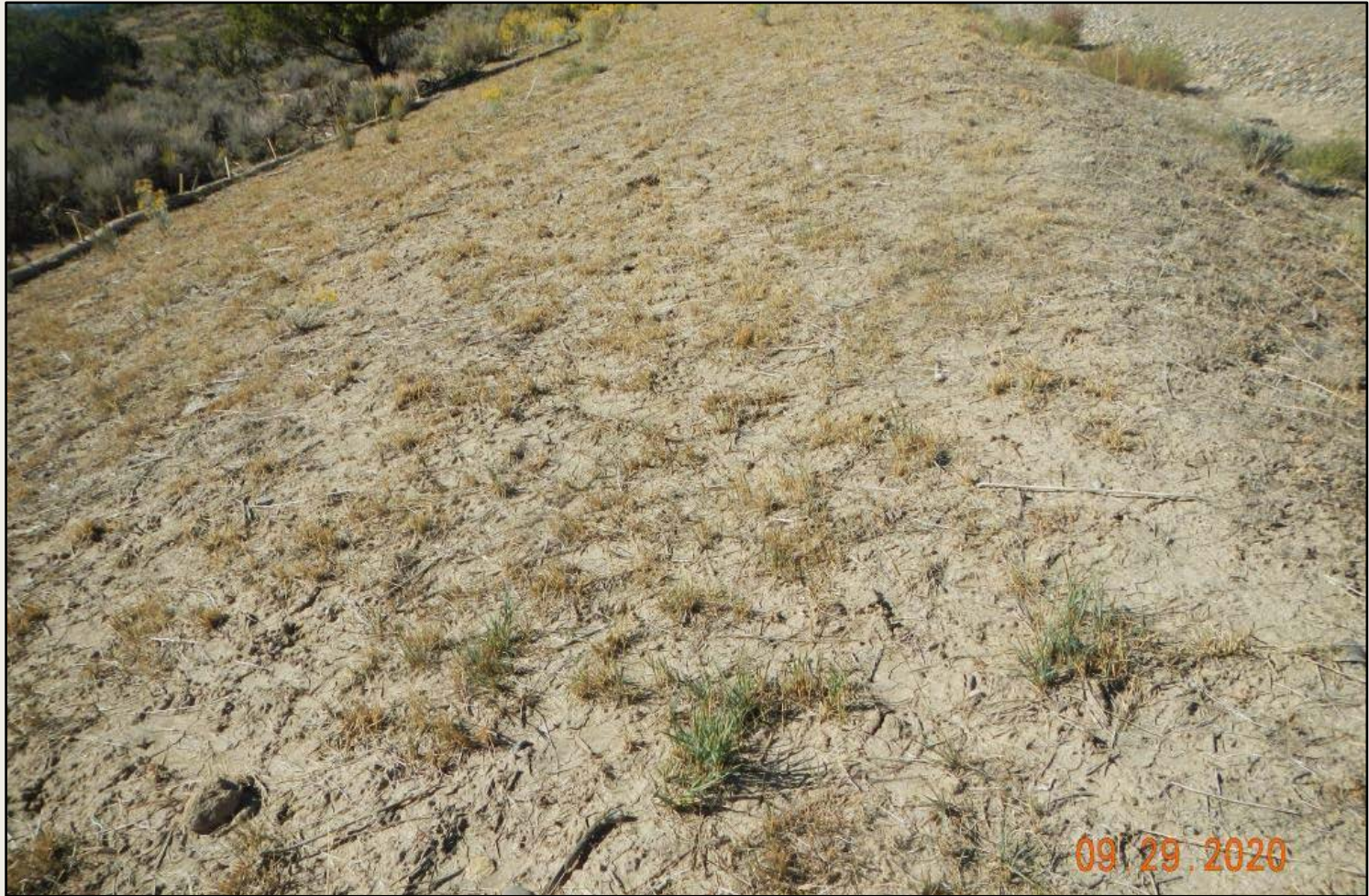
Photo 3. View from the eastern project area from the southeastern corner facing northward.