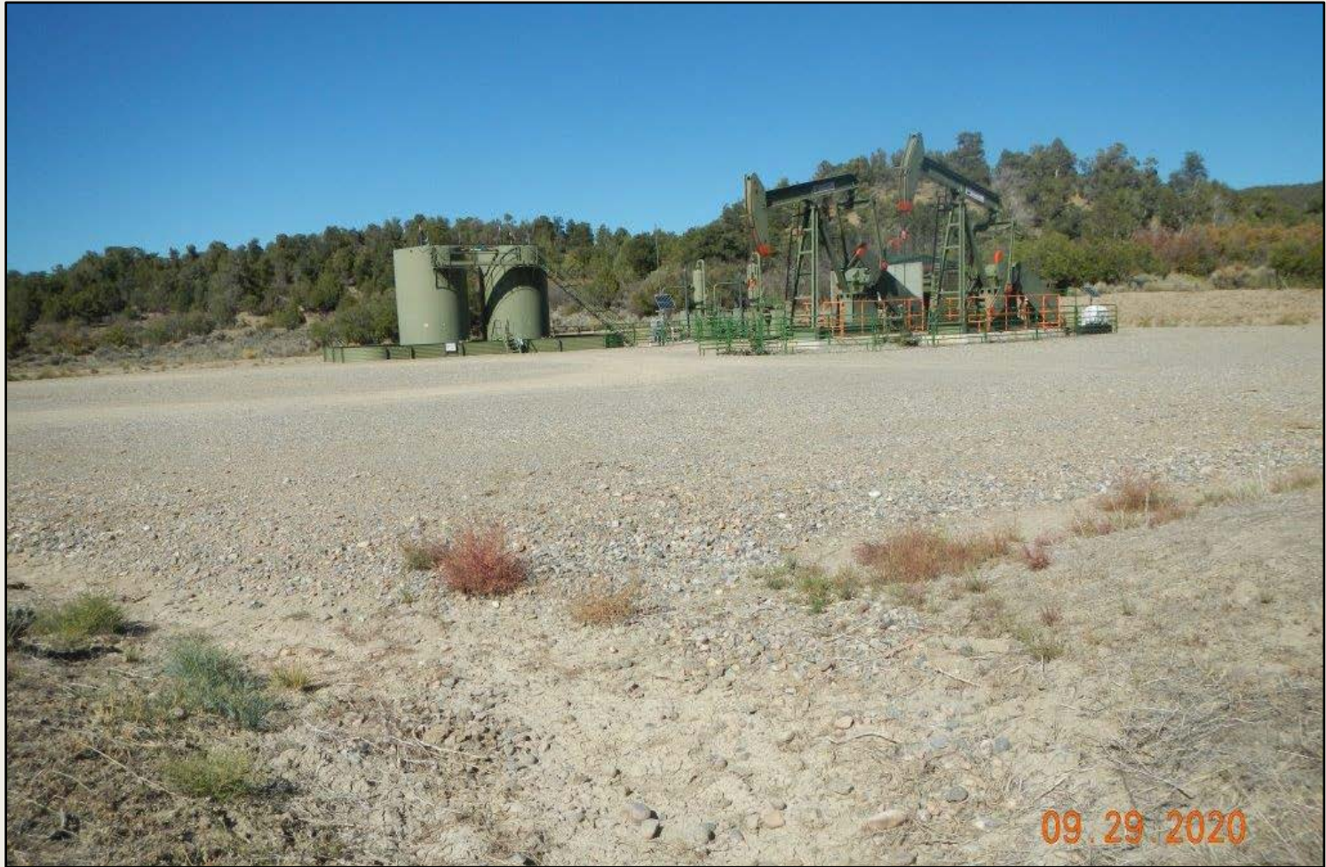
Photo 1. View of the project area from the southeastern corner facing center.