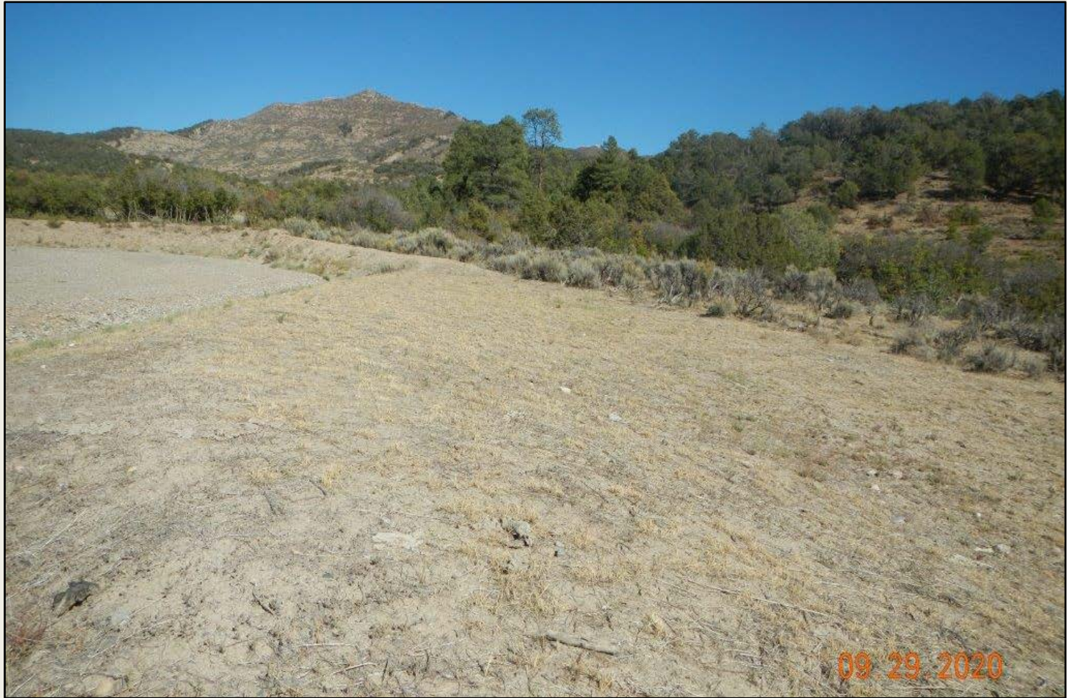
Photo 2. View of the southern project area from the southeastern corner facing eastward. Revegetation is progressing in a grazed vegetative condition. Grasses are not identifiable at this time.