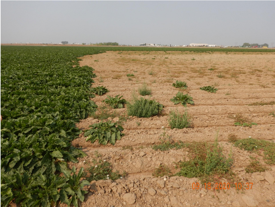
Photo 17. Photo taken from the southeastern P&A area, facing West. Photo illustrates the lack of crop growth within the P&A area.