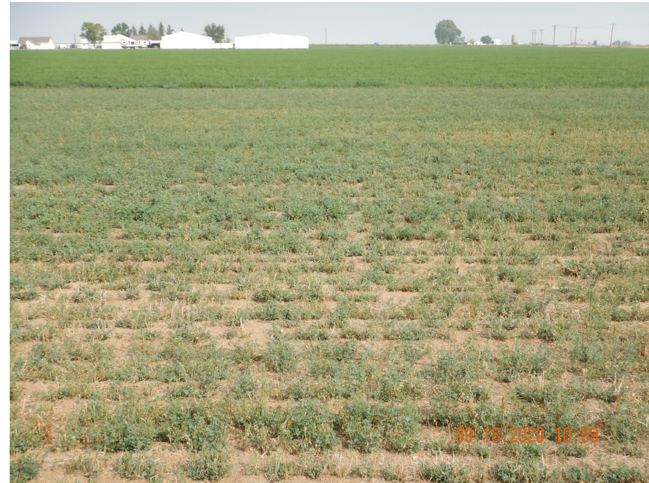
Photo 15. Photo taken from the northern interim reclamation area, facing North. See comments under Photo 14.