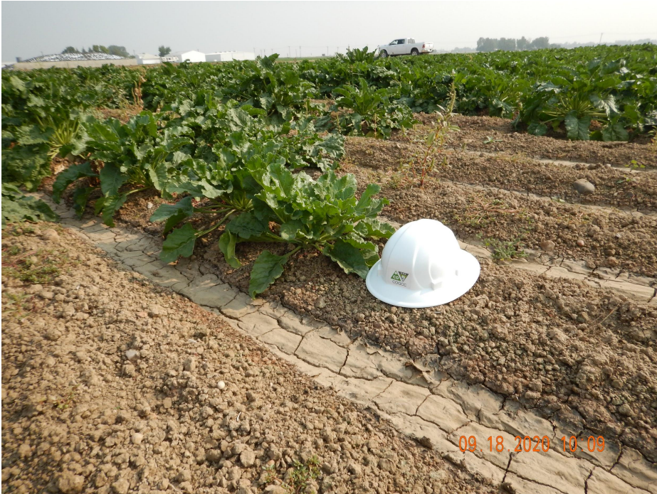
Photo 7. Photo taken from the southern plugged and abandoned location, facing East. Photo illustrates a stunted sugar beet not reflective of reference areas.