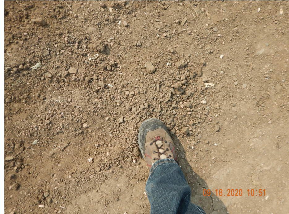
Photo 21. Photo taken from the southern route (orange dashed line). Photo illustrates some gravel present which might indicate it was utilized to perform subsequent oil and gas operations.