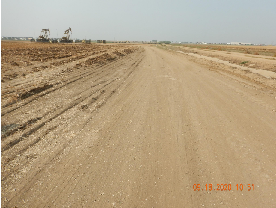
Photo 20. Photo taken from the southern route (orange dashed line), facing West.