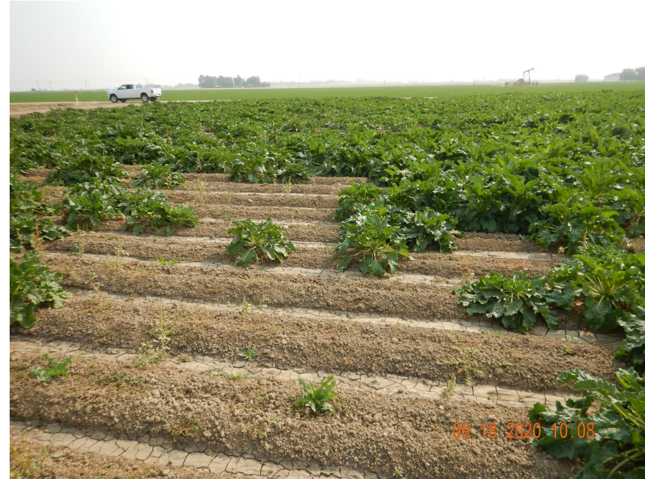
Photo 6. Photo taken from the southern plugged and abandoned location, facing East. See comments under Photo 5.