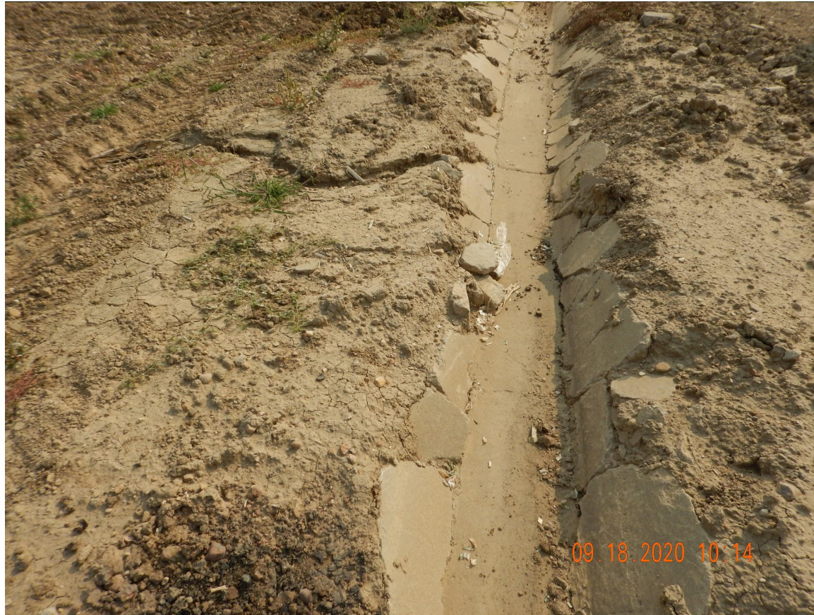
Photo 11. Photo taken from the P&A location. Photo illustrates a damaged irrigation ditch from plugging operations.