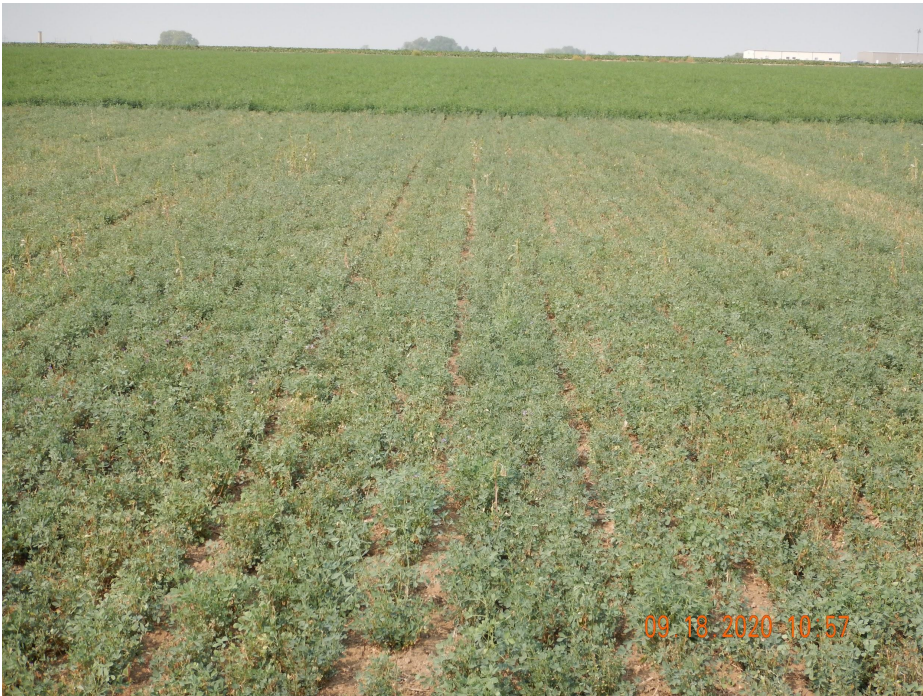
Photo 14. Photo taken from the western interim reclamation area, facing West. Photo illustrates crop growth within the interim area is not reflective of reference area crop growth.