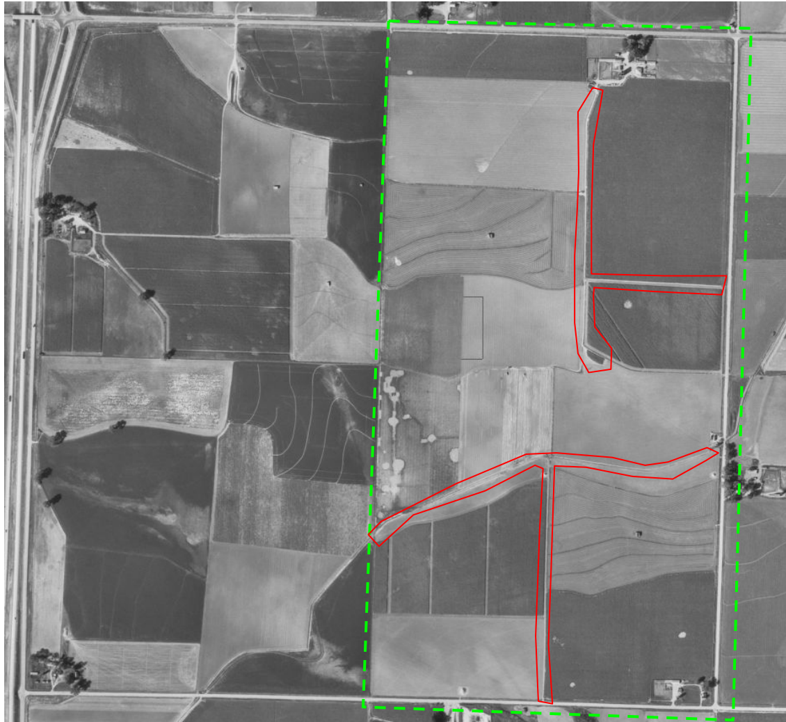
Photo 2. Aerial imagery taken September 20, 1967 illustrating an overview of the area (area within the green-dashed line) demonstrating its condition prior to oil and gas activity. The red polygon areas highlight areas of pre-existing roads prior to oil and gas. Refer to Photos 3 and 4 which are zoomed in areas of the above area.