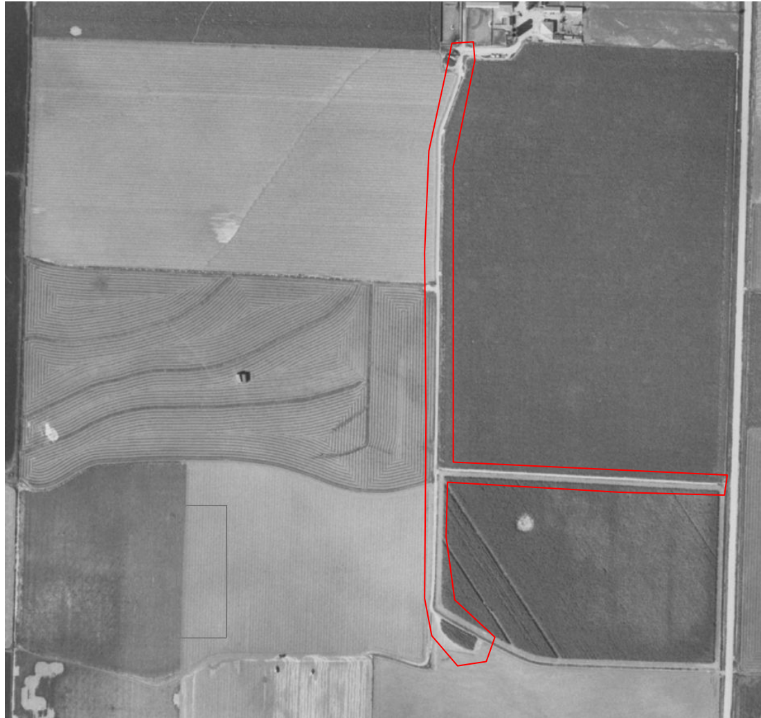
Photo 3. Zoomed in aerial imagery of the northern area taken September 20, 1967 illustrating an overview of the area demonstrating its condition prior to oil and gas activity. The red polygon areas highlight areas of pre-existing roads prior to oil and gas.