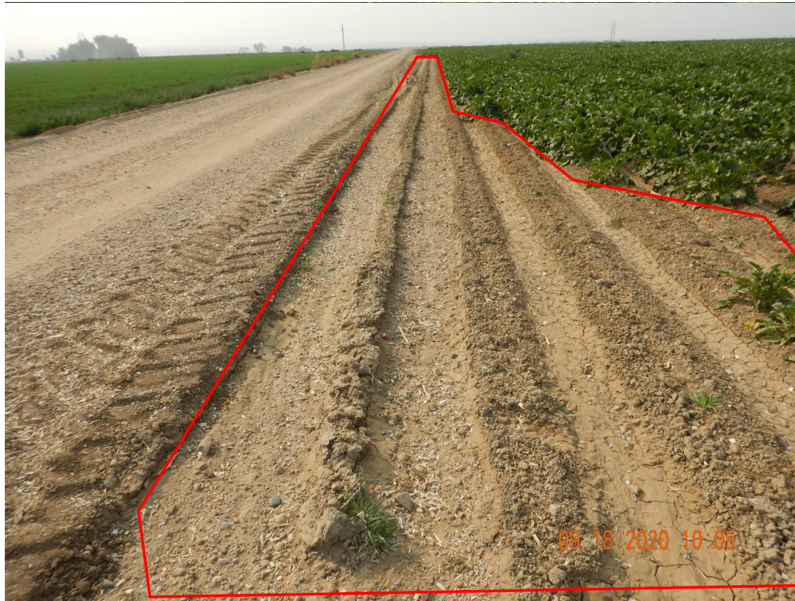
Photo 10. Photo taken from the eastern P&A location, facing South. Photo illustrates portions of the crop field have not been reclaimed (red polygon).