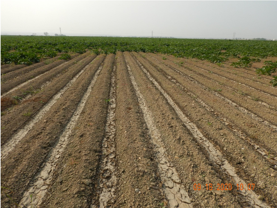
Photo 5. Photo taken from the southern plugged and abandoned (P&A) location, facing South. Photo illustrates the lack of crop growth (sugar beets). Sugar beets that are growing within the PA location are not reflective of reference area crop growth.