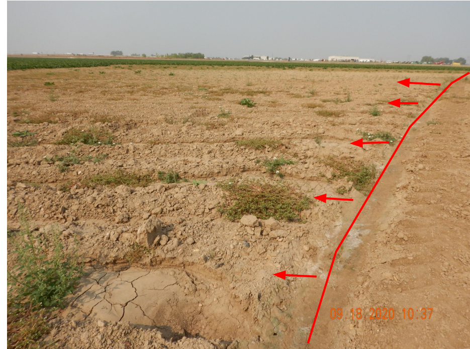
Photo 18. Photo taken from the eastern P&A area, facing West. See comments under Photo 17.