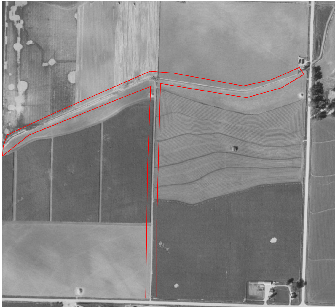
Photo 4. Zoomed in aerial imagery of the southern area taken September 20, 1967 illustrating an overview of the area demonstrating its condition prior to oil and gas activity. The red polygon areas highlight areas of pre-existing roads prior to oil and gas.