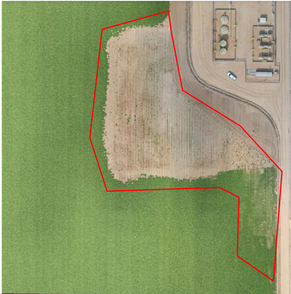
Photo 16. COGCC drone aerial imagery from 9/18/2020. Imagery illustrates the plugged and abandoned (P&A) location is not reflective of reference area crop growth. This P&A location includes wells and the original tank battery along the southeastern polygon.