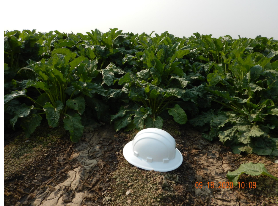
Photo 8. Photo taken from the adjacent reference area, facing South. Photo illustrates the crop deficiencies between the P&A crops versus the reference crops.