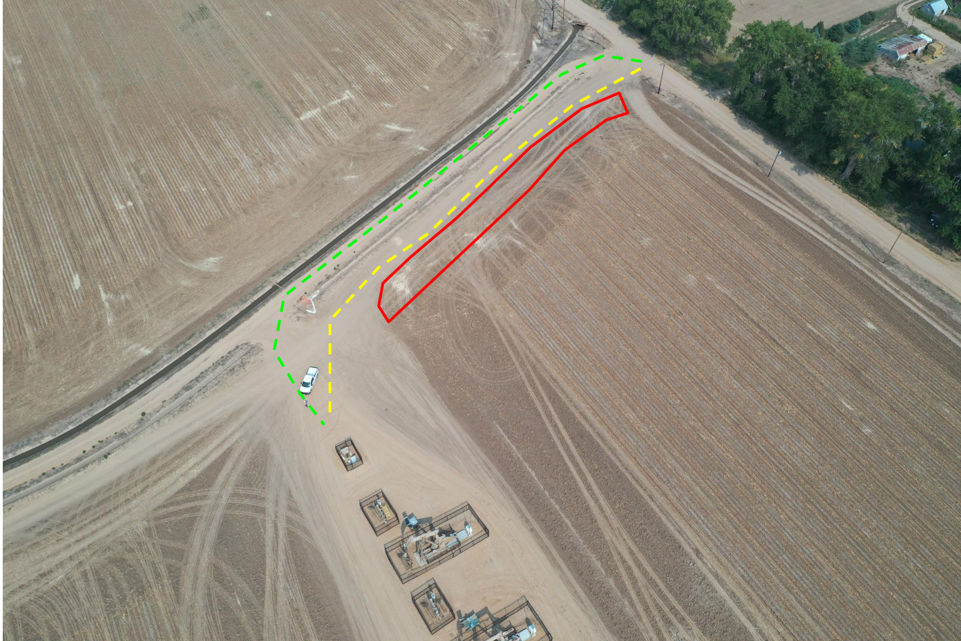
Photo 19. COGCC drone aerial imagery from 9/18/2020. Imagery illustrates an approximate crop area (red polygon) where the surface owner stated crop deficiencies due to subsequent oil and gas operations. Crop has already been harvested so COGCC staff could not document crop growth. Per a surface owner statement, Operator typically uses the northern access road (green dashed line) but the access was too narrow to perform subsequent operations and utilized a southern access route (yellow dashed line).