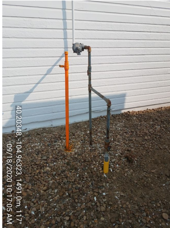
Photo 12. Photo taken from the nearby residence (refer to Photo 1). Photo illustrates an out of service riser related to a domestic tap which has not been abandoned per Rule 1105.