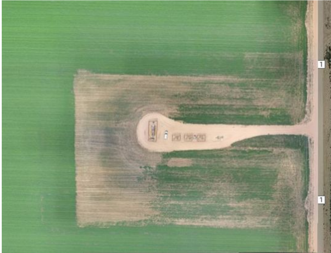
Photo 13. COGCC drone aerial imagery from 9/18/2020. Imagery illustrates interim reclamation areas are not reflective of reference area crop growth.