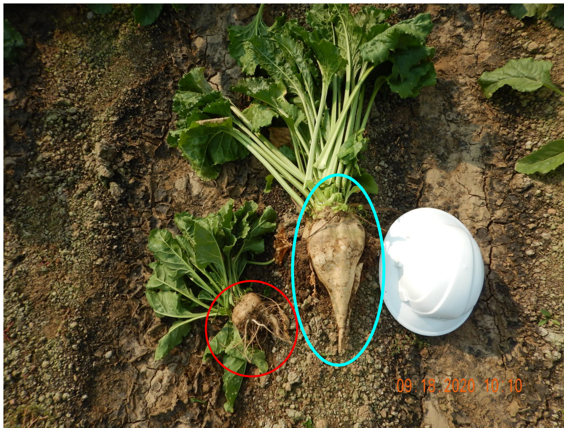
Photo 9. Photo taken of a sugar beet from the P&A area (red circle) and from the reference area (blue circle).