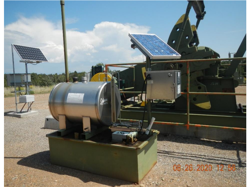
Chemical injection system on secondary containment.