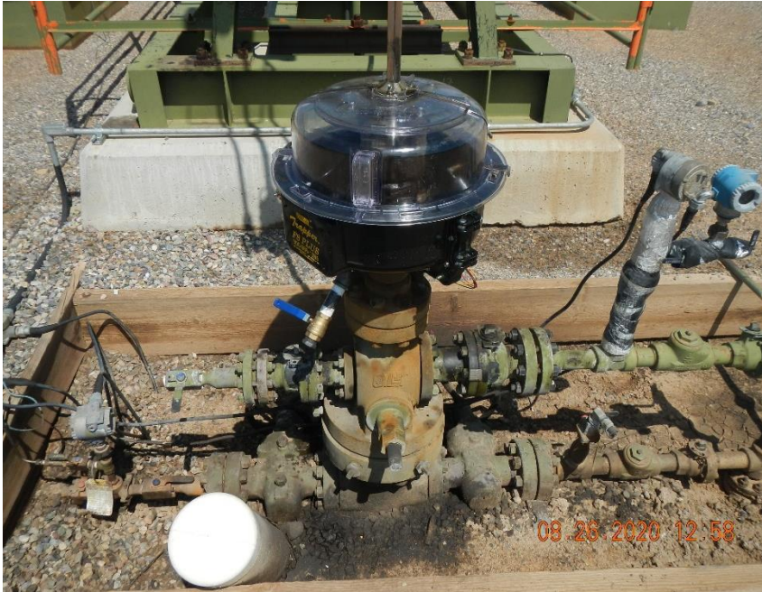
Trapper containment device on well head.