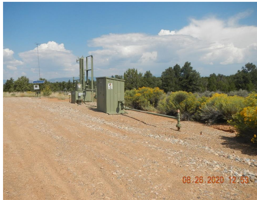
FC Armstrong 001 #1 production equipment.