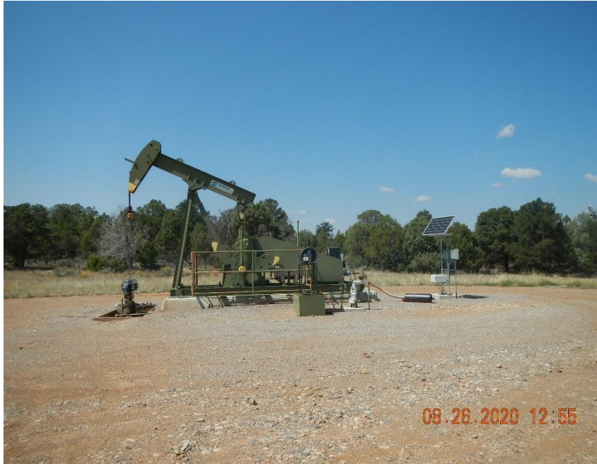
FC Armstrong 001 #1 pump jack and well head.