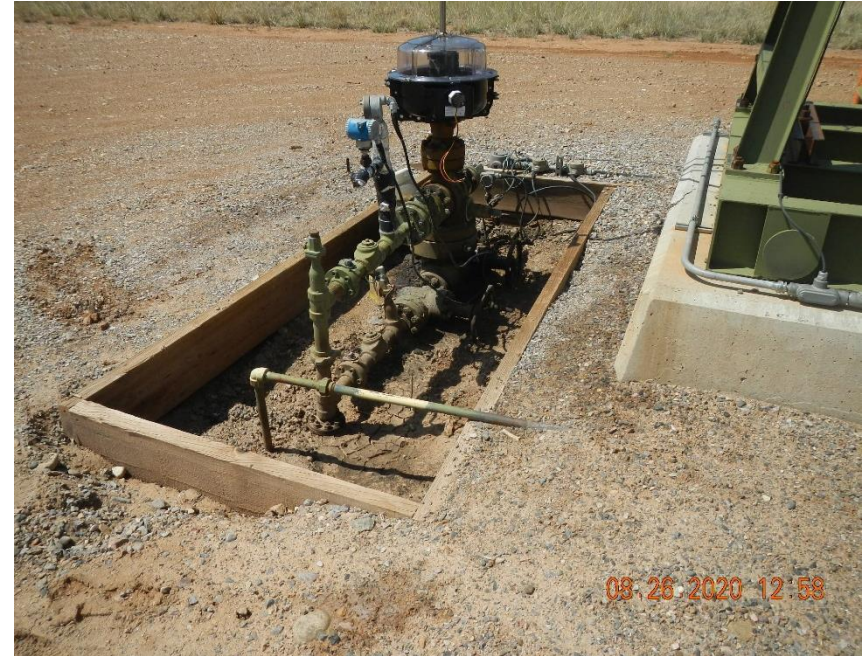
Stained soil surrounding well head.