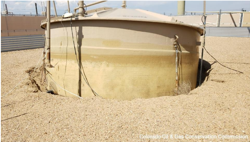
Photo 21 sinkhole formed under PW tank