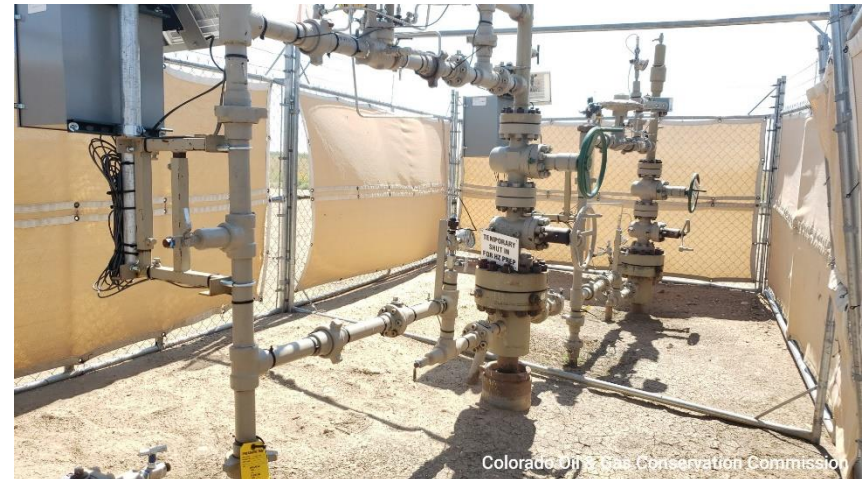
Photo 3 WH sign