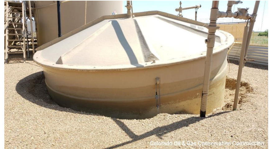
Photo 22 sinkhole formed under PW tank