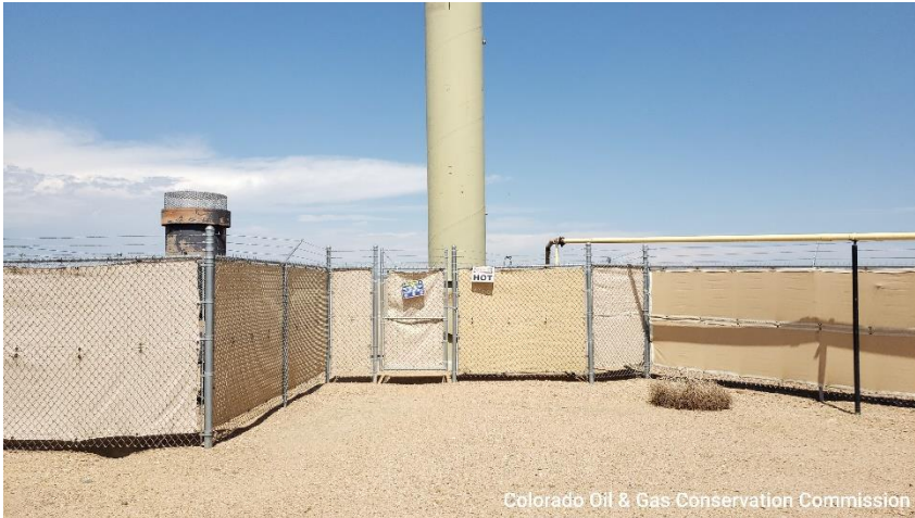
Photo 19 ECDs