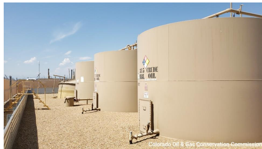
Photo 13 TB signs