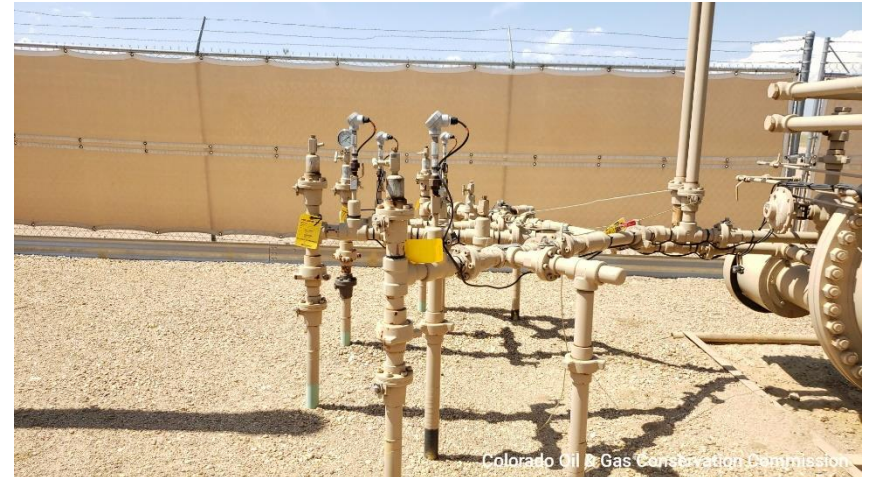
Photo 20 Flow lines