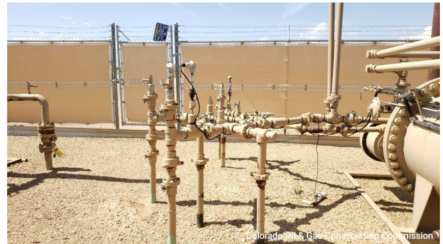
Photo 17 Horizontal Heated Separators