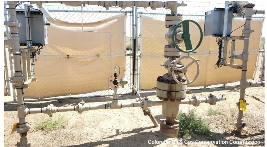
Photo 5 WH sign