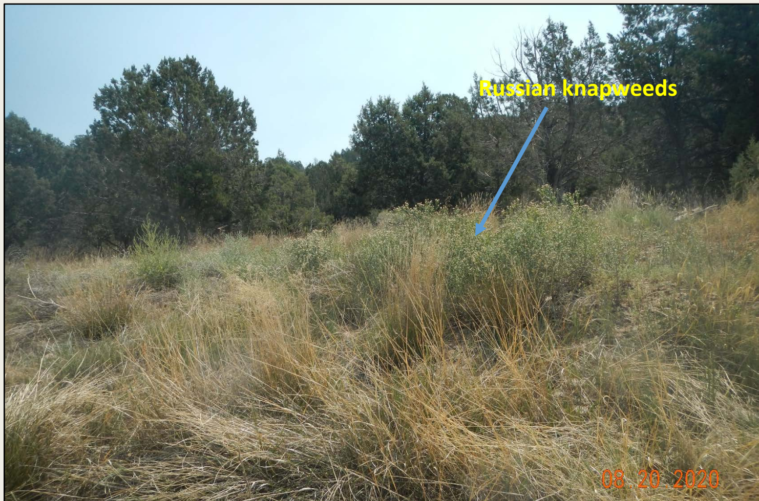
Photo 5. View of Russian knapweeds growing within the southeastern project area.