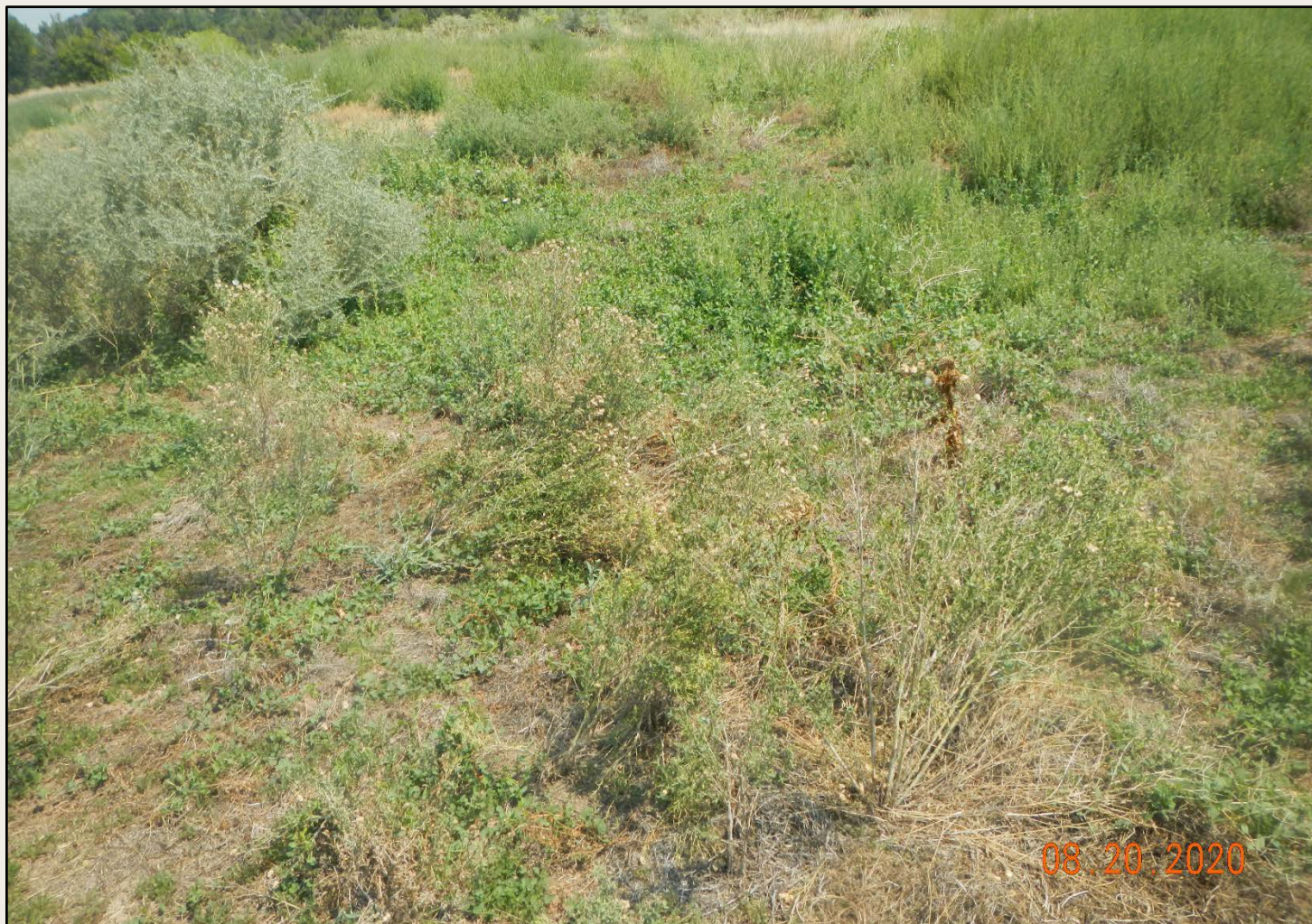
Photo 3. View of the western project area from the southwestern corner facing northward. Revegetation is comprised of a mix of shrubs such as fourwing saltbush, rubber rabbitbrush and grasses such as western wheatgrass, as well as weeds such as field bindweed, kochia, and Russian knapweed.