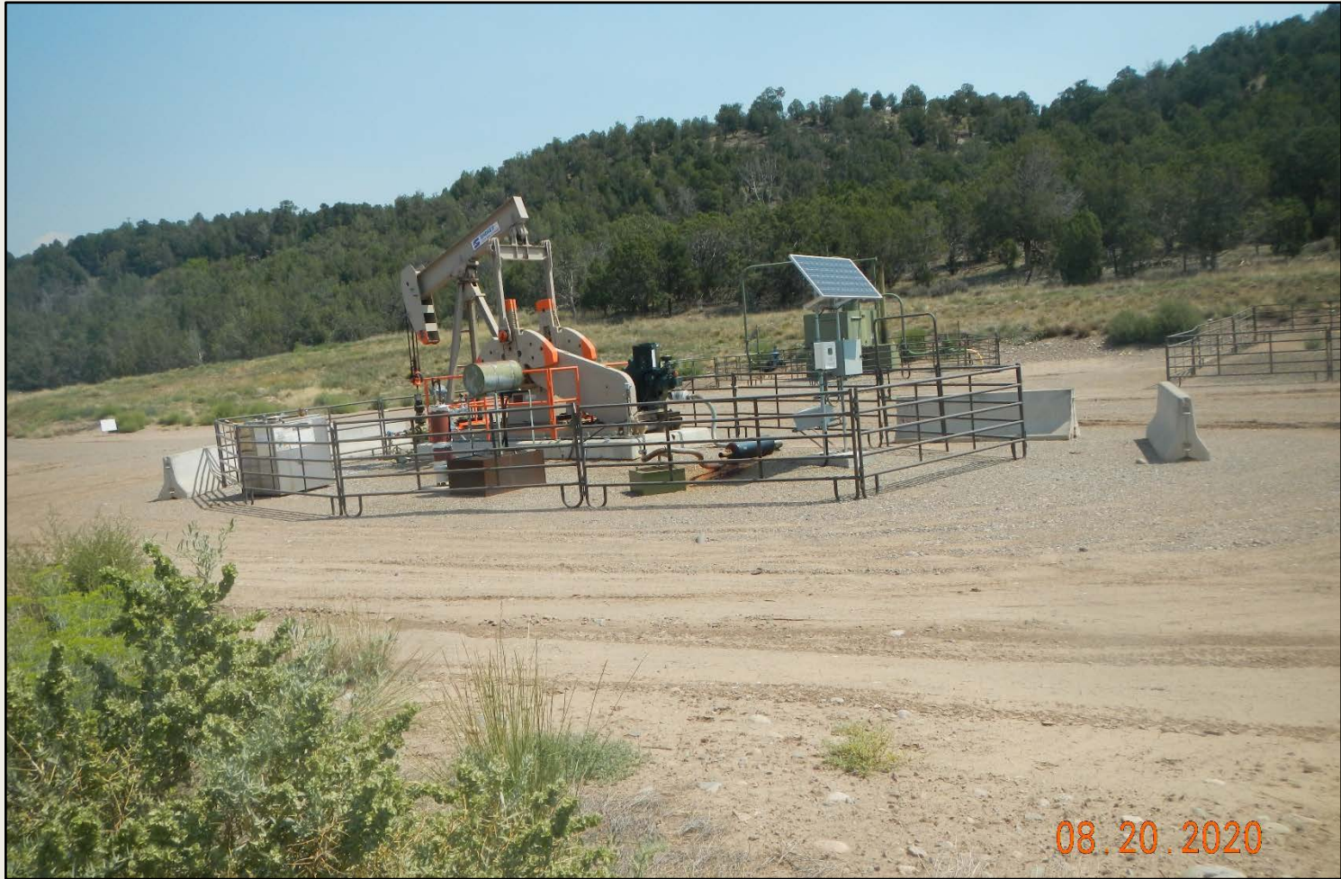
Photo 1. View of the BP well from the western edge facing center.