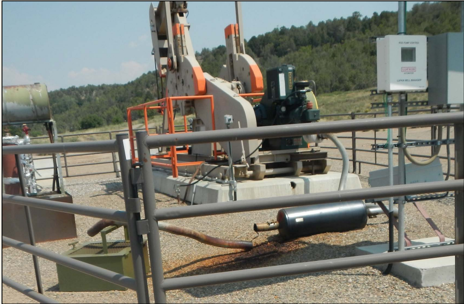
Photo 2. View of stained soils near the well head, approximately 4 feet long and 2.5 feet wide.