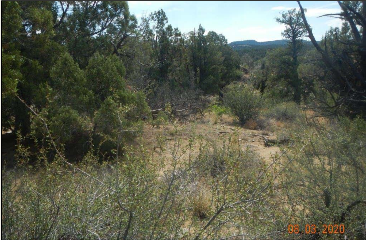
Photo 6. View of reference area comprised of pinyon/juniper woodland vegetation with understory of shrubs and grasses/forbs such as antelope bitterbrush, mountain mahogany, Indian ricegrass and Heterotheca villosa .