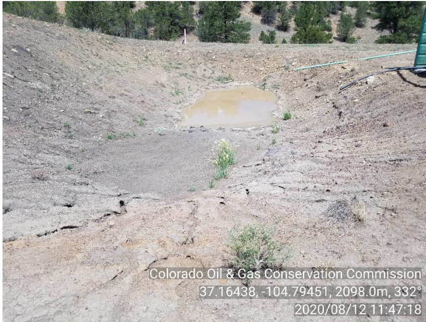
PHOTO 5: NO FREEBOARD MARKER IN PRODUCED WATER PIT. INSTALL FREEBOARD MARKER, COMPLY WITH RULE 902.b. CA DATE 11-12-20.