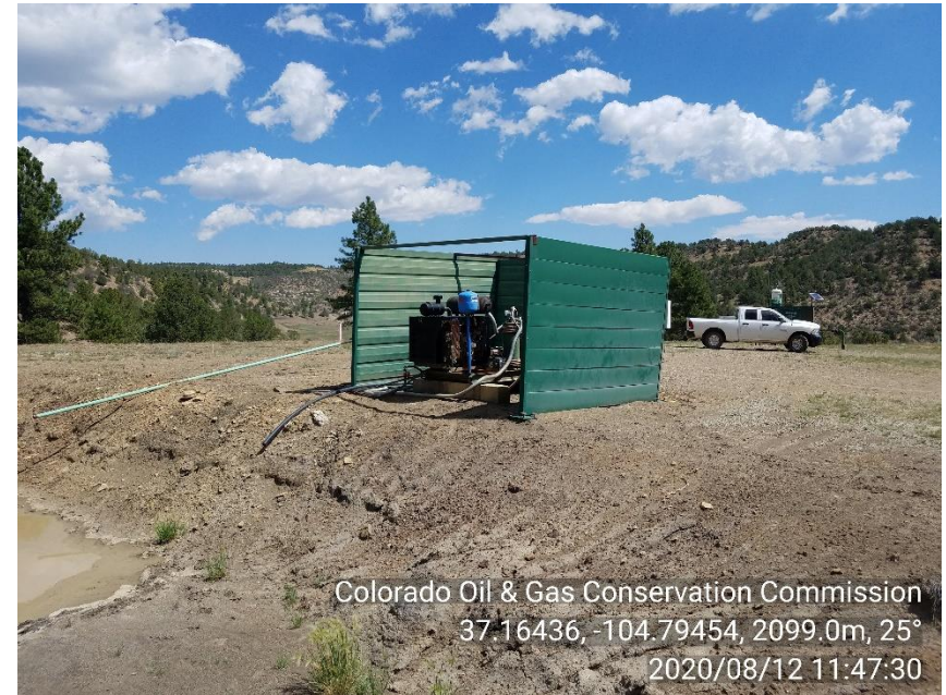
PHOTO 3: NO CURRENT CALIBRATION ON GAS METER. Provide calibration records or calibrate meter as required by Rule 329. CA DATE 9-12-20.

PHOTO 4: UNUSED EQUIPMENT (GAS ENGINE SKID IS NOT CONNECTED). REMOVE UNUSED EQUIPEMNT OR PUT EQUIPMENT INTO USE, COMPLY WITH RULE 603.f. CA DATE 11-12-20.