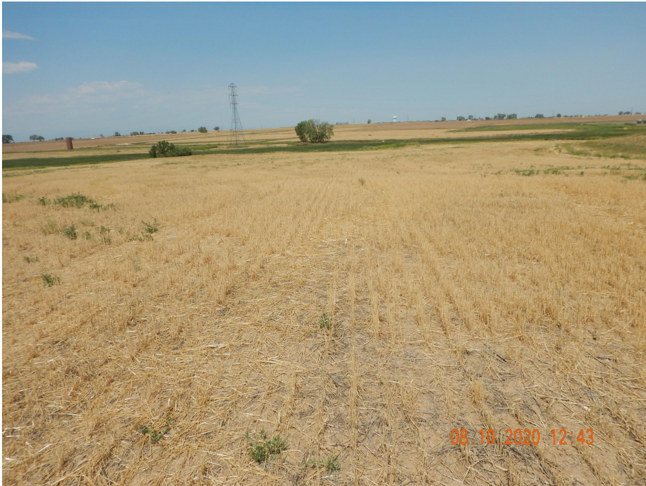
Photo 2. Reference photo taken north of plugged and abandoned well location, facing North. See comments under Photo 1.