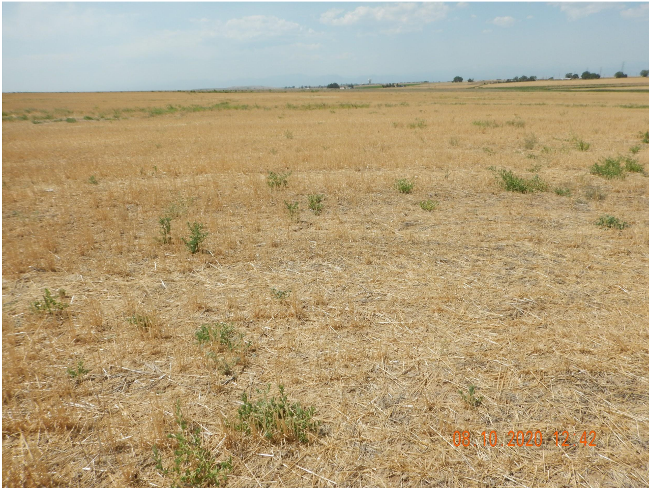
Photo 1. Photo taken from the plugged and abandoned well location, facing West. Photo illustrates wheat has already been harvested. Establishment of crop appears to be reflective of reference areas.