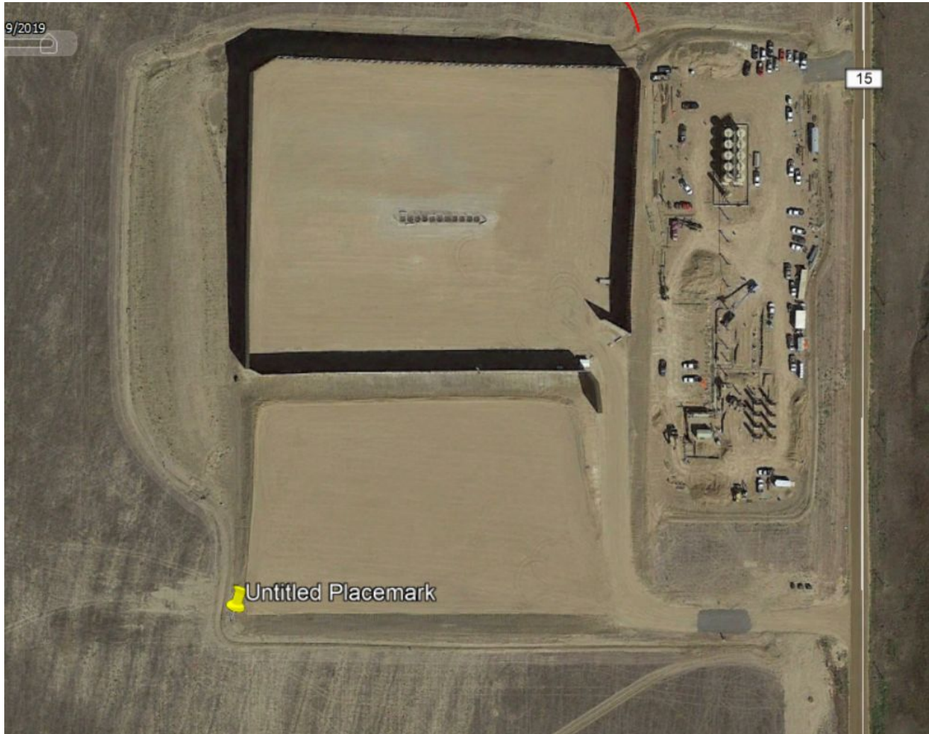
Photo 4. Google Earth aerial imagery taken 9/12/2019 illustrates a new location (Location ID 455598; Hingley /18H-A167) built by Crestone Peak that overlaps most of the previous disturbance areas (i.e, access road and the eastern location); therefore this will be a well release on an active location.