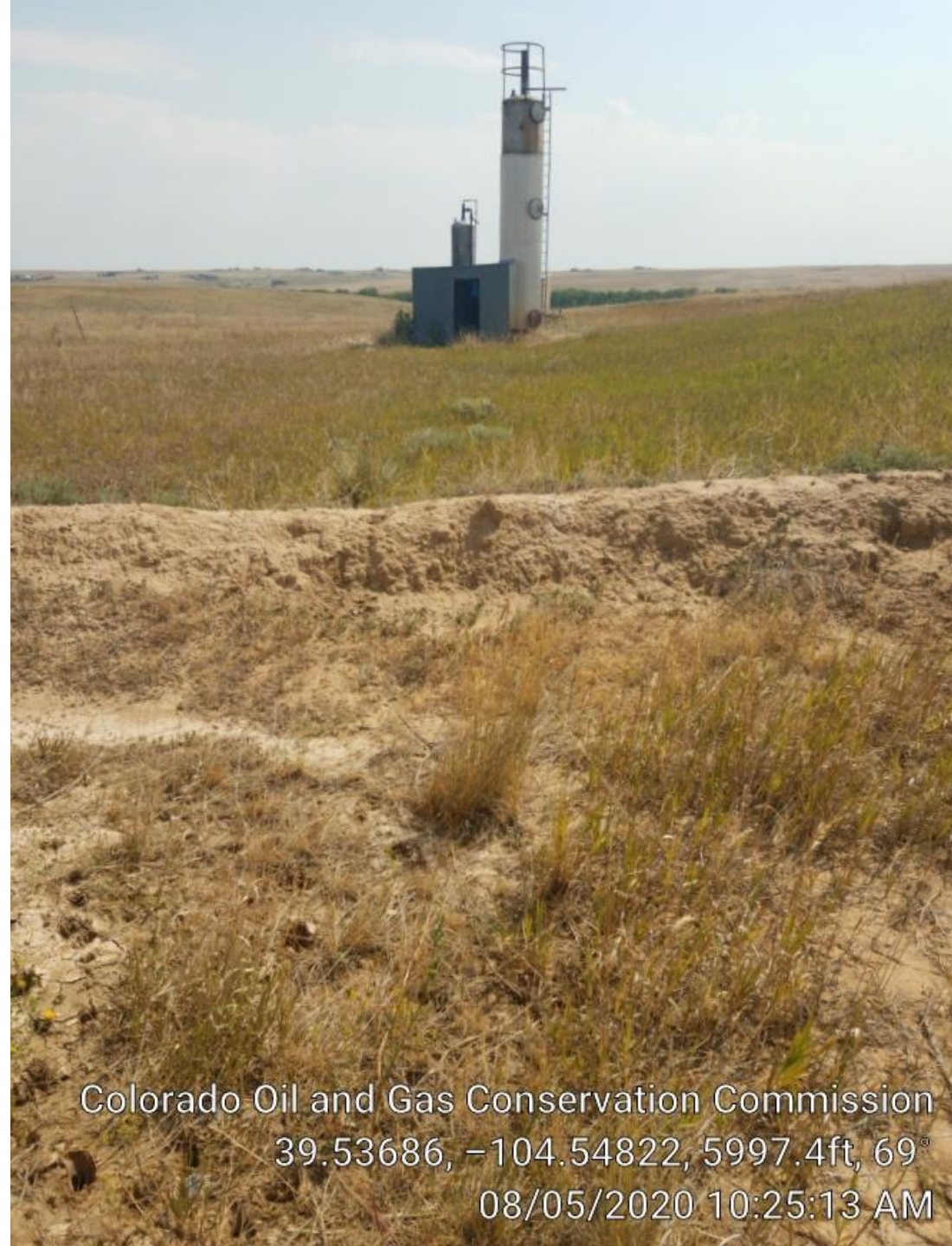
Treater and separator.

Colorado Oil and Gas Conservation Commission 39.53686, -104.54822, 5997.4ft, 69° 08/05/2020 10:25:13 AM