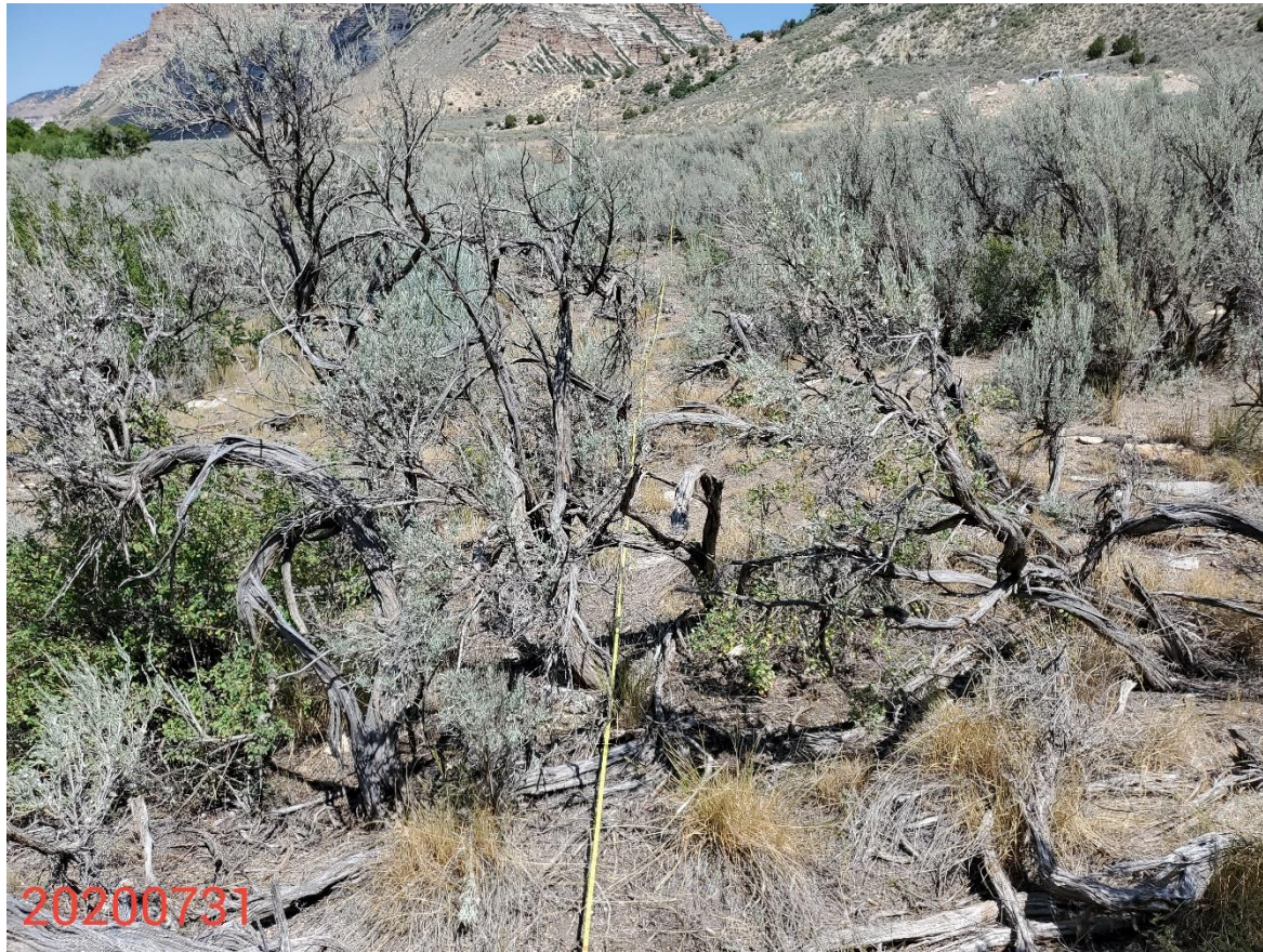
Photo 17: Photo of the end point for reference area transect , facing north