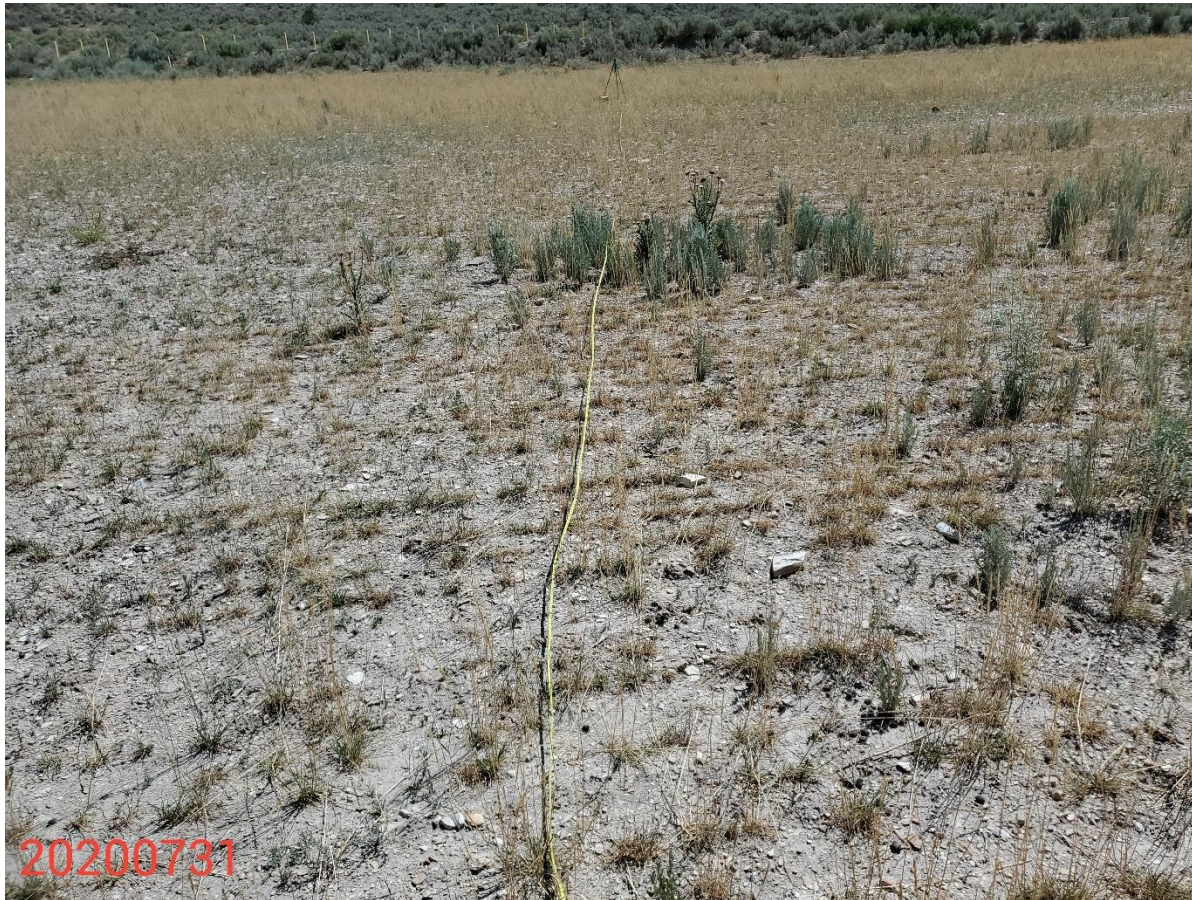
Photo 12: Photo taken from the southeast end of the Location. Photo shows hay bale BMPs. BMP appears to be in proper functioning condition.