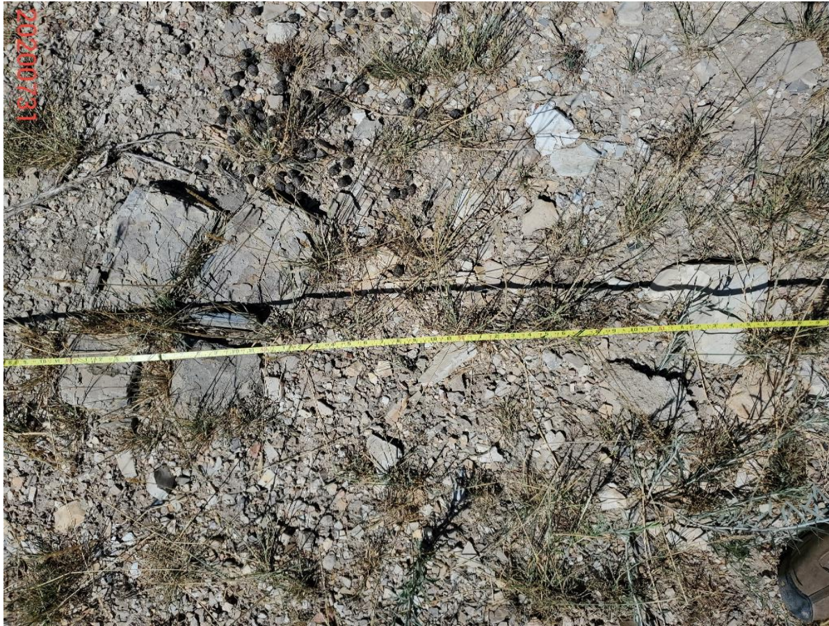
Photo 6: Photo of the 50 th point of the disturbance area transect #1 .