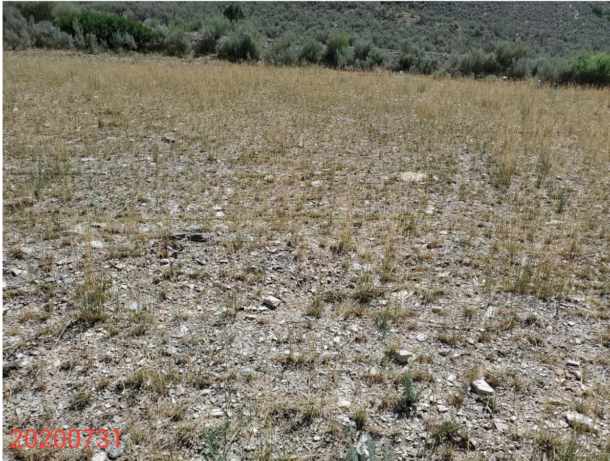
Photo 5: Photo of the 50 th point of the disturbance area transect #1 , facing east.