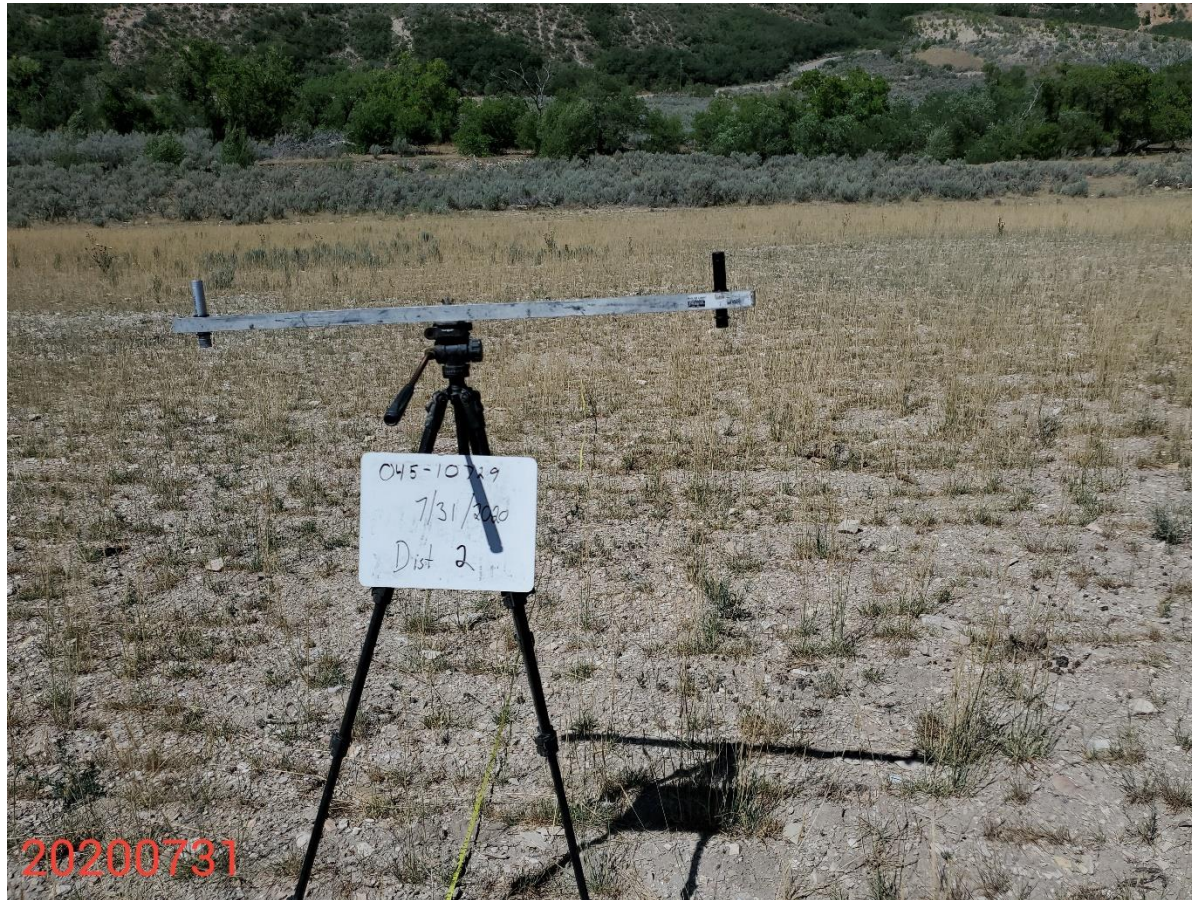
Photo 8: Photo of the starting point for disturbance area transect #2 , facing west.