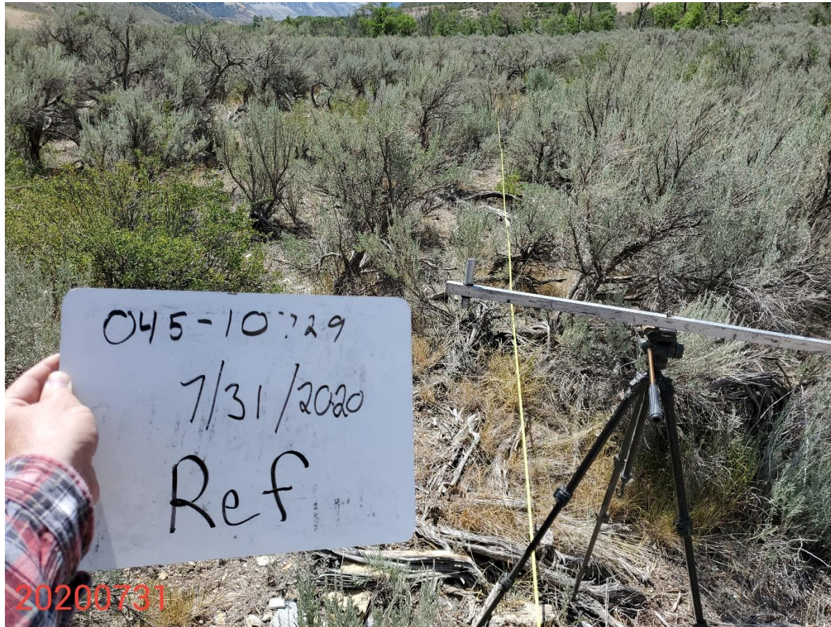
Photo 13: Photo of the starting point for reference area transect , facing south.