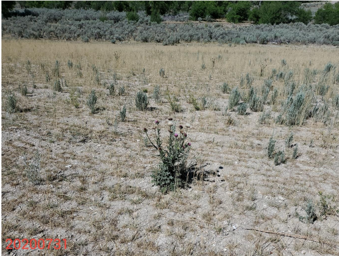
Photo 2: Photo taken from the Location. Photo shows Musk thistle establishing on the location.