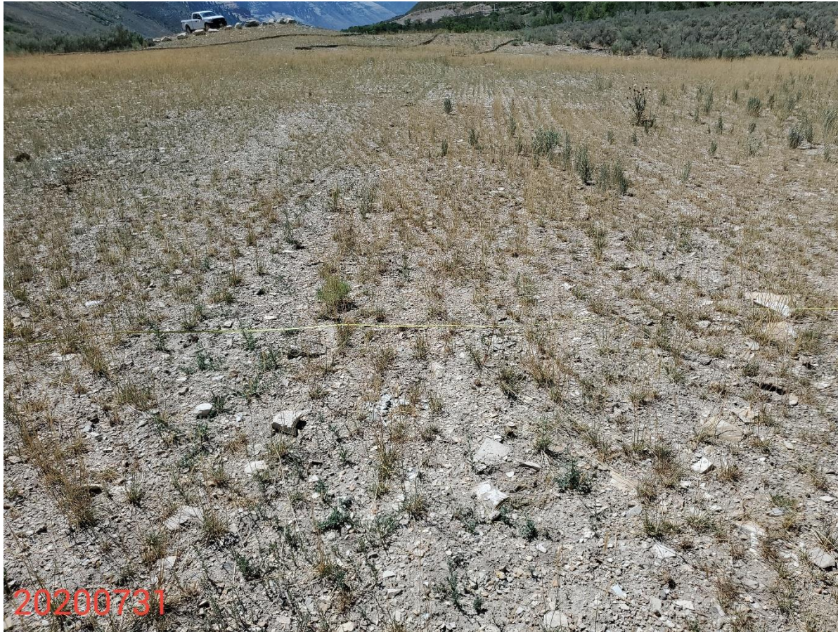
Photo 9: Photo of the 50 th point of the disturbance area transect #2 , facing north