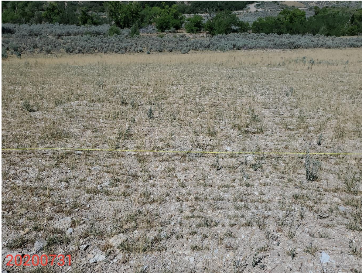
Photo 4: Photo of the 50 th point of the disturbance area transect #1 , facing west.