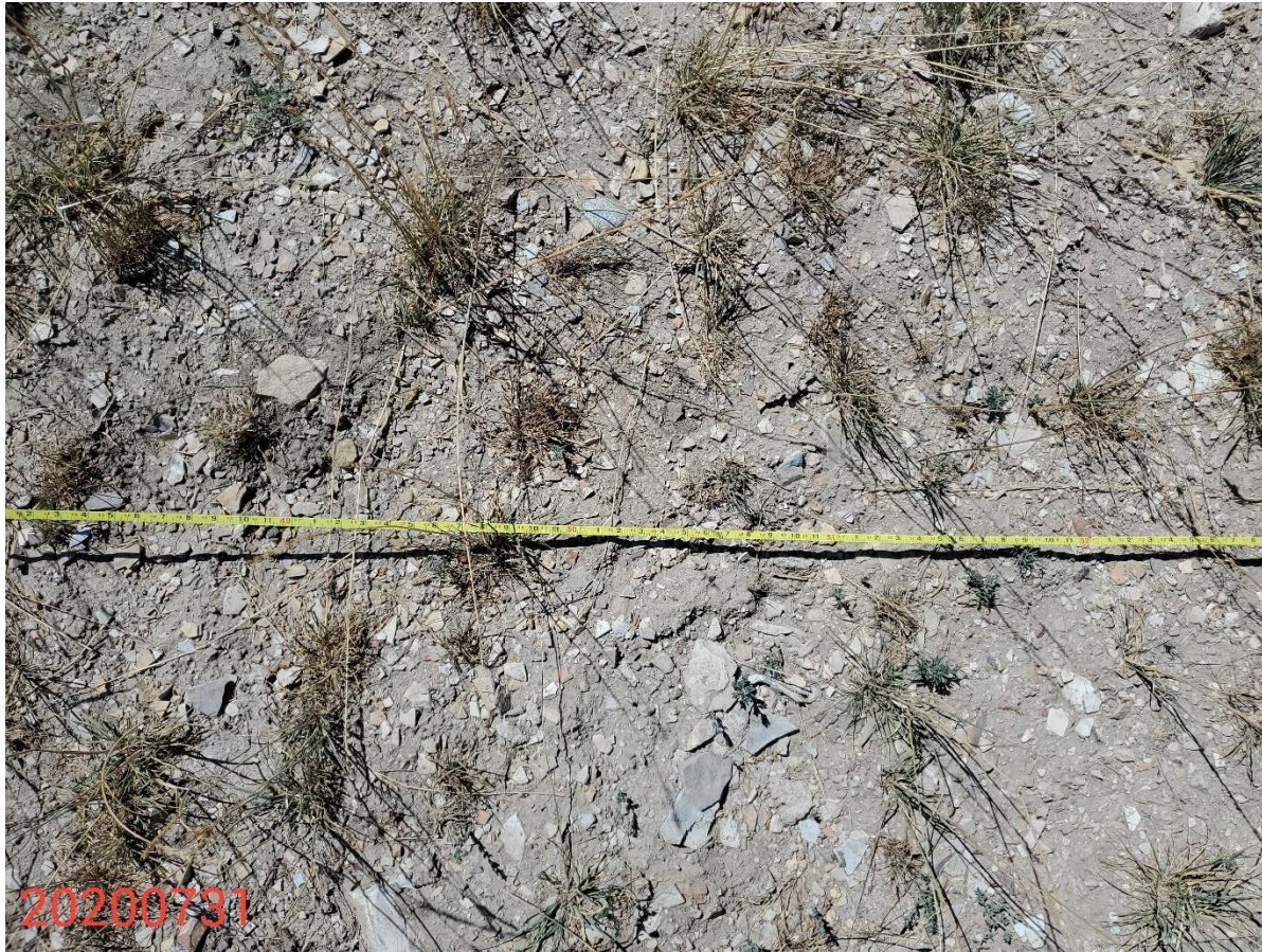
Photo 11: Photo of the 50 th point of the disturbance area transect #2 .