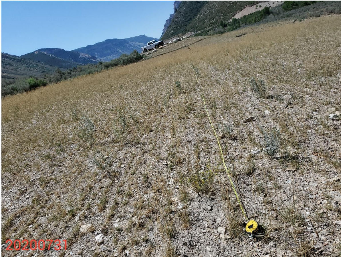
Photo 7: Photo of the end point for the disturbance area transect #1 , facing south.