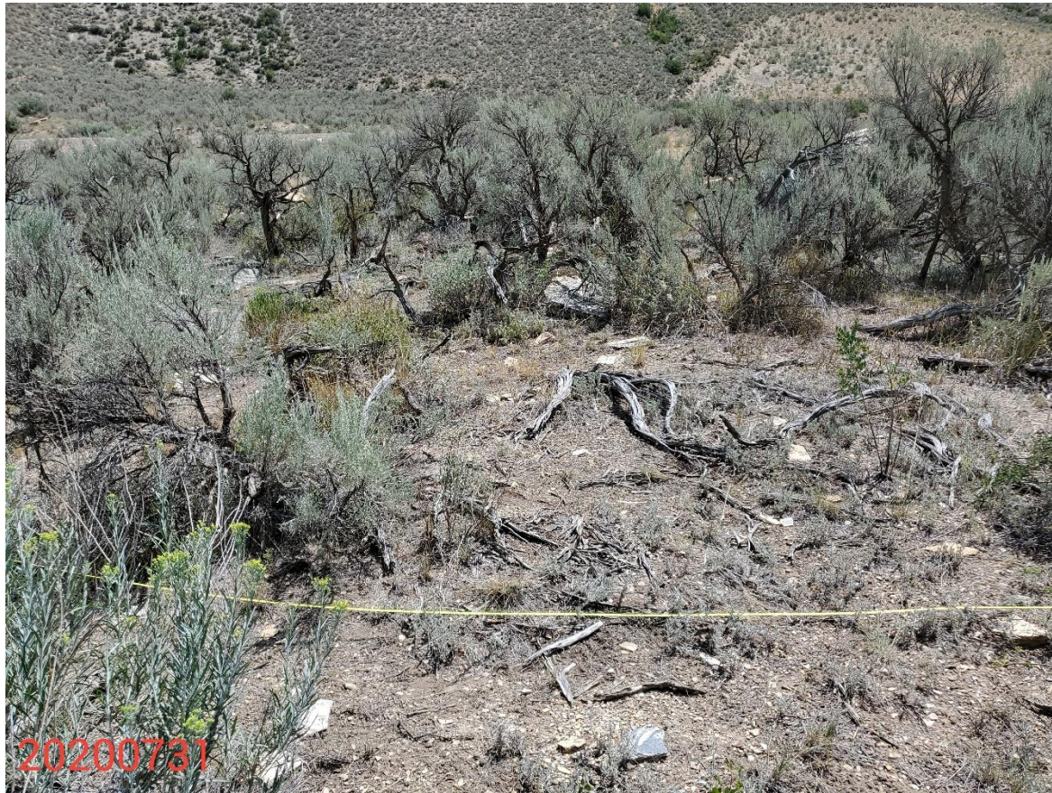
Photo 15: Photo of the 50 th point of the reference area transect , facing east