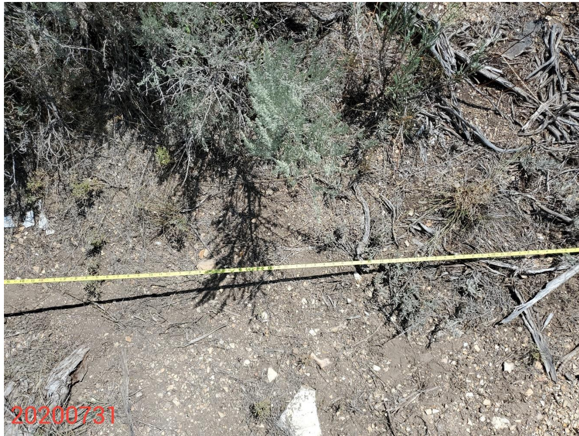
Photo 16: Photo of the 50 th point of the reference area transect .