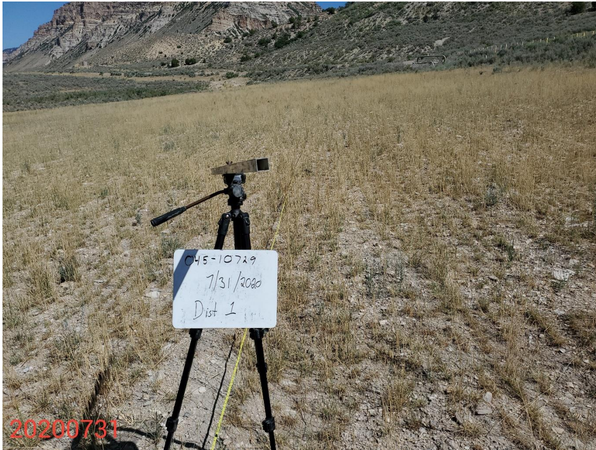
Photo 3: Photo of the starting point for disturbance area transect #1 , facing north.