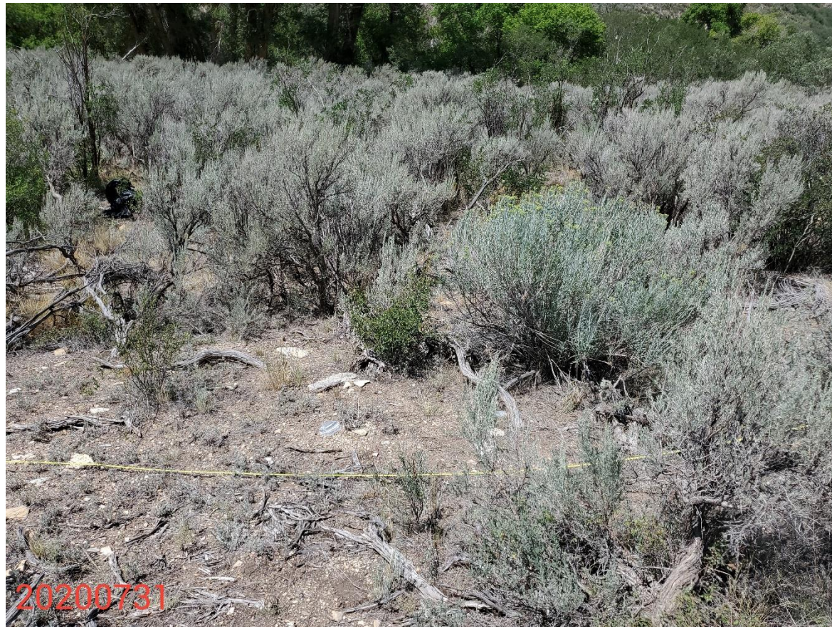
Photo 14: Photo of the 50 th point of the reference area transect , facing west