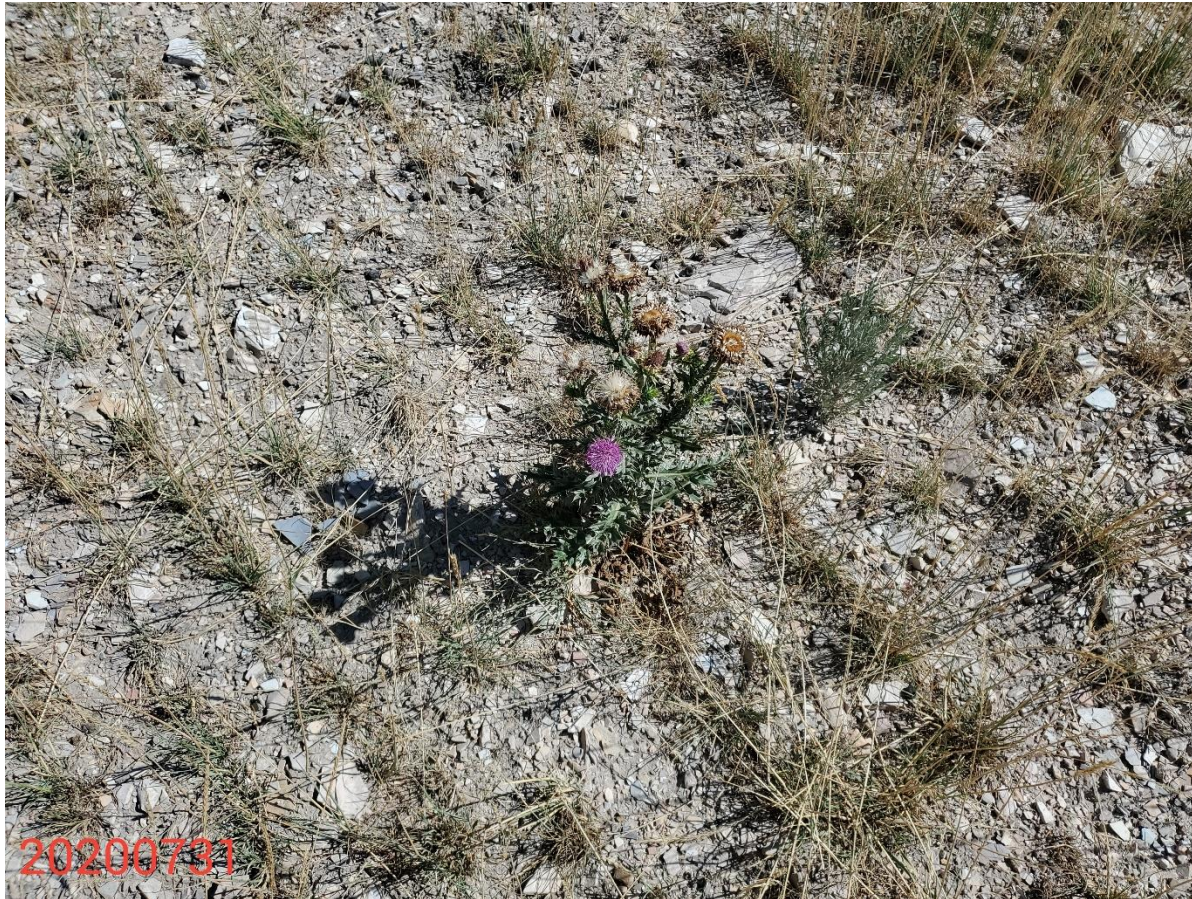
Photo 1: Photo taken from the Location. Photo shows Musk thistle establishing on the location.