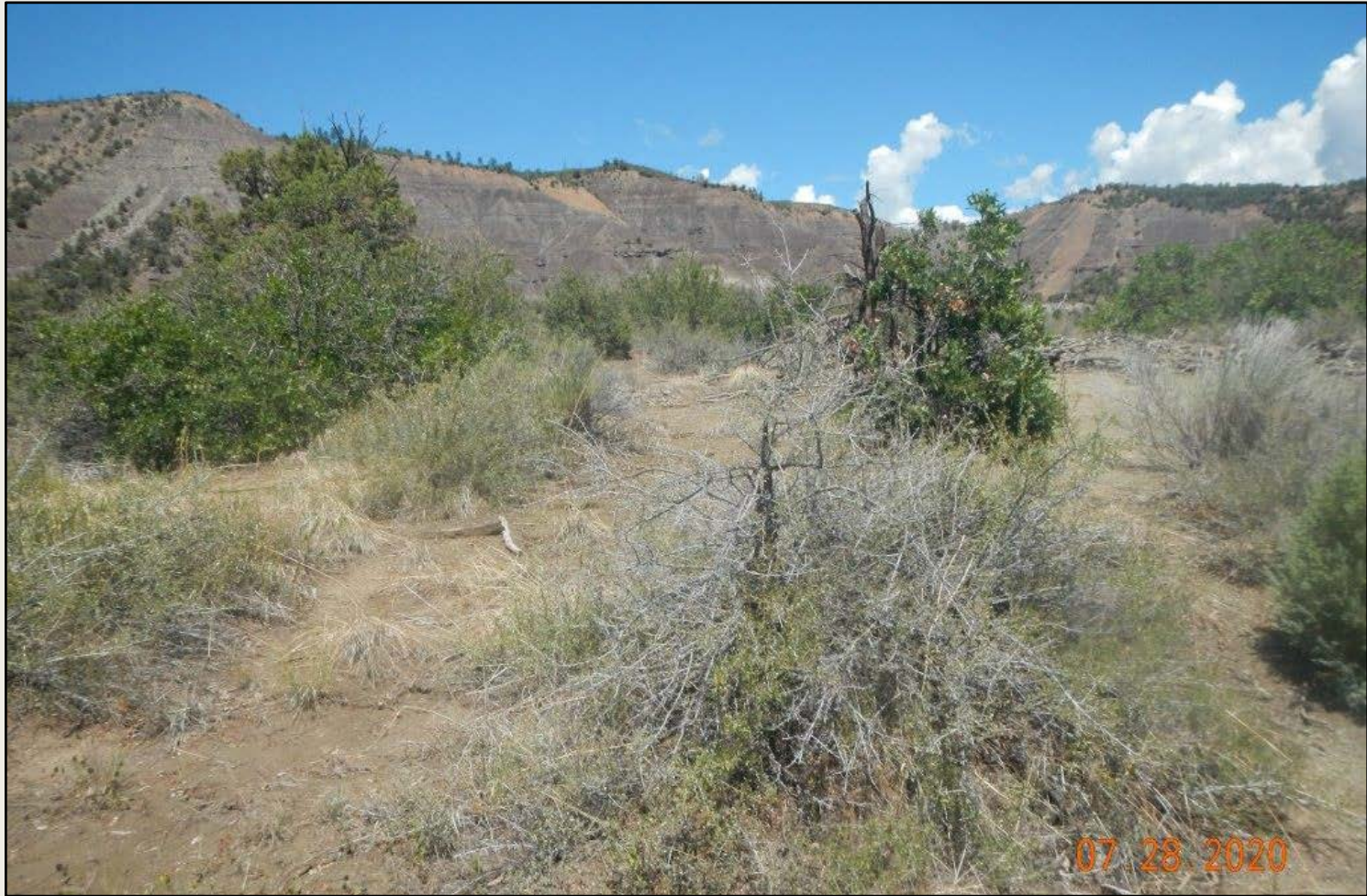
Photo 4. View of reference area vegetation comprised of gambel oak and antelope bitterbrush-dominated shrubland with grasses such as western wheatgrass and blue grama common in the understory.