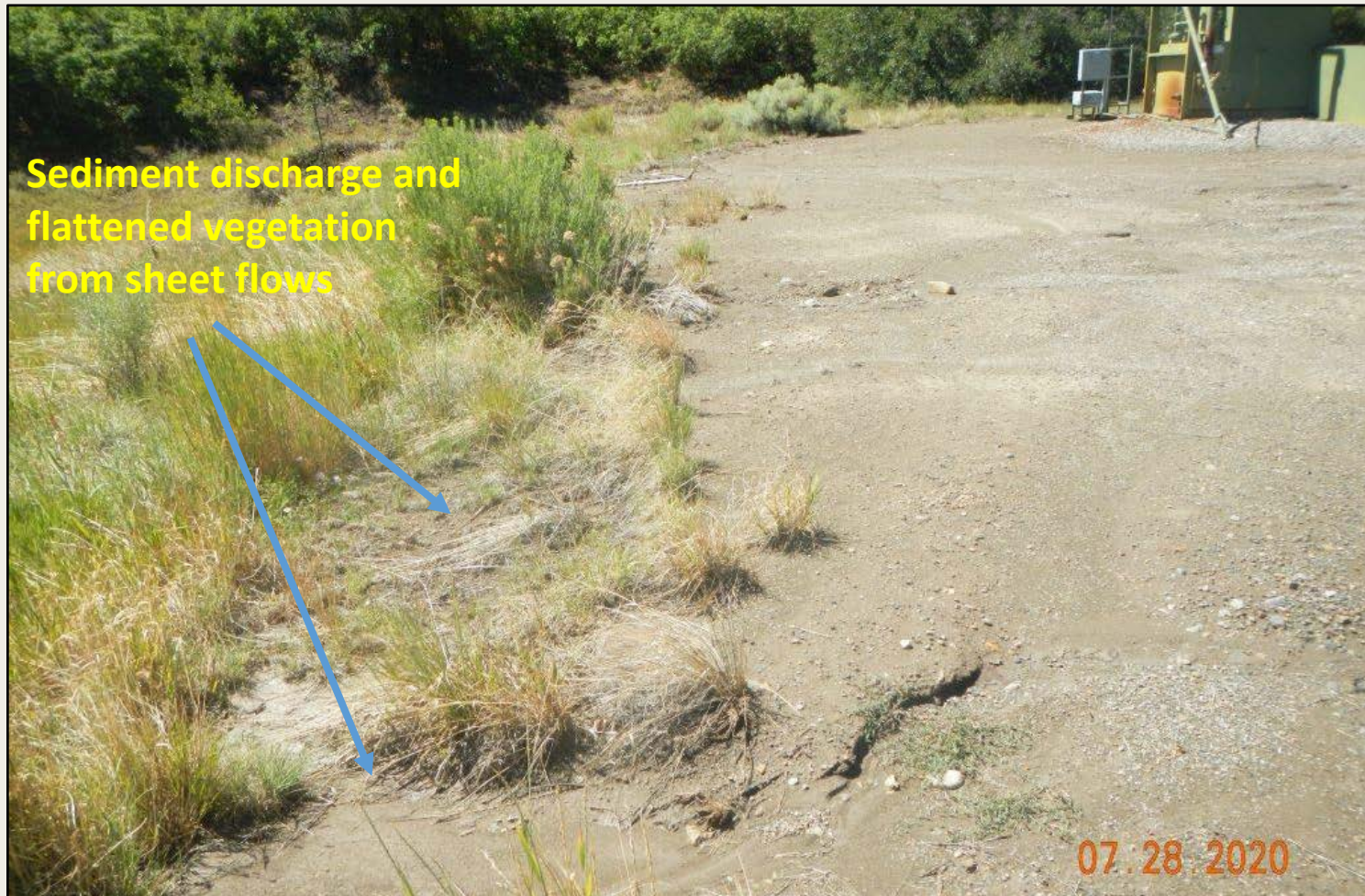
Photo 1. View of the eastern project area from the eastern edge facing southward. Stormwater sheet-flows are carrying sediment off of the eastern edge of the project area.