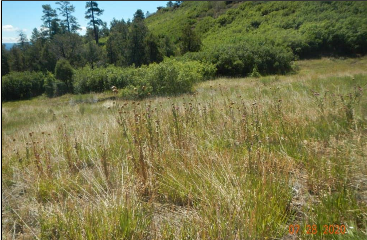
Photo 3. View of musk thistles within the eastern project area. Approximately 200 individuals observed.