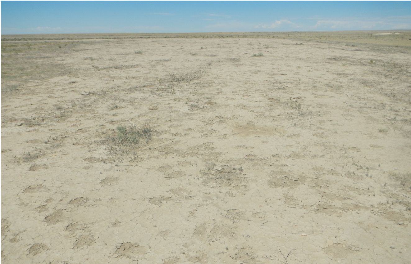
Photo 6. Northeast side of the location facing west. This area does not have adequate vegetation growth which is approximately 300 ft. x 100ft.