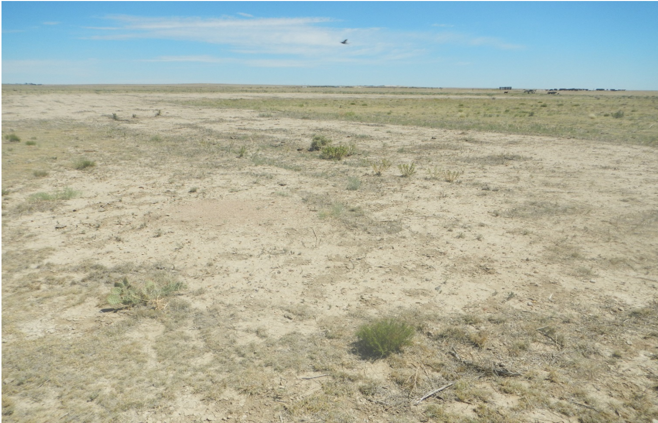
Photo 9. Facing northeast toward the location. Vegetation has established in the center of the location. However, the perimeter area of the location has not established vegetation.