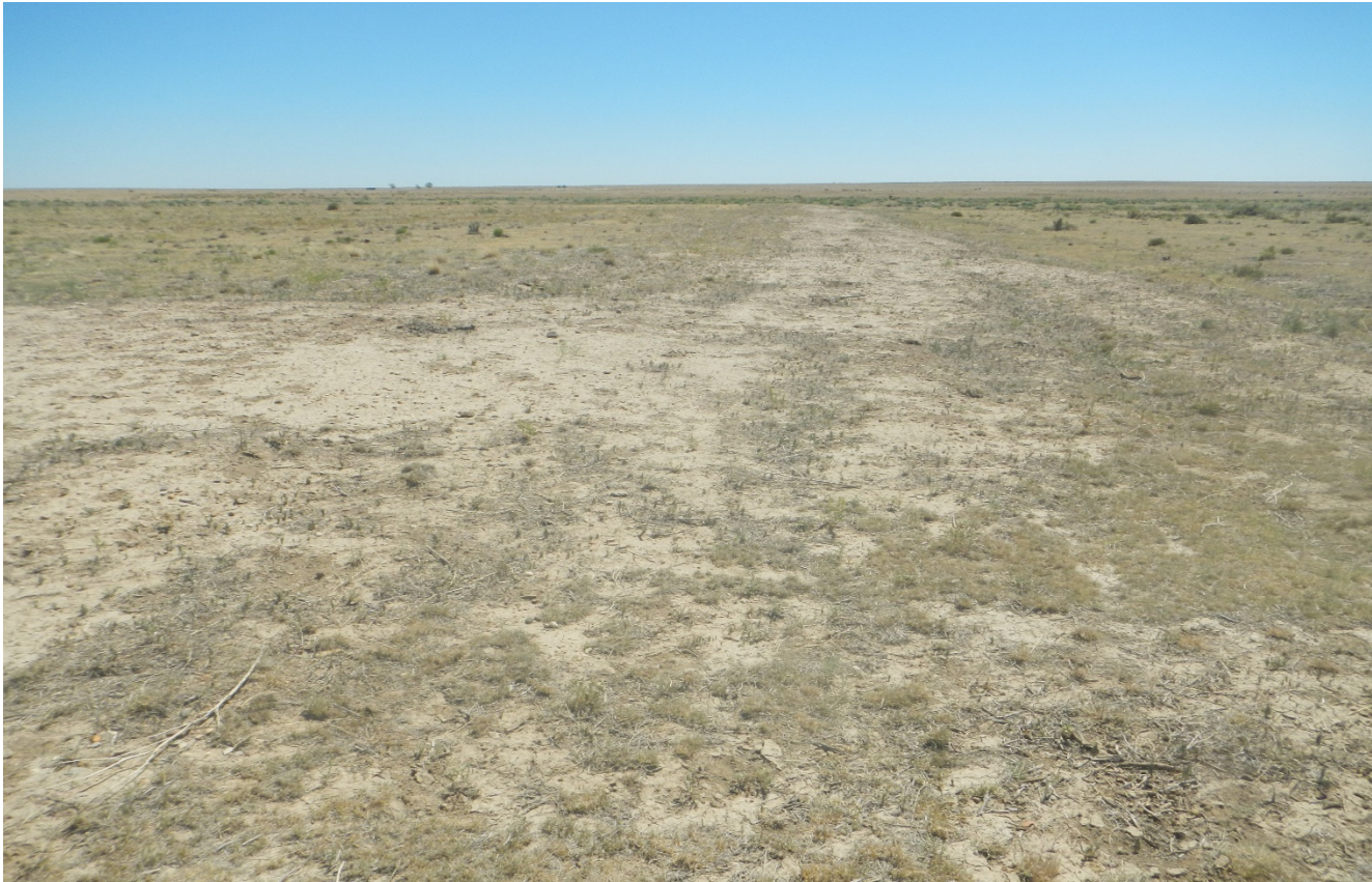
Photo 10. Southwest side of the location facing east. This area does not have adequate vegetation growth which is approximately 300 ft. x 40ft.