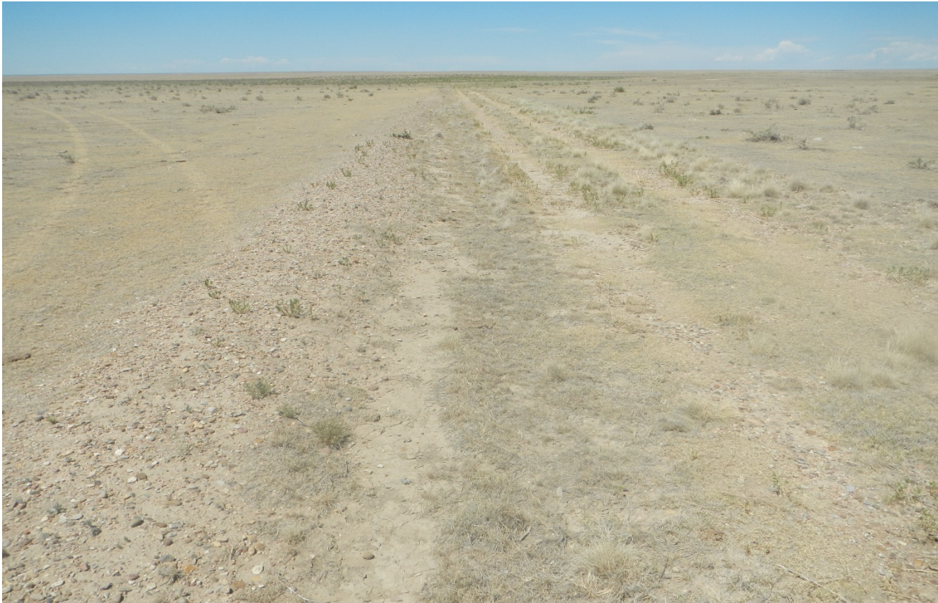
Photo 2. Facing east along the two track access road.