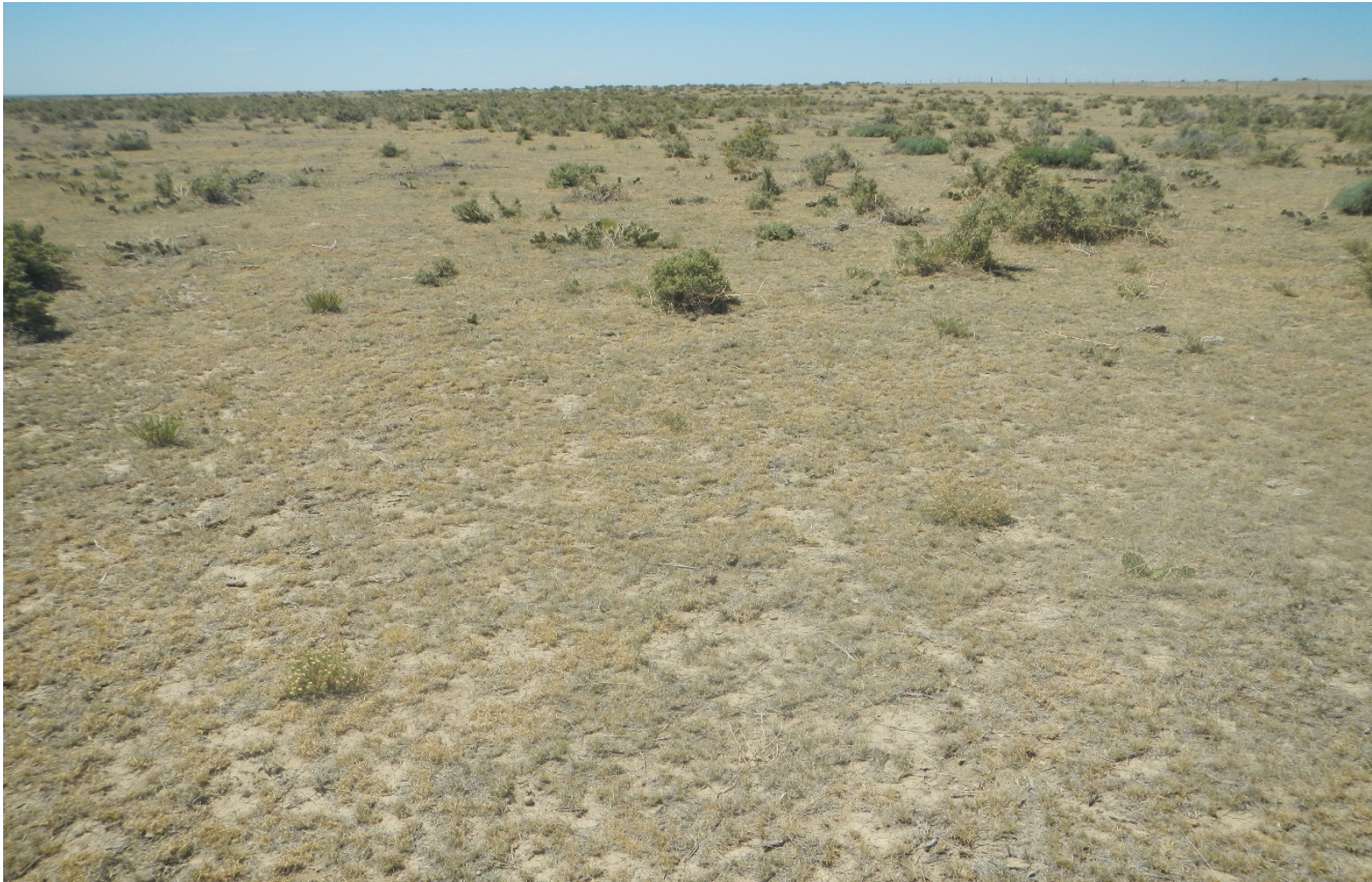
Photo 11. Facing south toward the surrounding undisturbed reference area, which consists of Blue grama grassland and shrubland.