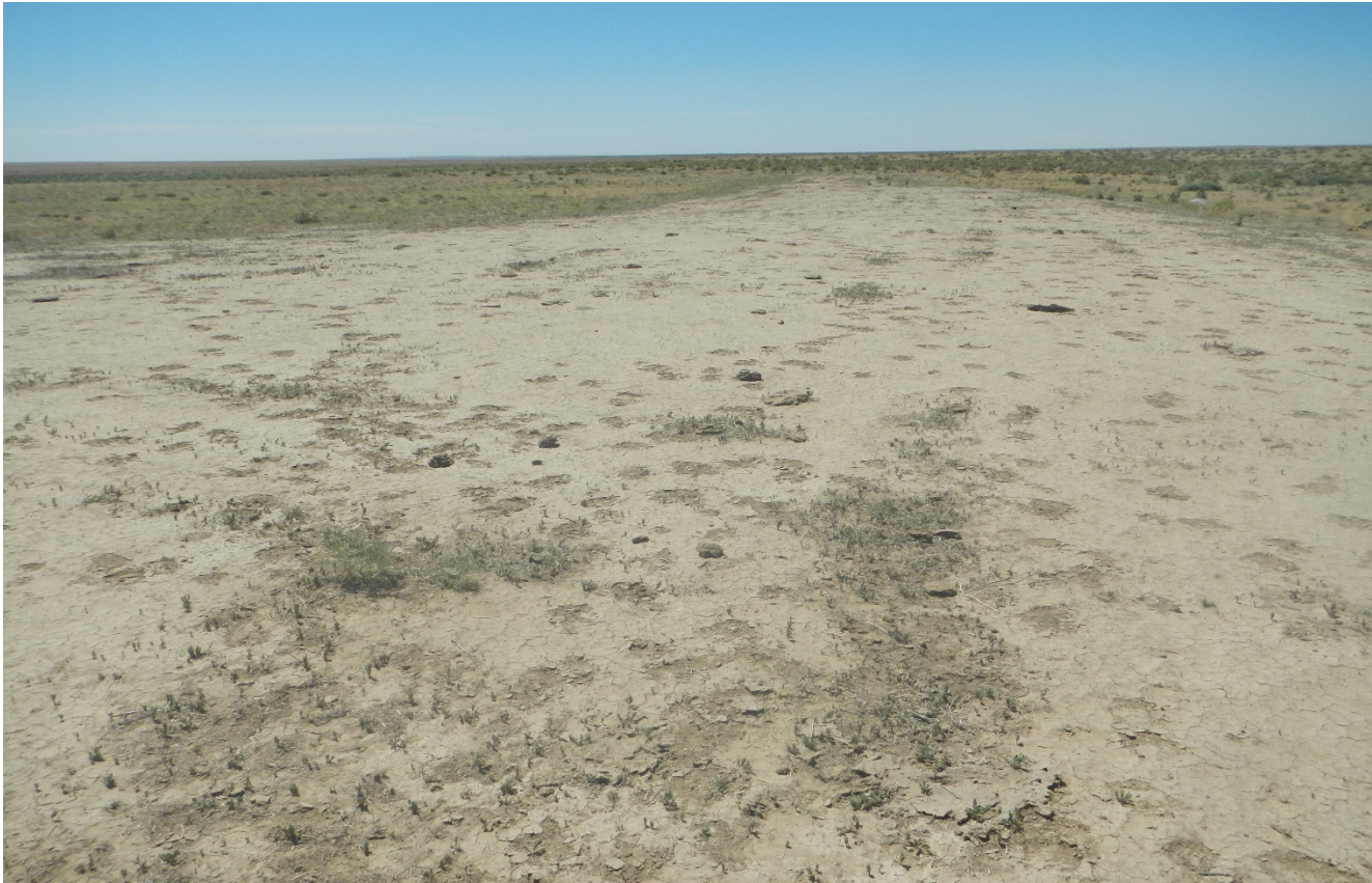
Photo 8. Northwest side of the location facing south. This area does not have adequate vegetation growth which is approximately 300 ft. x 70ft.