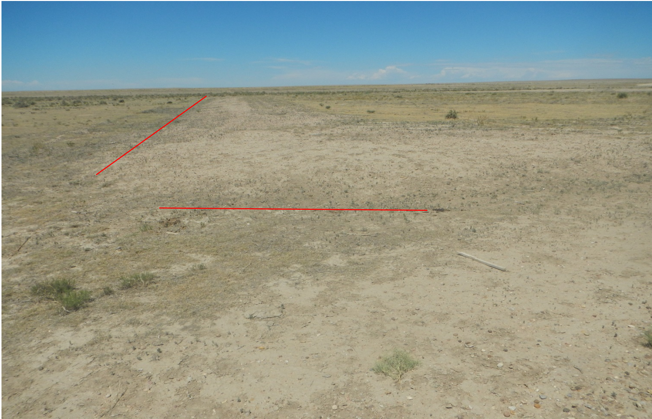
Photo 4. Facing west at the south side of the location. The area outlined has not been contoured and vegetation has not established.