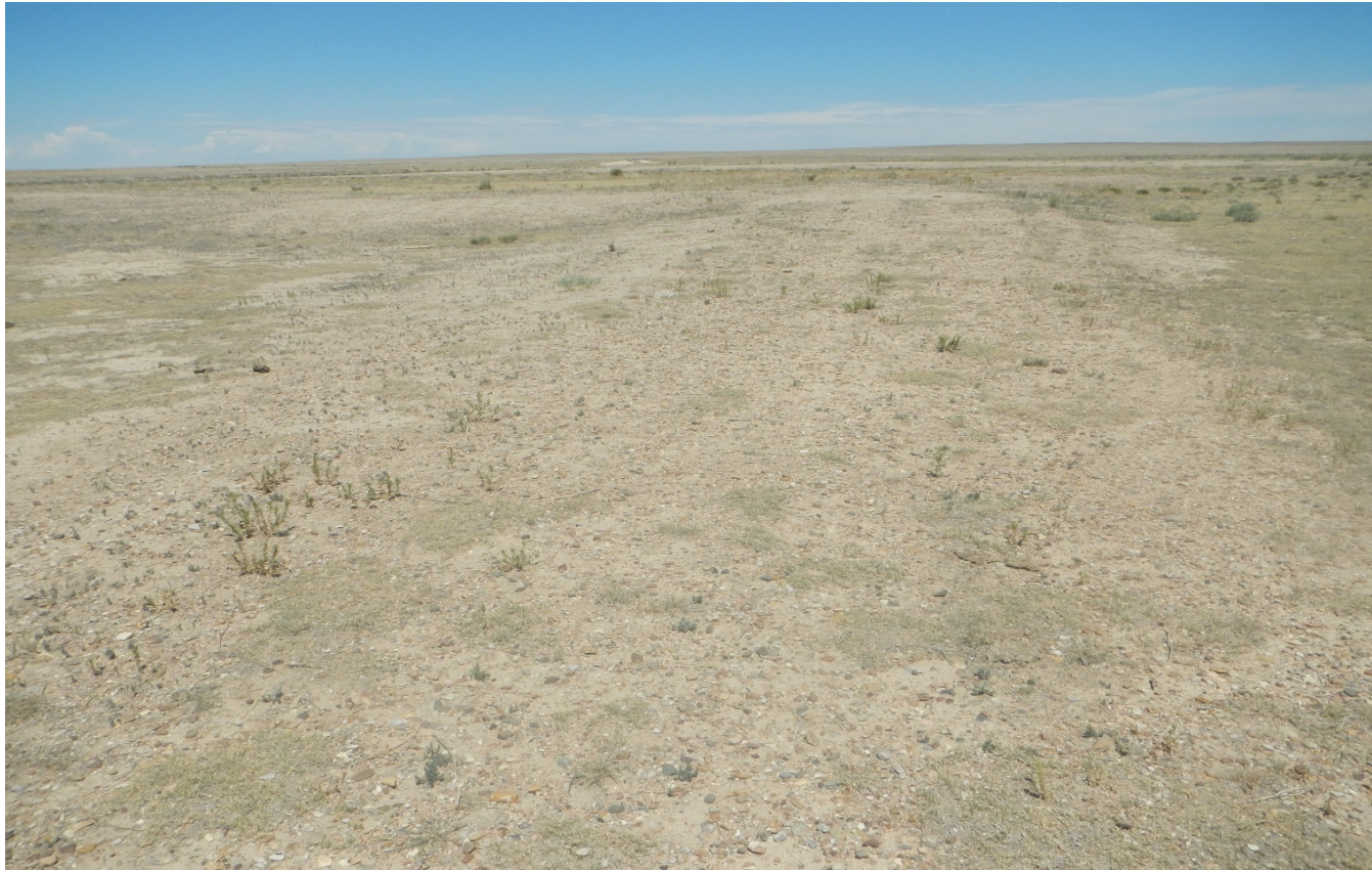
Photo 3. Facing northwest toward the location. This area of the location has not established vegetation and is not recontoured.