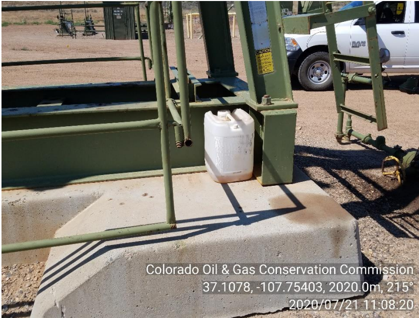
PHOTO 13: TRASH ON LOCATION (5 GAL. BUCKET). REMOVE ALL TRASH ON AND AROUND LOCATION COMPLY WITH RULE 603.f. CA DATE 10-21-20.