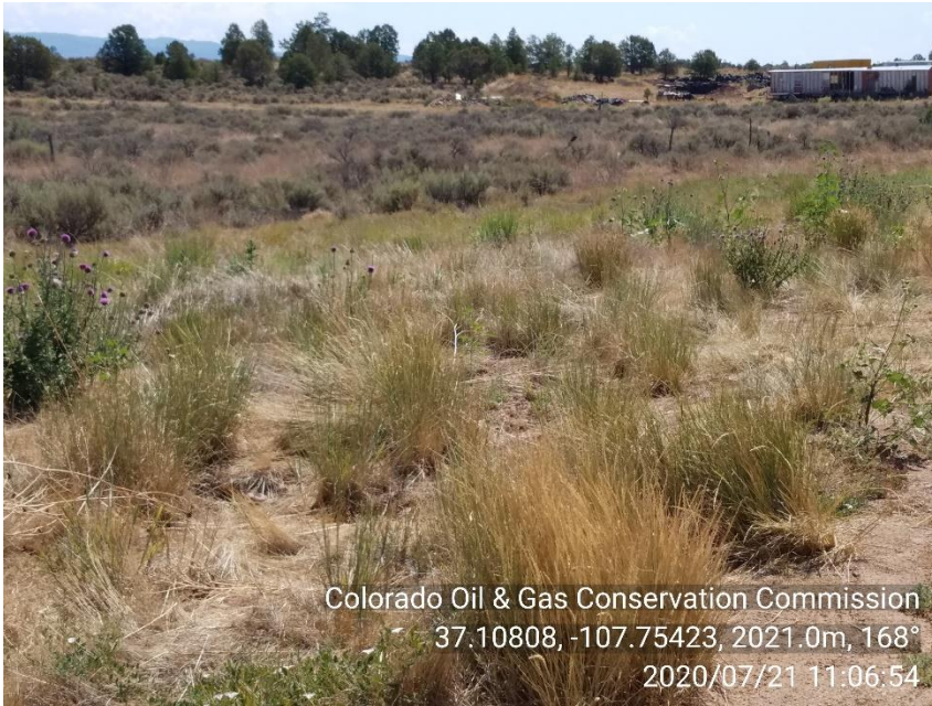
PHOTO 7: MORE IMAGES OF NOXIOUS WEEDS. SEE PREVIOUS PHOTO FOR CORRECTIVE ACTION.