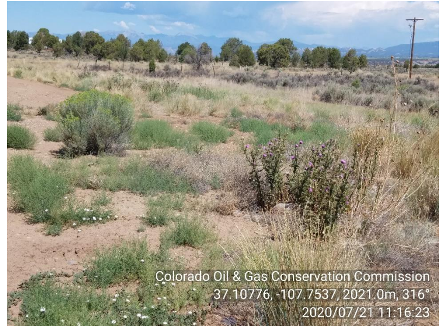
PHOTO 8: MORE IMAGES OF NOXIOUS WEEDS. SEE PHOTO 6 FOR CORRECTIVE ACTION.