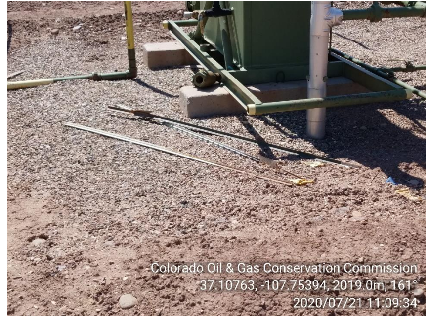
PHOTO 16: UNUSED EQUIPMENT STORED ON LOCATION (T POSTS). REMOVE ALL UNUSED EQUIPMENT FROM LOCATION COMPLY WITH RULE 603.f. CA DATE 10-21-20.