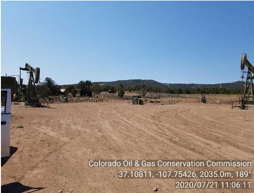
Colorado Oil & Gas Conservation Commission 37.10811, -107.75426, 2035.0m, 189° 2020/07/21 11:06:11