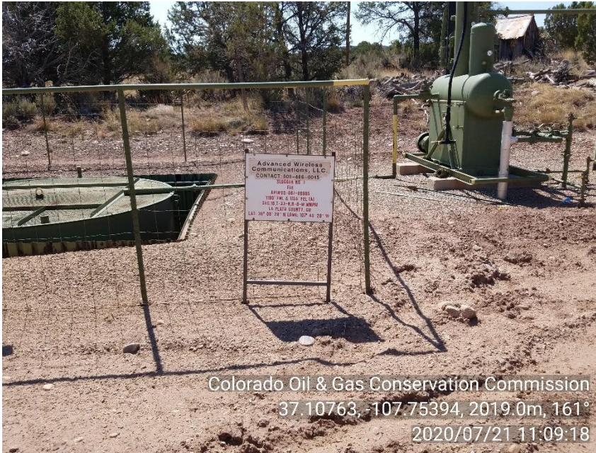
PHOTO 3: WELL SIGN/ 911 NOT LISTED AS EMERGENCY CALL NUMBER ON BATTERY SIGN. INSTALL SIGN TO COMPLY WITH RULE 210.b. CA DATE 10-21-20.