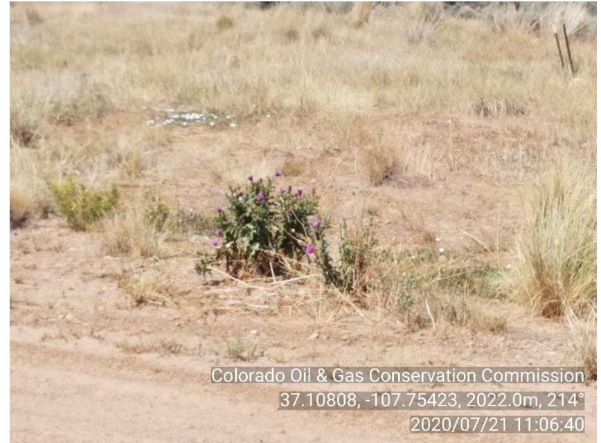
PHOTO 6: NOXIOUS WEEDS ON THE OUTER PERIMETER OF LOCATION. REMOVE WEEDS IN ACCORDANCE WITH RULE 603.f. CA DATE 8-10-20.