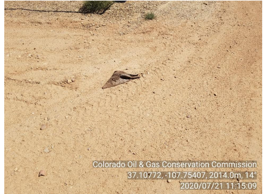
PHOTO 14: TRASH ON LOCATION (NEAR SLUGGER NO.1 PUMP JACK ENGINE). REMOVE ALL TRASH ON AND AROUND LOCATION COMPLY WITH RULE 603.f. CA DATE 10-21-20.