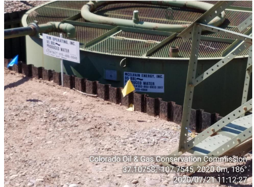
PHOTO 19: UNUSED EQUIPMENT STORED ON LOCATION (UNUSED RISER). REMOVE ALL UNUSED EQUIPMENT FROM LOCATION COMPLY WITH RULE 603.f. CA DATE 10-21-20.

Colorado Oil & Gas Conservation Commission 37.10758, -107.7545, 2020.0m, 186° 2020/07/21 11:12:27