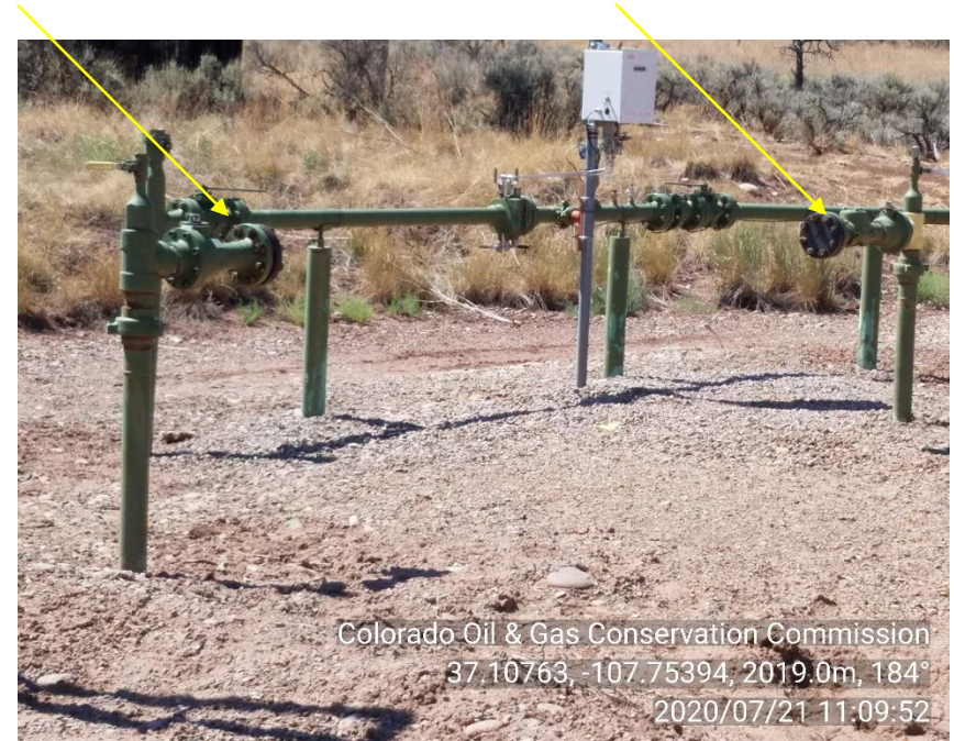
PHOTO 18: UNUSED EQUIPMENT STORED ON LOCATION (UNUSED RISERS). REMOVE ALL UNUSED EQUIPMENT FROM LOCATION COMPLY WITH RULE 603.f. CA DATE 10-21-20.