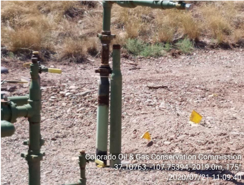
PHOTO 17: UNUSED EQUIPMENT STORED ON LOCATION (UNUSED RISER). REMOVE ALL UNUSED EQUIPMENT FROM LOCATION COMPLY WITH RULE 603.f. CA DATE 10-21-20.