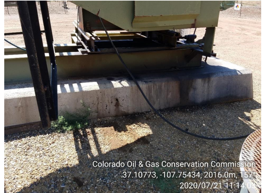
PHOTO 21: AREA OF IMPACTED SOIL NEAR SLUGGER NO. 1 PUMP JACK MOTOR APPEARS TO BE OIL FROM LEAKING MOTOR. Securely fasten all valves, pipes, and fittings to ensure good mechanical condition, inspect at regular intervals and maintain in good mechanical condition per Rule 605.d. CA DATE 10-21-20.

PHOTO 22: AREA OF IMPACTED SOIL NEAR SLUGGER NO. 11 PUMP JACK MOTOR APPEARS TO BE OIL FROM LEAKING MOTOR. Securely fasten all valves, pipes, and fittings to ensure good mechanical condition, inspect at regular intervals and maintain in good mechanical condition per Rule 605.d. CA DATE 10-21-20.