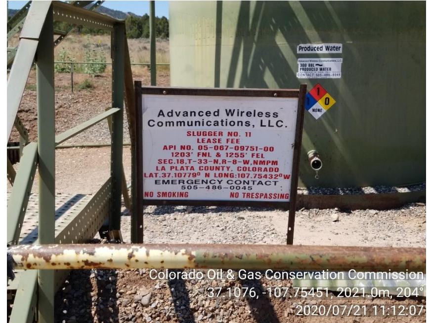
Colorado Oil & Gas Conservation Commission 37.1076, -107.75451, 2021.0m, 204° 2020/07/21 11:12:07