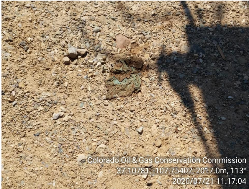
PHOTO 15: TRASH ON LOCATION (IN FRONT OF SLUGGER NO.1 WELLHEAD). REMOVE ALL TRASH ON AND AROUND LOCATION COMPLY WITH RULE 603.f. CA DATE 10-21-20.