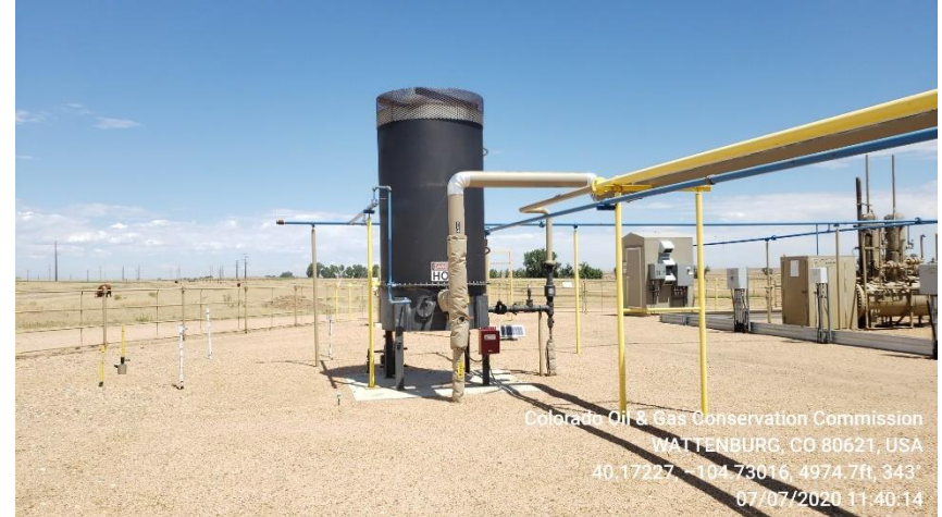
Photo 6 ECD