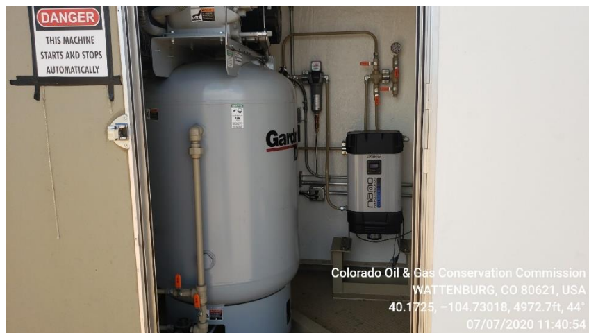
Photo 7 Compressor