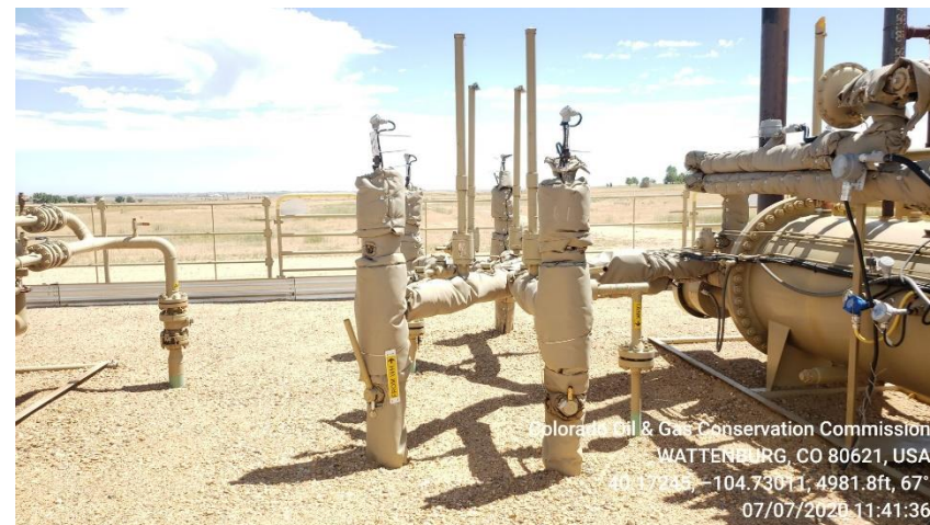
Photo 10 Flow lines