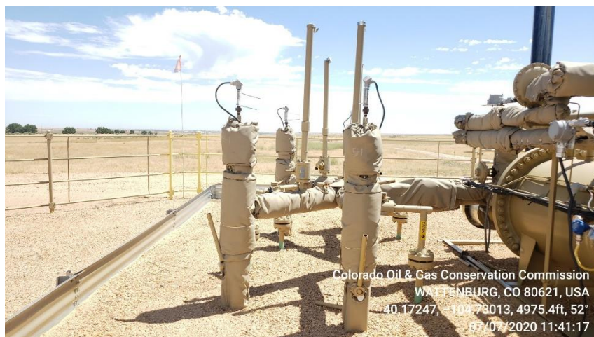
Photo 9 Flow lines