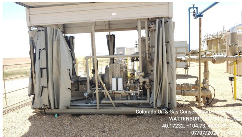
Photo 11 VRU