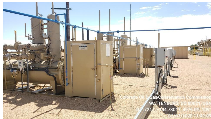
Photo 8 Horizontal Heated Separators