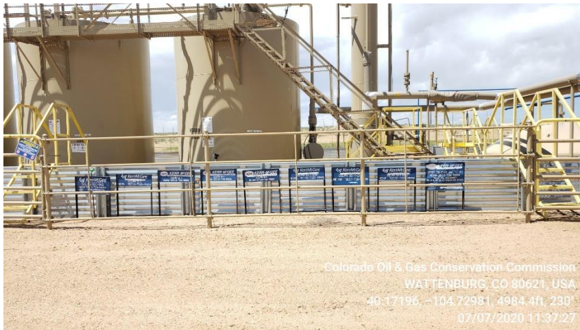
Photo 1 TB signs