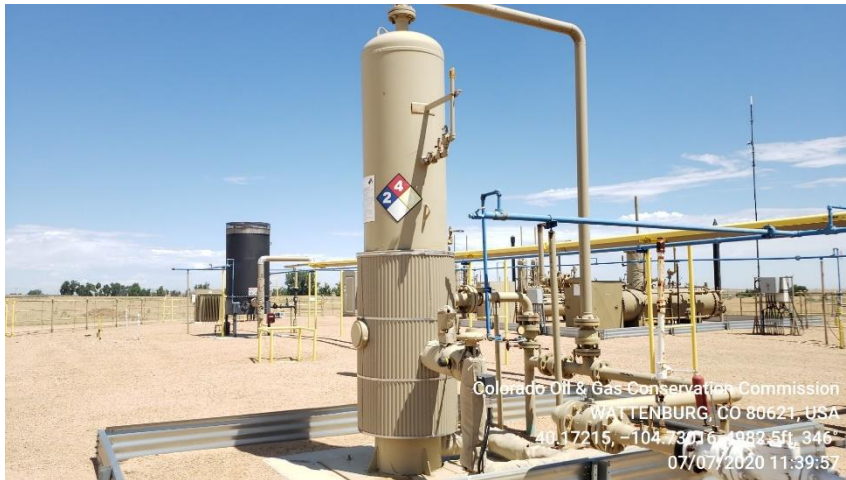
Photo 5 Vertical separator