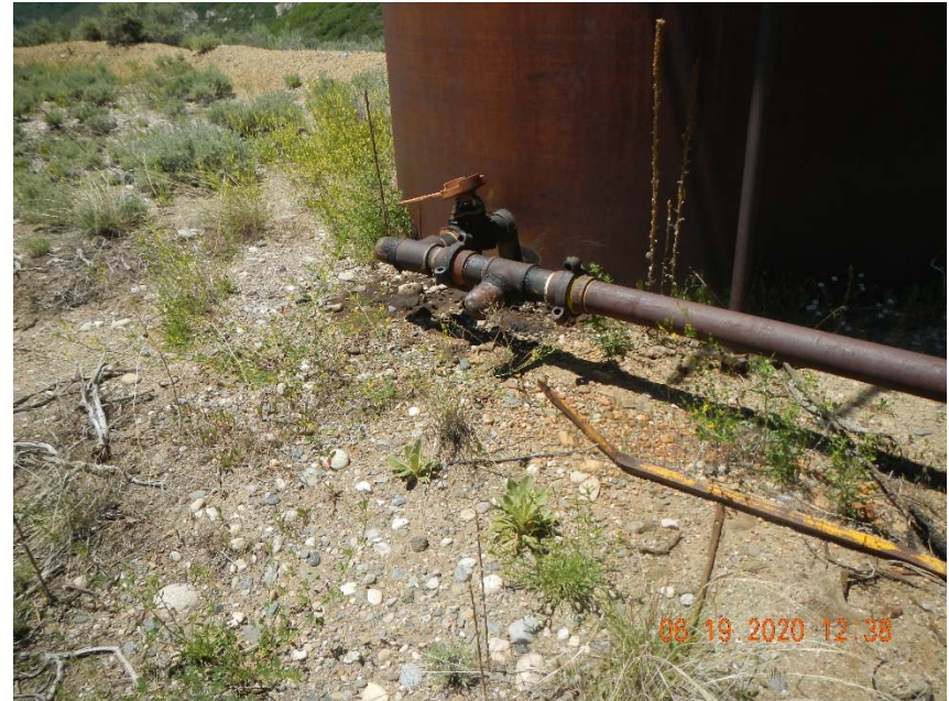
Photo 4. Stained soil.