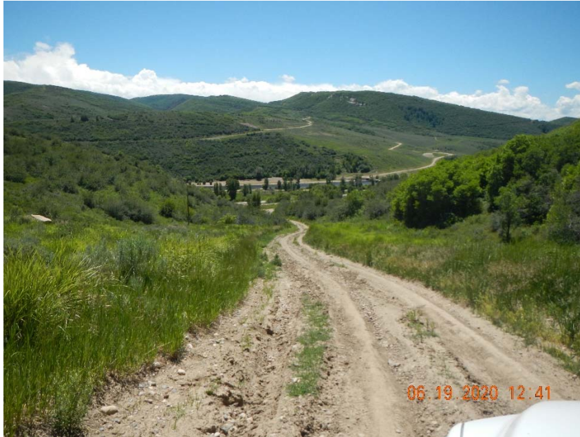
Photo 7. Sediment migration down access road.