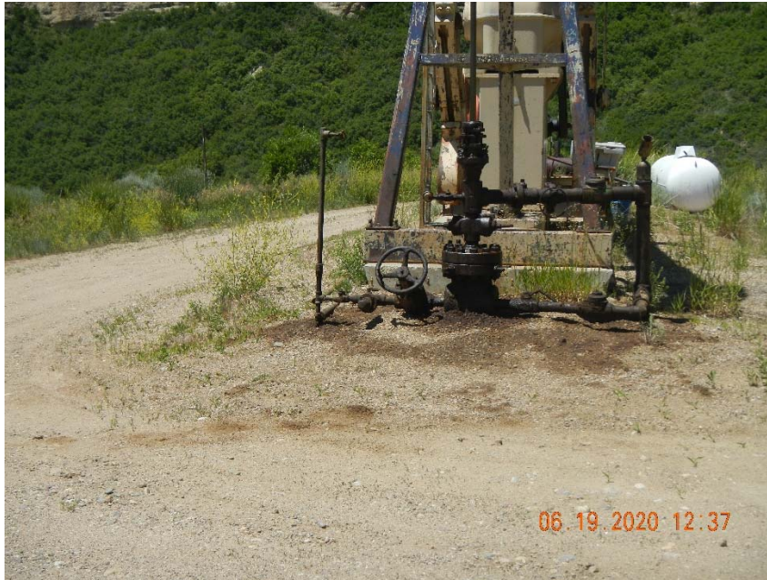
Photo 3. Stained soil at wellhead.