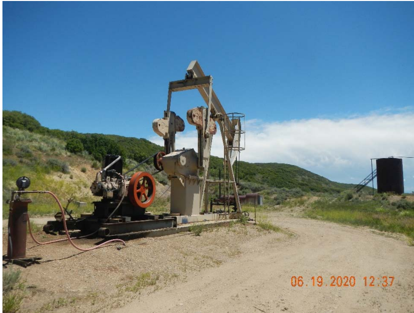
Photo 1. Overview of location taken facing east.