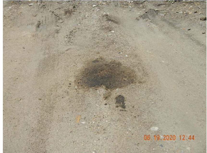
Photo 8. Stained soil on location.