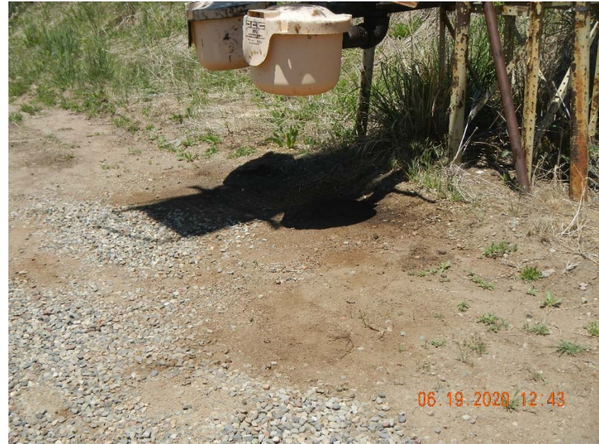
Photo 10. Stained soil on location.