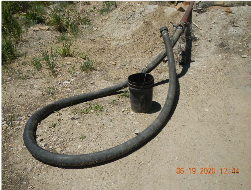
Photo 9. No containment.