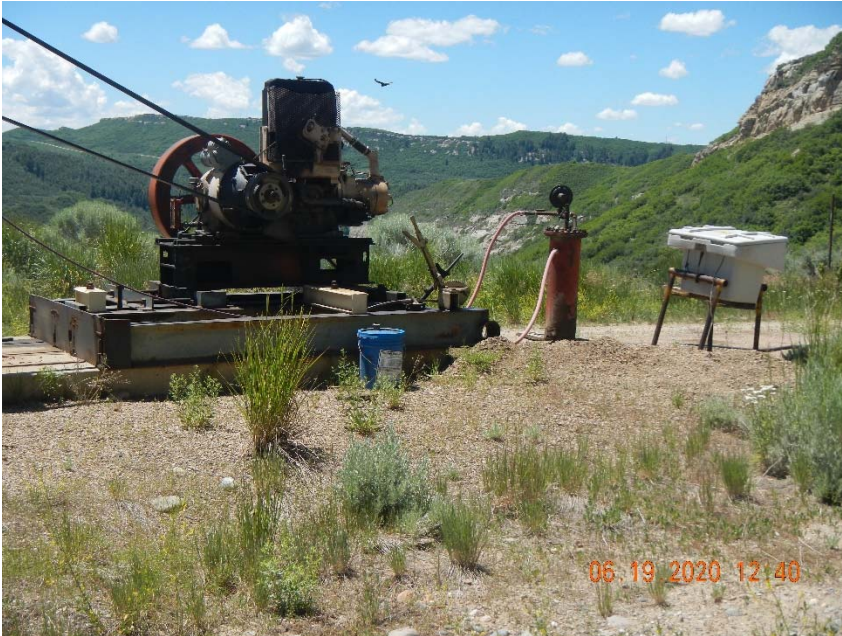
Photo 5. Lube oil stored without containment.