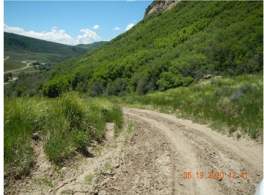
Photo 6. Sediment migration down access road.