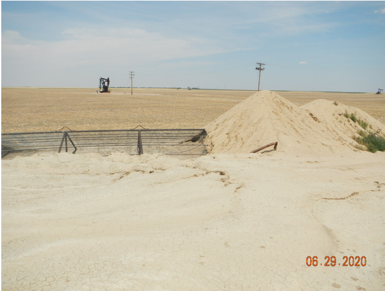
Photo # 3 – Former oil skim pit cover and impacted soil stockpile remain on site.