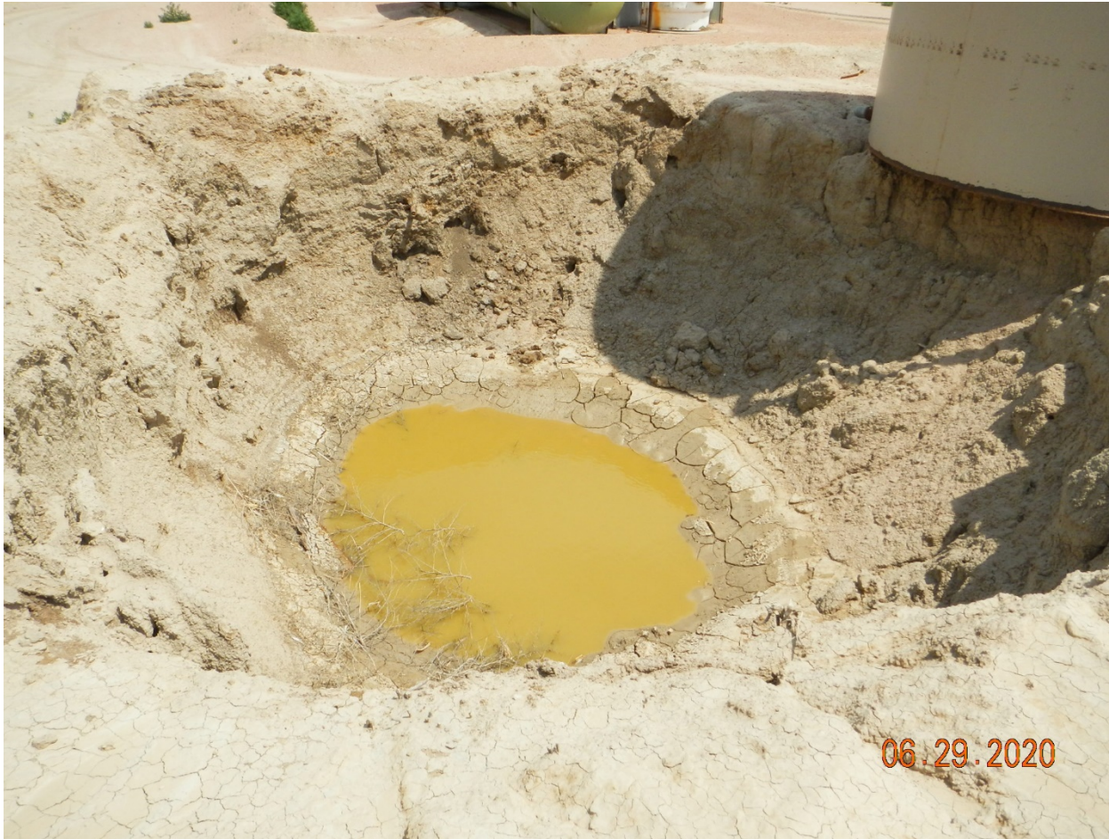
Photo # 2 – Open former oil skim pit excavation, no Form 27 has been provided for this project, produced water tank being undermined

Location Name: – Ward and Son Operating - Loc ID 317229 Inspection Date: 06/29/2020