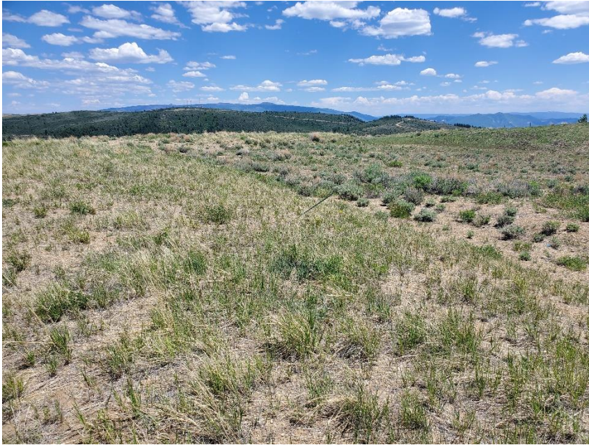
Photo 11: Photo taken from the north end of the pad, facing east. Photos 11-14 provide an overview of the Location from east, southeast, southwest to west.