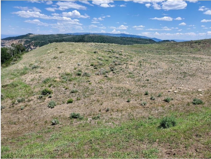
Photo 15: Photo taken from the northwest corner of the Location, facing east. Photos 15-16 provide an overview of the Location from west to south.