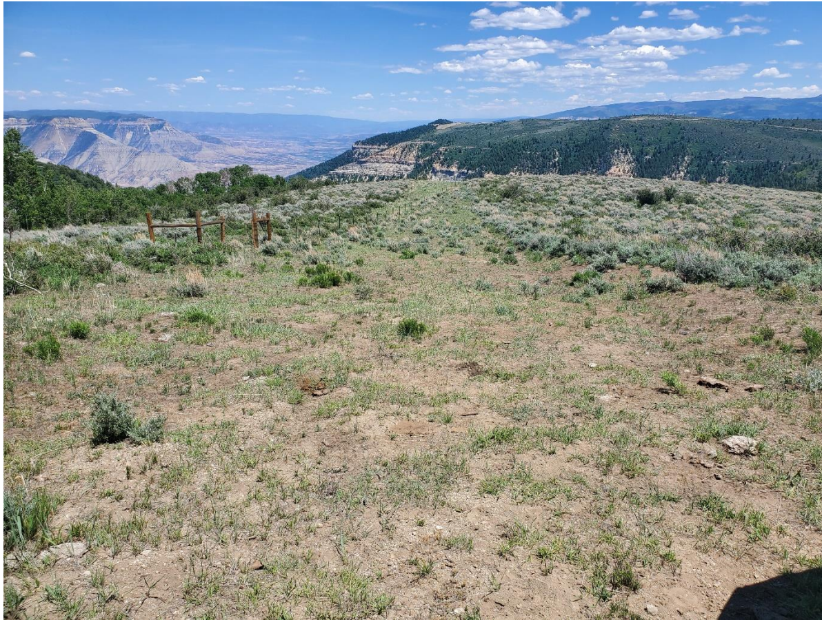
Photo 17: Photo taken from the access road, facing east. Photo show reclamation of the access road is in process.