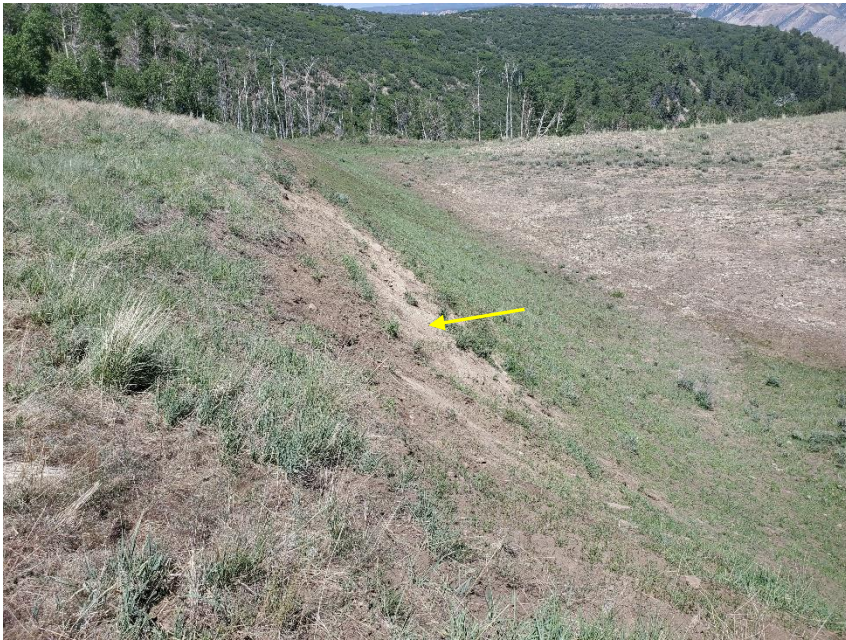
Photo 1: Photo taken from the southeast corner of the Location, facing north. Photos 1-3 provide an overview of the Location from north, northeast to east. Photos show Location has not been recontoured/reclaimed; SOVR has been approved to not contour pad. Photo also shows areas of the slopes on the southeast corner that remain bare and at risk of erosion.