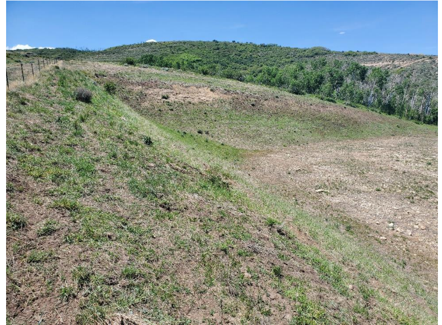
Photo 4: Photo taken from the south end of the Location, facing west. Photos 4-7 provide an overview of the Location from west, northwest, northeast to east.