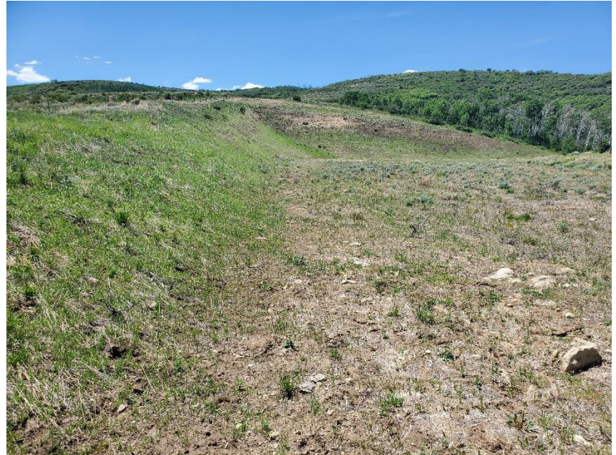
Photo 8: Photo taken from the southeast corner of the Location, facing west. Photos 8-10 provide an overview of the Location from west, northwest to north. See comments under photo 1.