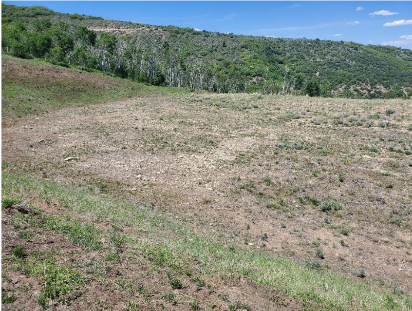
Photo 5: See comments under photo 4. Photo also show areas of the pad where additional revegetation activities appear to have been conducted. Records suggest work was conducted in 2018.