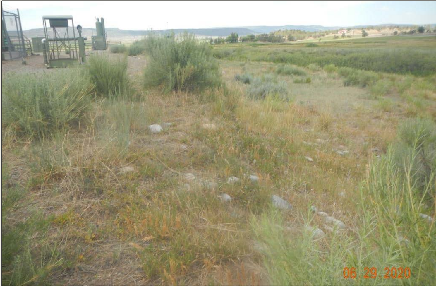
Photo 2. View of the northern fill slope from the northeastern corner facing westward.