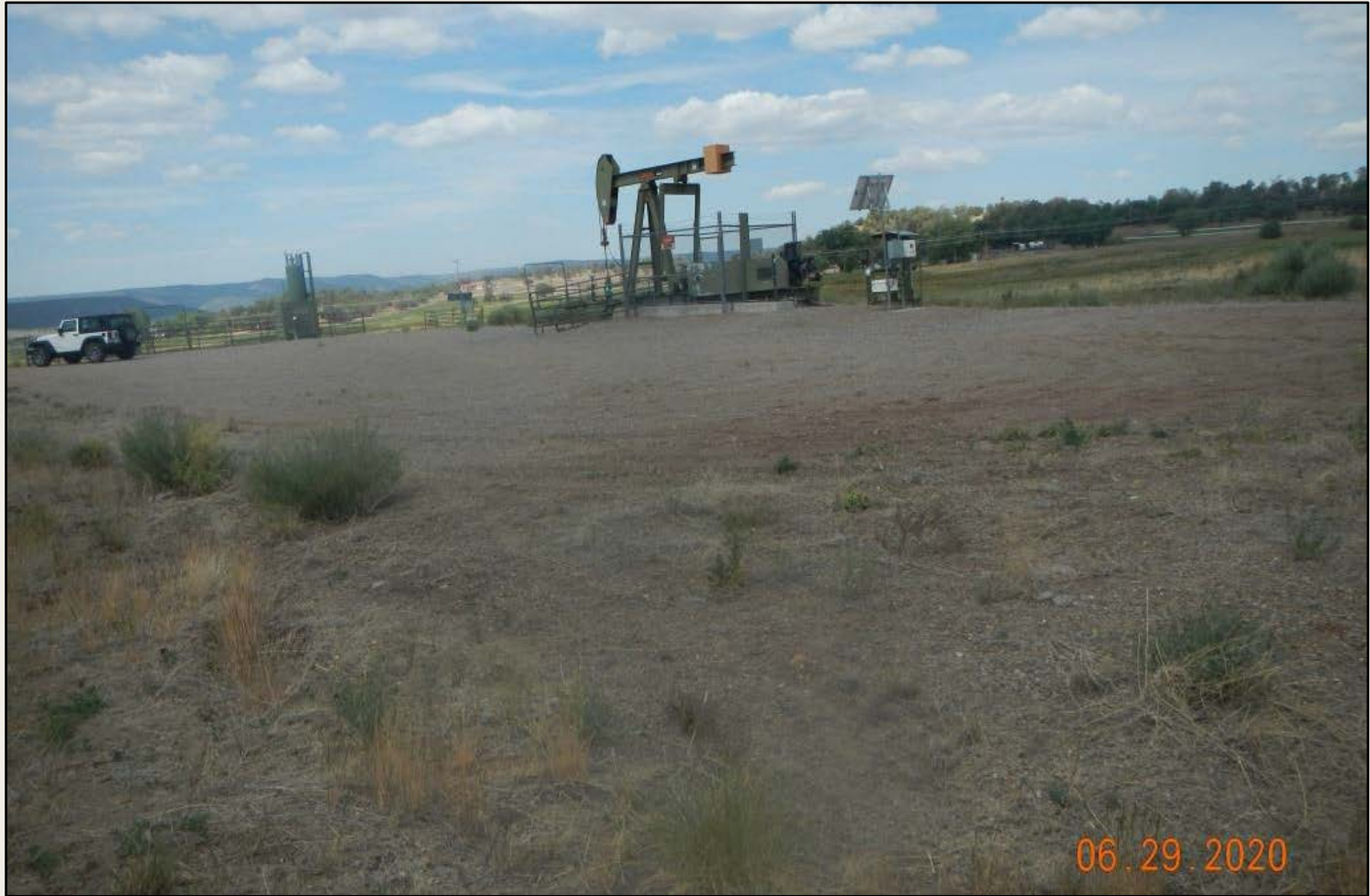
Photo 1. View of the project area from the southeastern corner facing center.