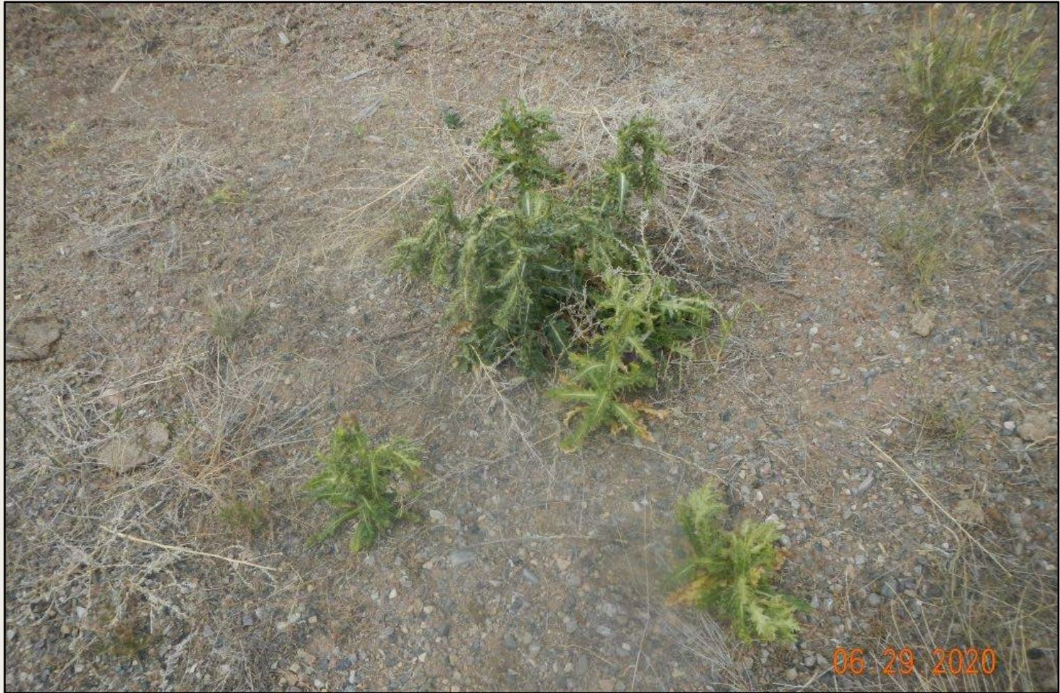
Photo 4. View of musk thistles wilting from what appears to be herbicide treatment within the eastern project area.