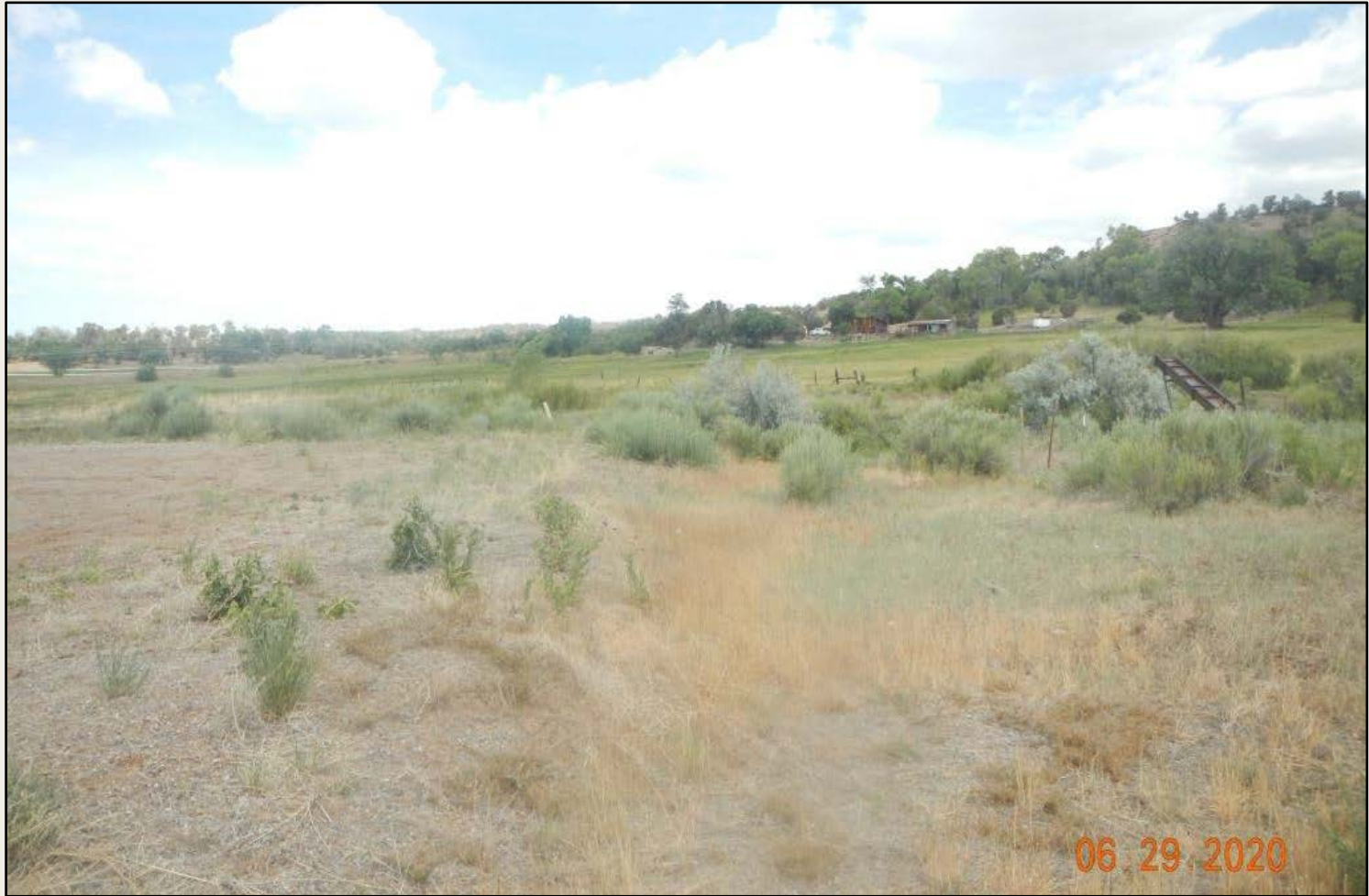
Photo 3. View of the eastern project area from the southeastern corner facing northward.