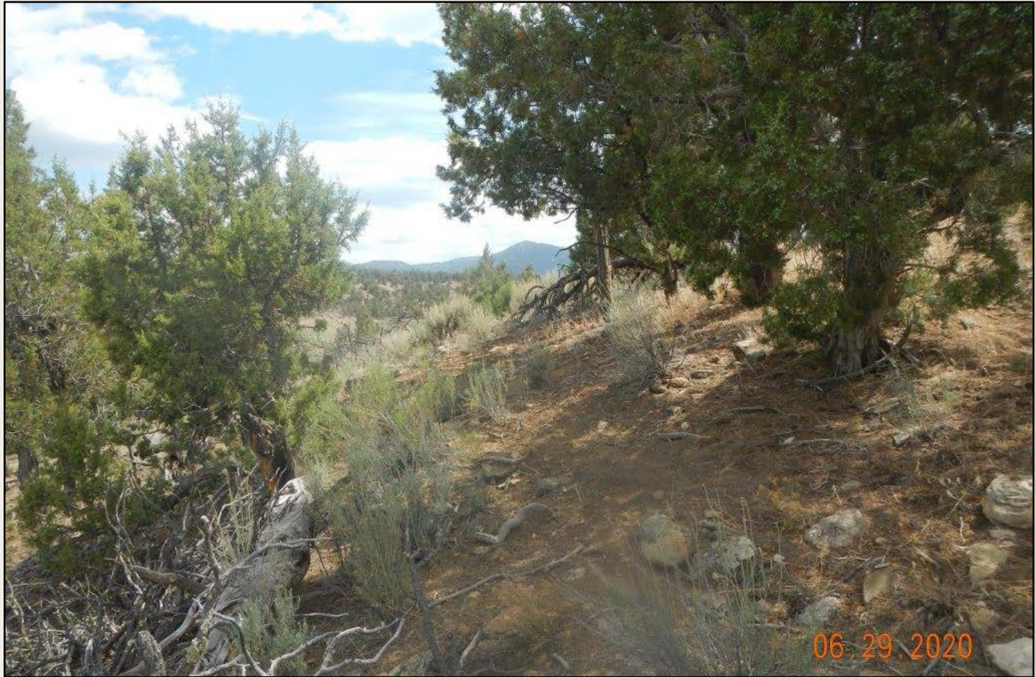
Photo 6. View of the reference area, comprised of pinyon juniper woodland with sagebrush, blue grama, and penstemon in the understory.