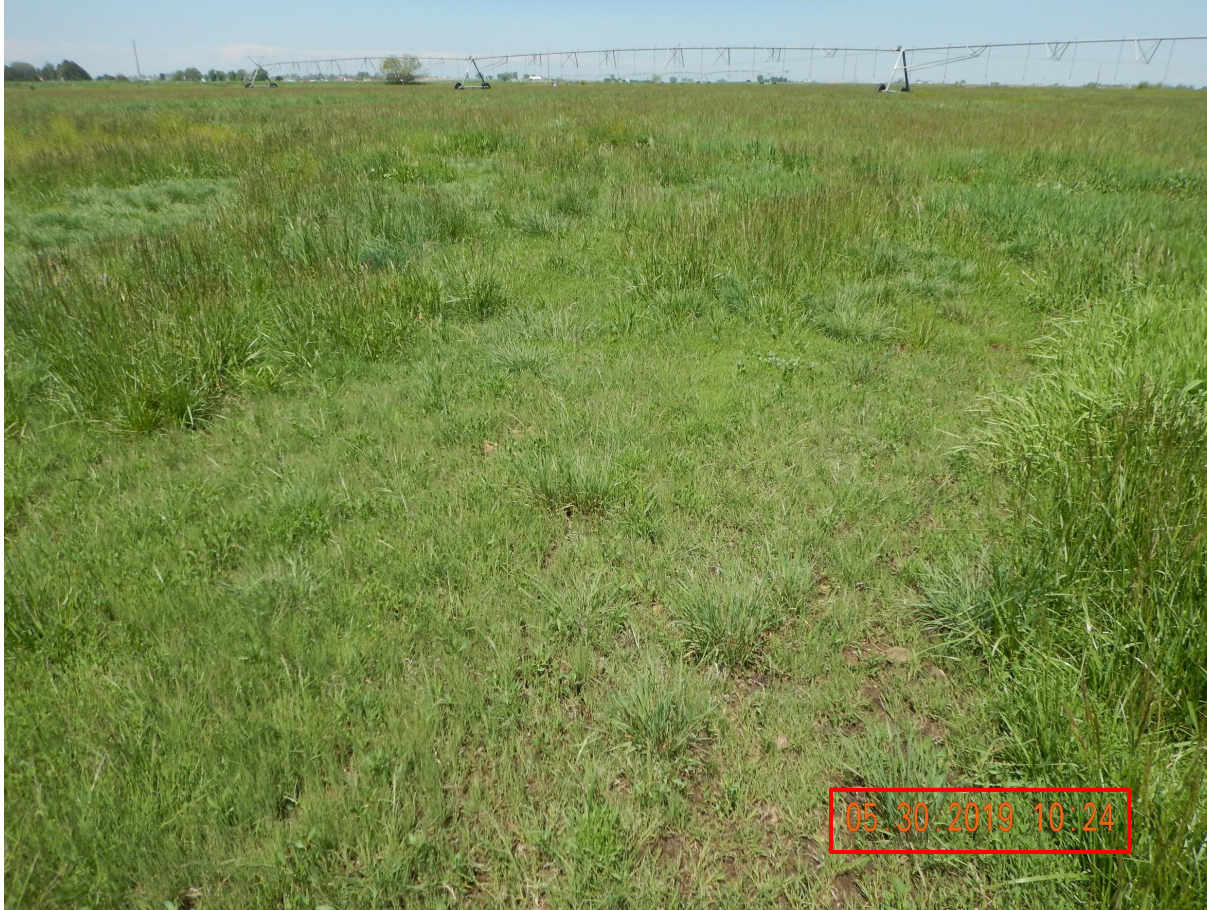
Photo 9. Photo taken adjacent to the well location on 5/30/2019, facing West. See comments under Photo 8.