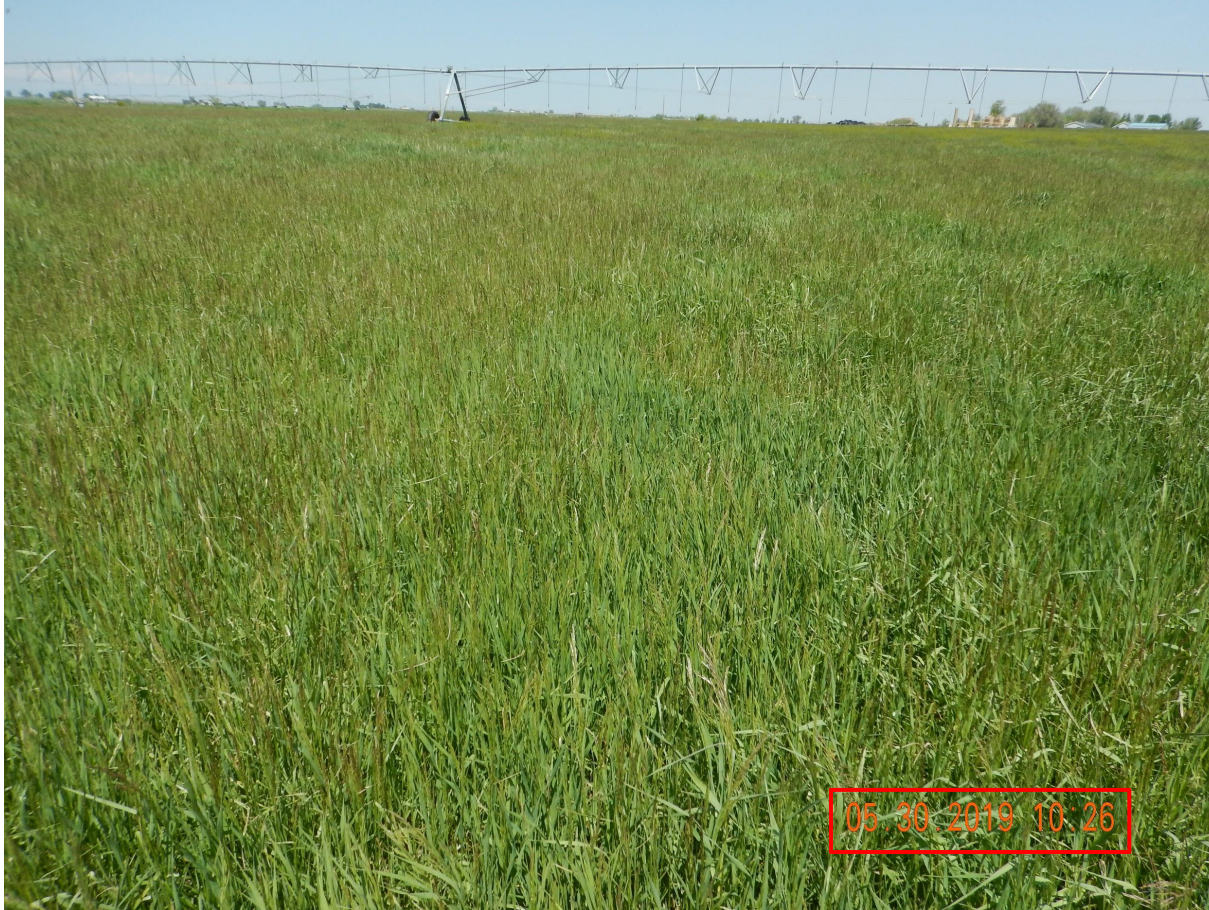
Photo 11. Reference photo taken west of the well location on 5/30/2019, facing West. See comments under Photo 8.