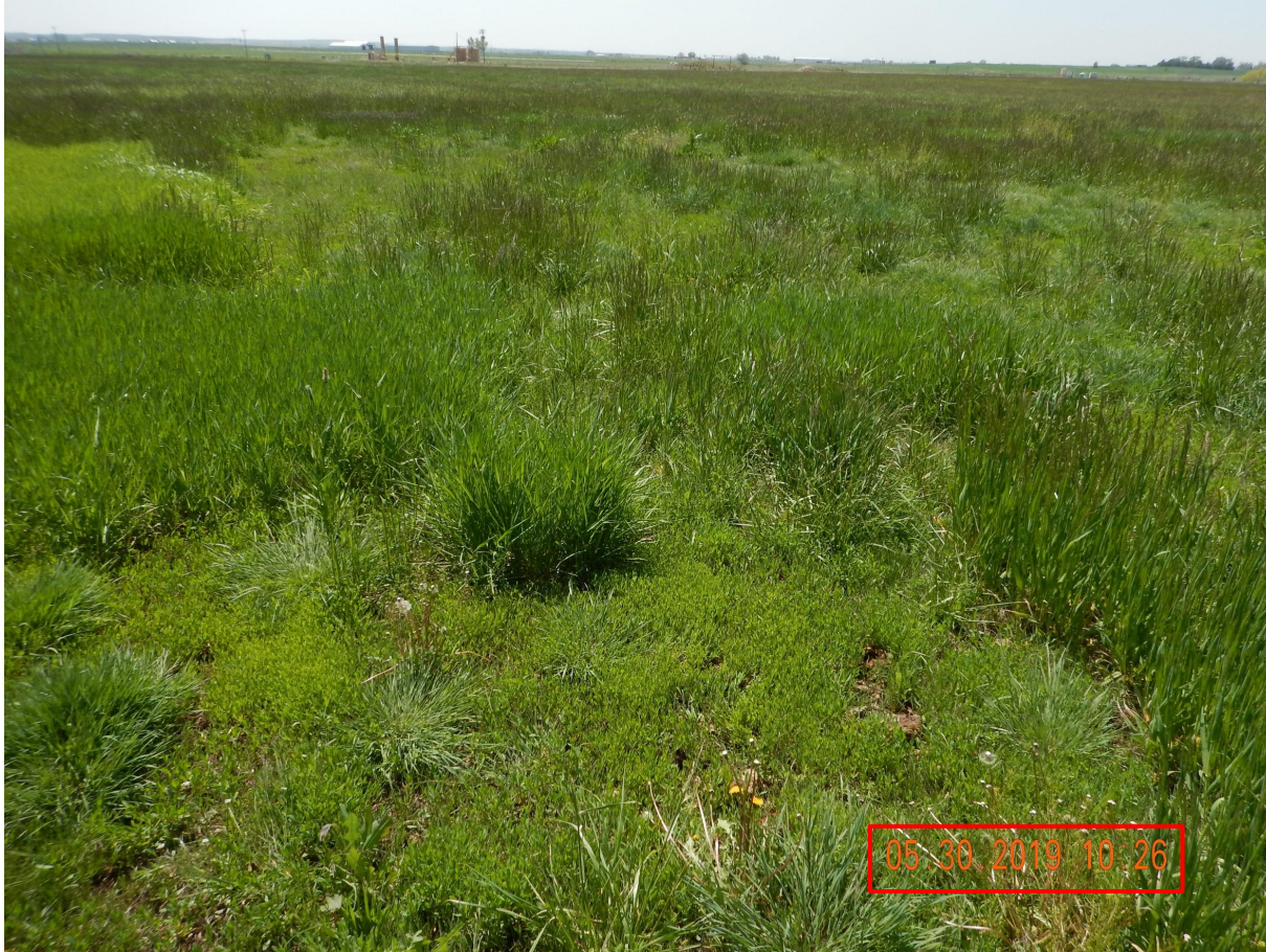
Photo 10. Photo taken adjacent to the well location on 5/30/2019, facing East. See comments under Photo 8.