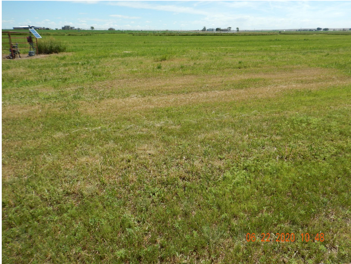
Photo 7. Photo taken adjacent to the well location, facing Southeast. Photo illustrates a disturbance area that has not been properly contoured and is not reflective of reference area vegetation. This was part of a previous complaint from 2019 that has not been addressed. This field has already been mowed so the vegetation issue is hard to observe. Refer to Photos 8-11 taken in May 2019 that better illustrate the vegetation issue.