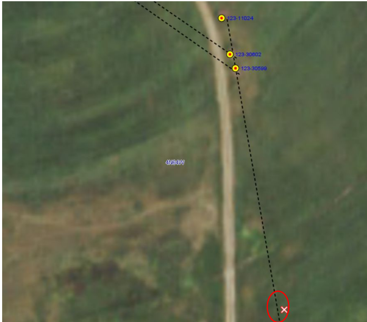
Photo 2. Aerial imagery taken in 2017. Aerial imagery of a subsidence area (red x) that appears to be associated with the flowline (black-dashed line= Active (inferred)) for well 123-11024. Subsidence is located at the approximate Lat/Long coordinates: 40.321403, -104.539956.