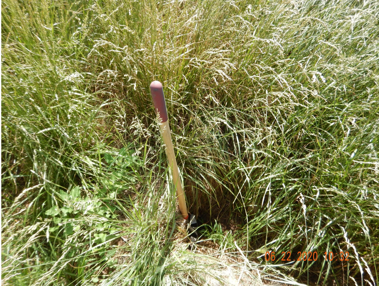
Photo 4. Photo taken from the area of subsidence. Photo illustrates a standard shovel placed into the subsidence which is ~3 feet deep.