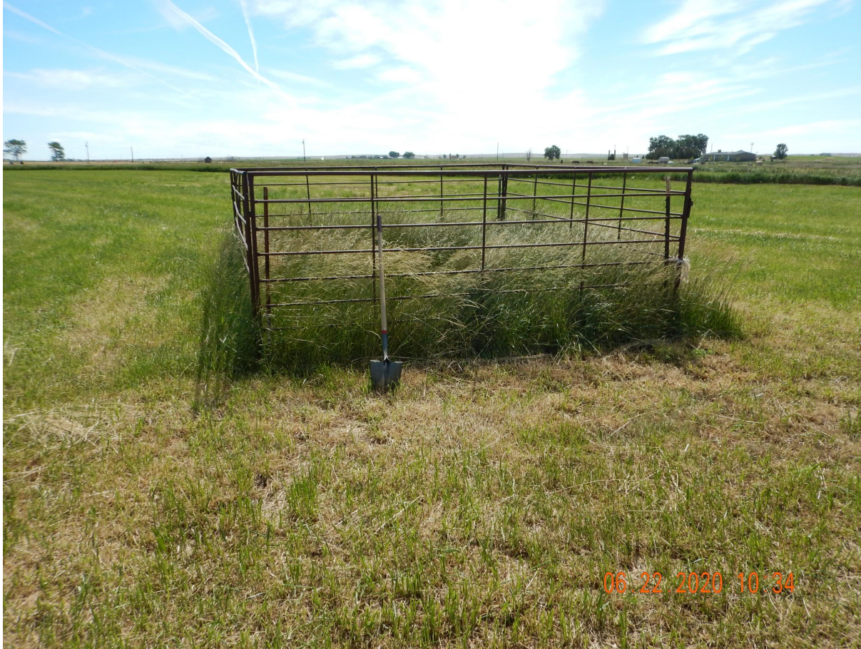
Photo 3. Photo taken from the subsidence area, facing East. Photo illustrates fencing that has been put in place by the surface owner to mitigate any safety hazards with livestock and farming equipment.