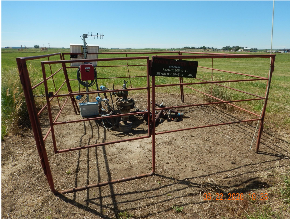
Photo 5. Photo taken from the well location, facing South. Photo illustrates the well is temporarily abandoned. Complainant thought the well was plugged but not abandoned.