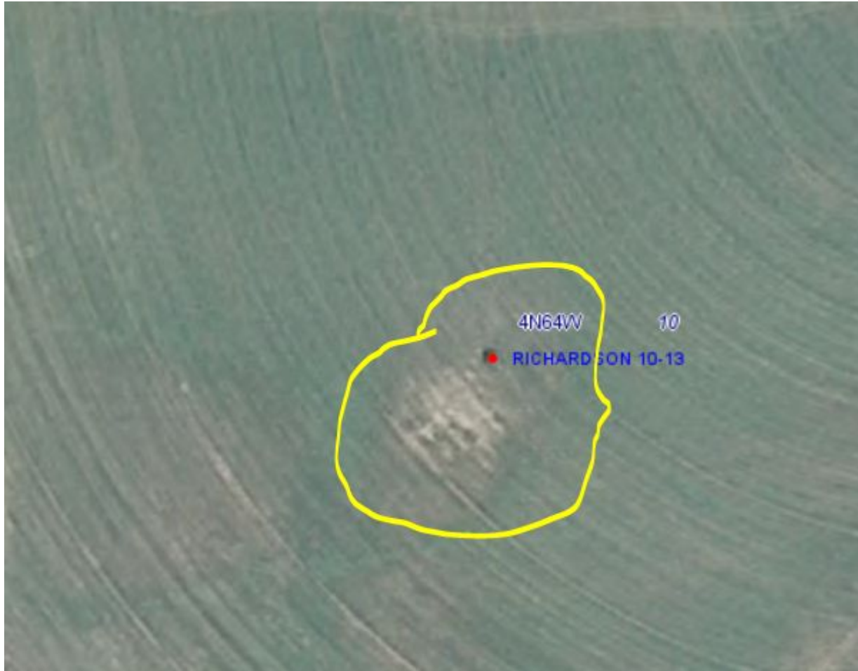
Photo 6. Aerial imagery taken in 2011. Aerial imagery shows a disturbance area around the wellhead that is not reflective of reference area vegetation.

Note: This aerial imagery was used in the previous complaint inspection.