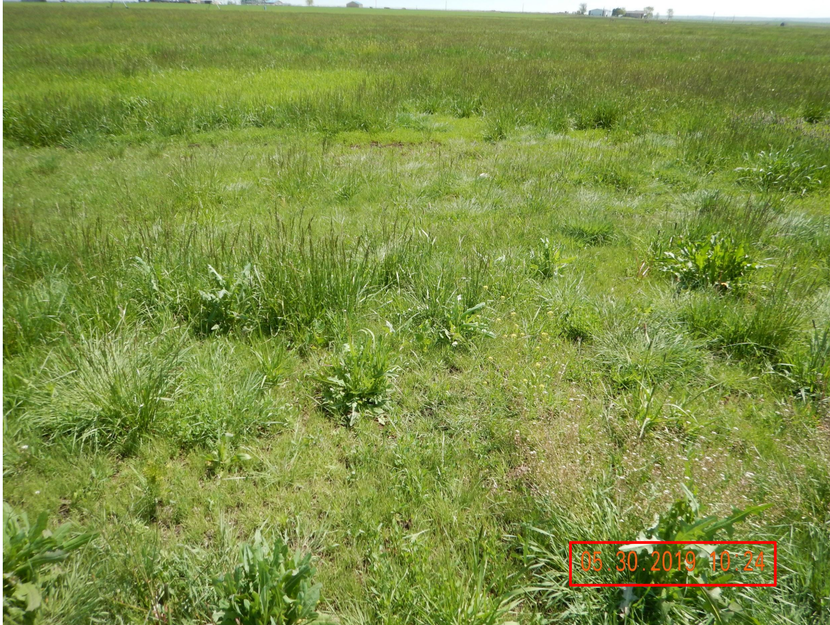
Photo 8. Photo taken adjacent to the well location on 5/30/2019, facing South. Photo illustrates a disturbance that is not reflective of reference area vegetation. Uniform establishment of reference area perennial species has not been achieved.