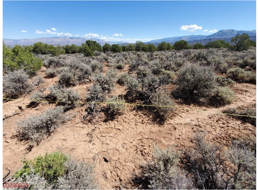
Photo 12: Photo taken from the 50 th point of reference area transect, facing east.