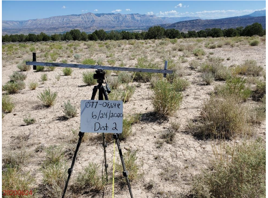
Photo 6: Photo shows the starting point for the 2nd disturbance area transect, facing northeast.