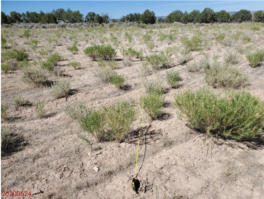
Photo 5: Photo shows the ending point for the 1 st disturbance area transect, facing southwest.