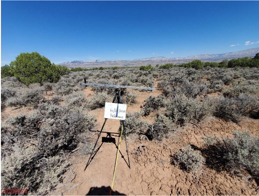
Photo 11: Photo shows the starting point for the reference area transect, facing north.