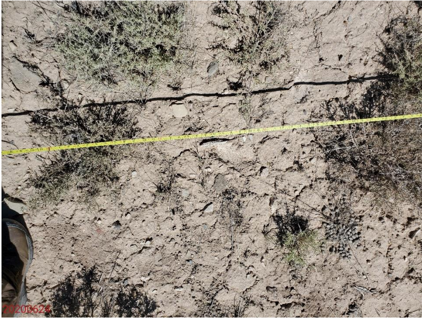
Photo 9: Photo taken from the 50 th point of the 2 nd disturbance area transect.