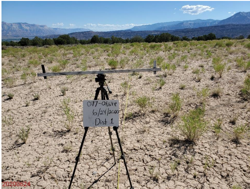
Photo 1: Photo shows the starting point for the 1 st disturbance area transect, facing northeast.