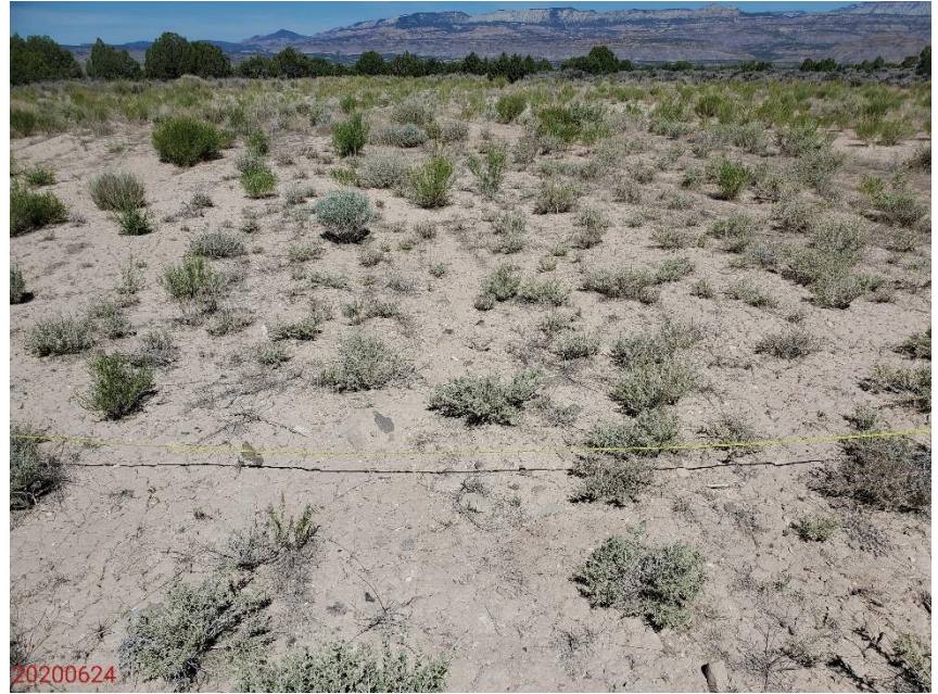
Photo 8: Photo taken from the 50 th point of the 2 nd disturbance area transect, facing southeast.