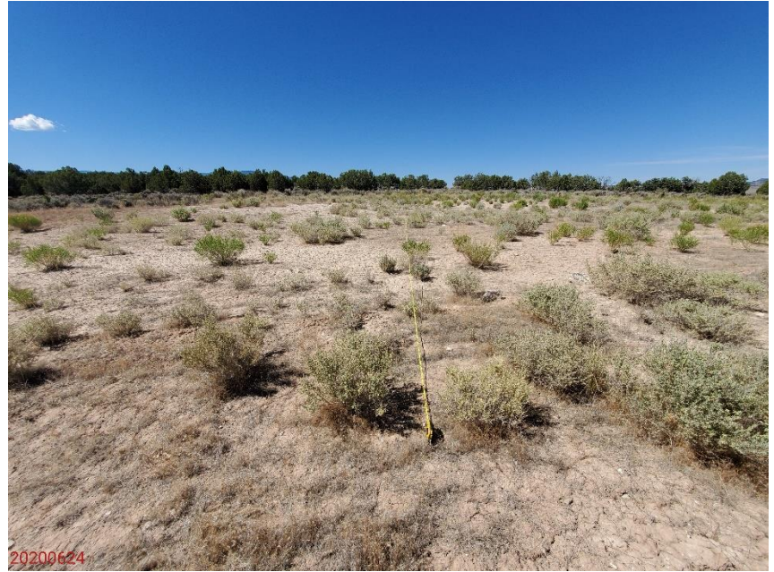
Photo 10: Photo shows the ending point for the 2 nd disturbance area transect, facing southwest.