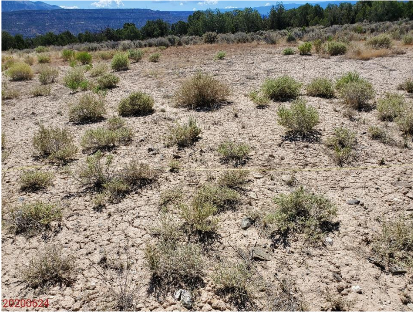
Photo 7: Photo taken from the 50 th point of the 2 nd disturbance area transect, facing northwest.