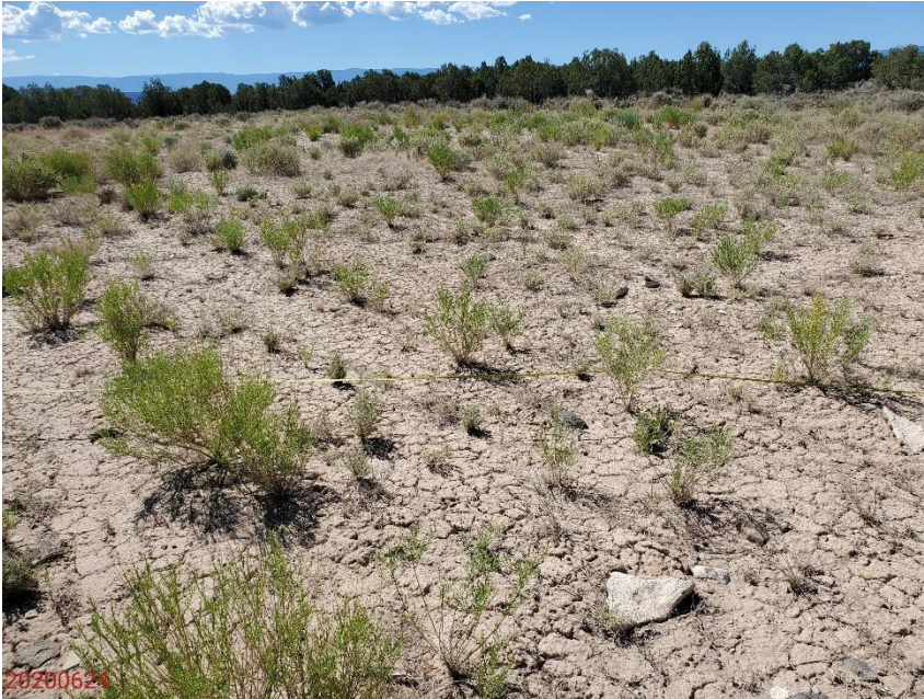
Photo 3: Photo taken from the 50 th point of the 1 st disturbance area transect, facing southeast.