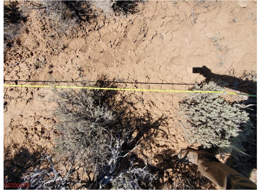
Photo 14: Photo taken from the 50 th point of reference area transect.