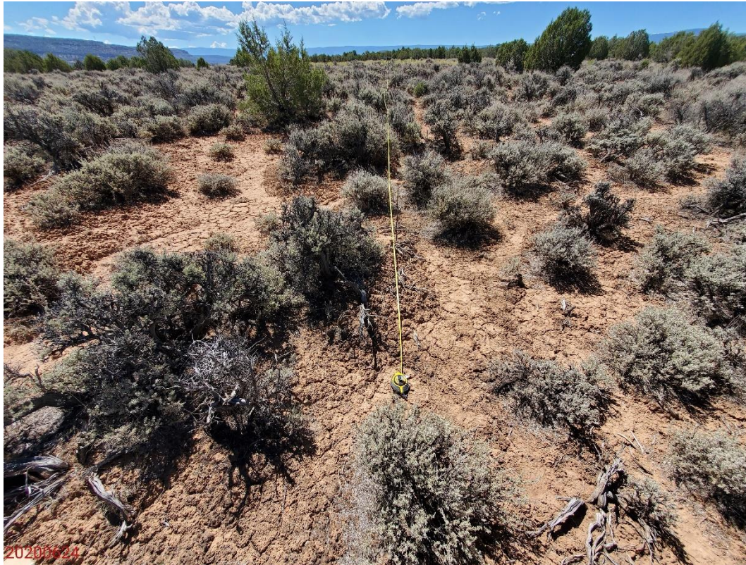
Photo 15: Photo shows the end point for the reference area transect, facing south.