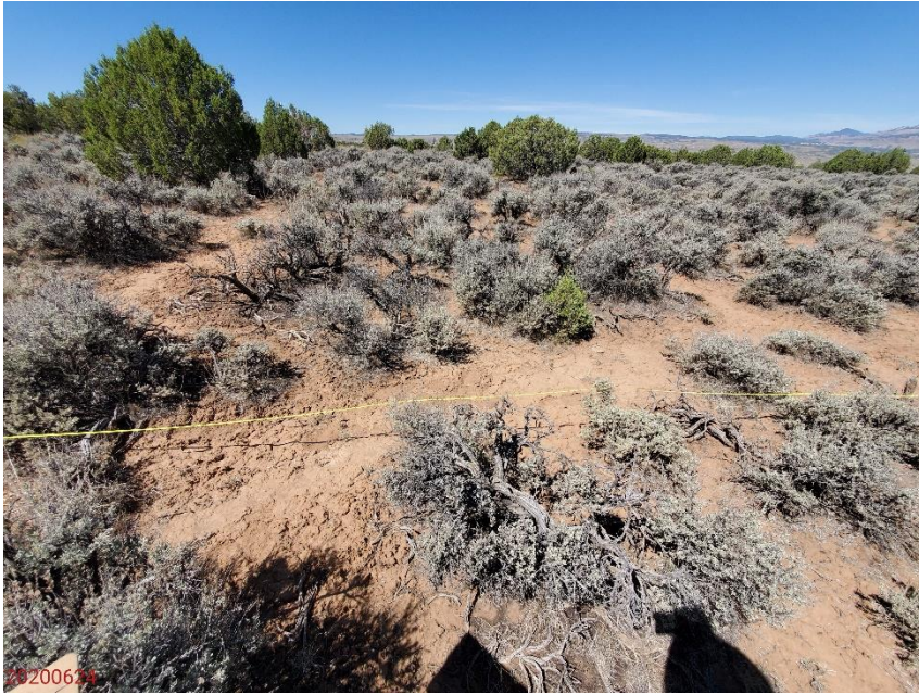
Photo 13: Photo taken from the 50 th point of reference area transect, facing west.