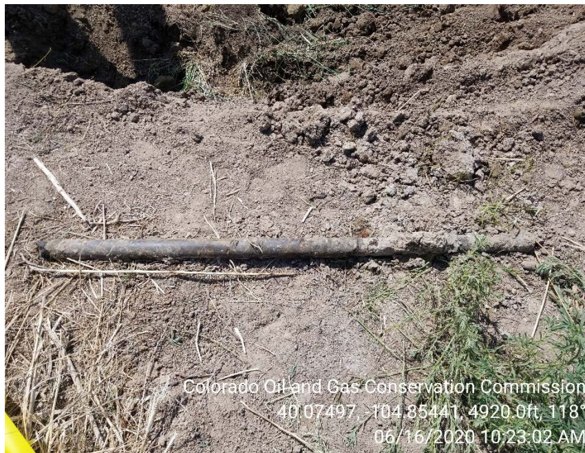
Photo 3 – Corrosion visible on piece of flowline removed from the excavation