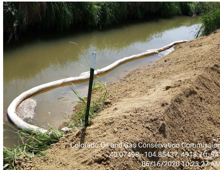
Photo 4 – Soil berm constructed between spill excavation and irrigation ditch. Boom deployed to help mitigate the additional spread of hydrocarbon fluid into irrigation canal