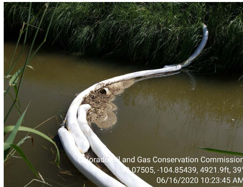
Photo 6 – Berm placed in irrigation ditch downstream of spill; sheen noted on water caught by boom