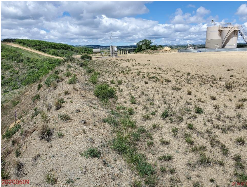
Photo 1: Photo taken from the south end of the Location facing west. Photos 1-4 provide an overview of the Location from west, northwest, northeast to east. Photo shows areas of the Location not necessary for production that have not been reclaimed in accordance with Rule 1003.b