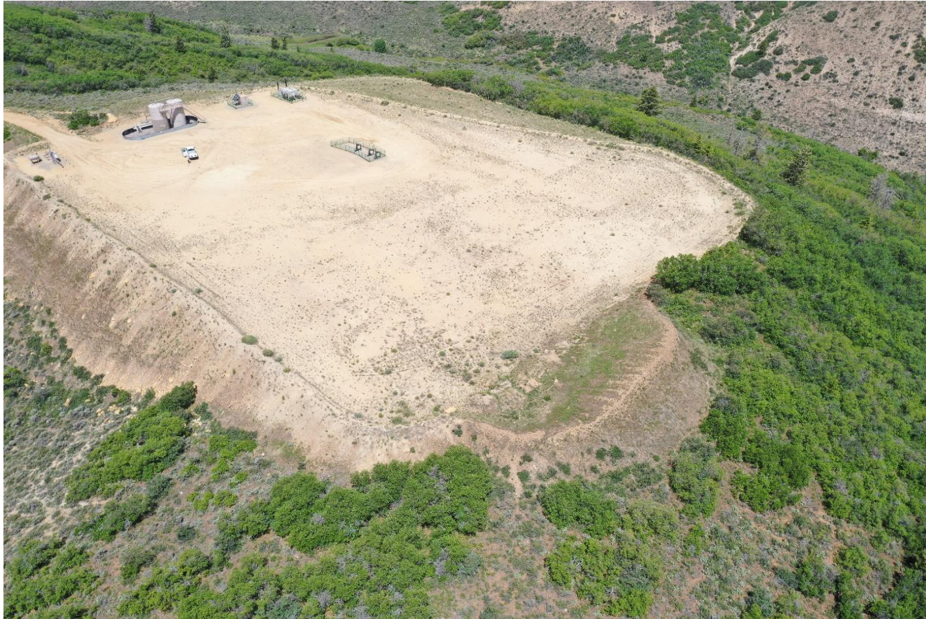
Photo 7: Photo taken from the southeast t of the pad, facing northwest. Photo shows aerial image of the Location. Photo shows areas of the Location not necessary for production has not been reclaimed in accordance with Rule 1003.b