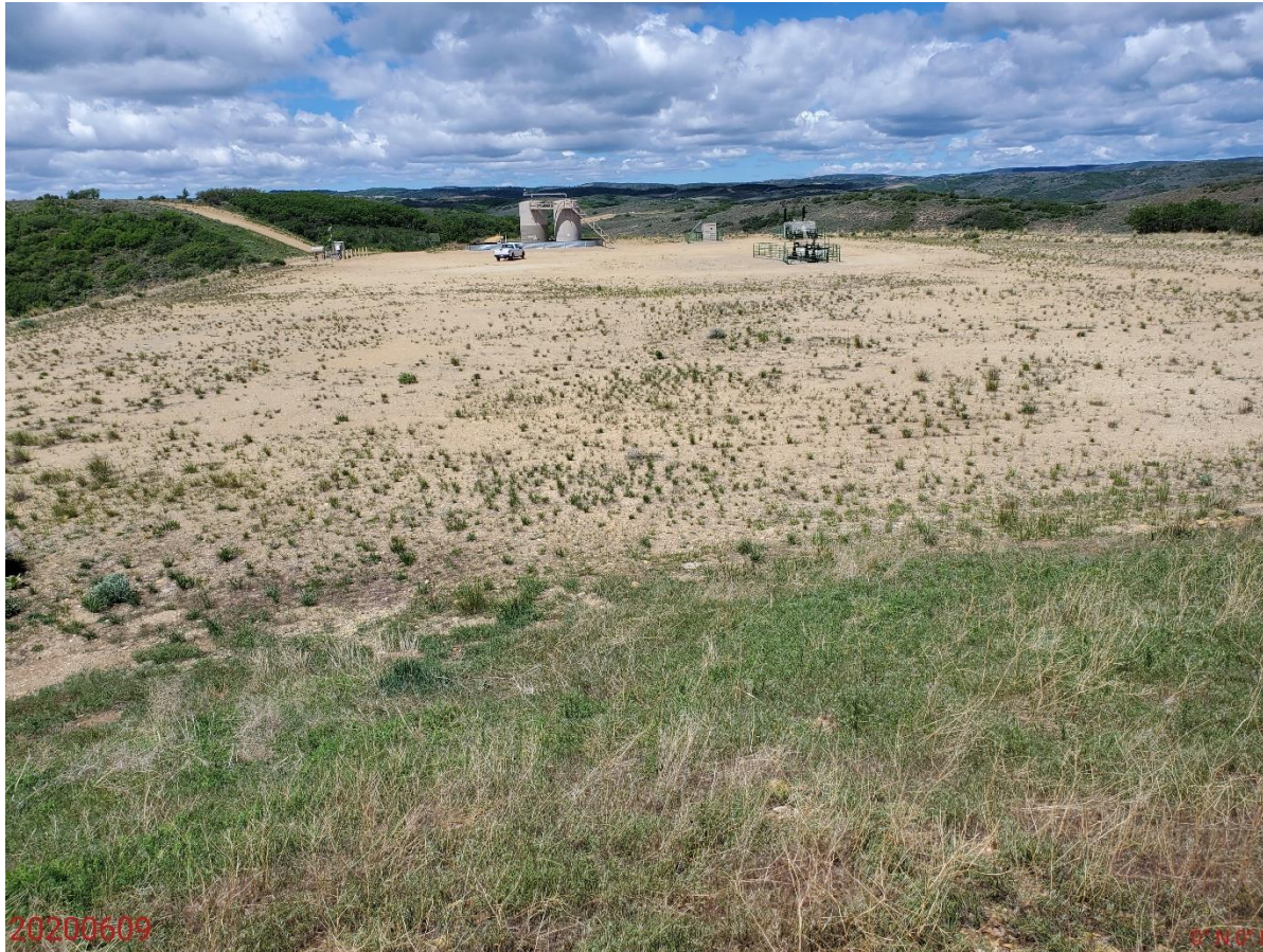
Photo 5: Photo taken from the soil stockpile on the east end of the Location, facing west. See comments under photo 1. Photo also shows vegetation on the soil stockpile remains predominantly undesirable weedy plant species such as Bromus tectorum . Weeds appear to have reached maturity and are viable; It does not appear that weed management has been performed.