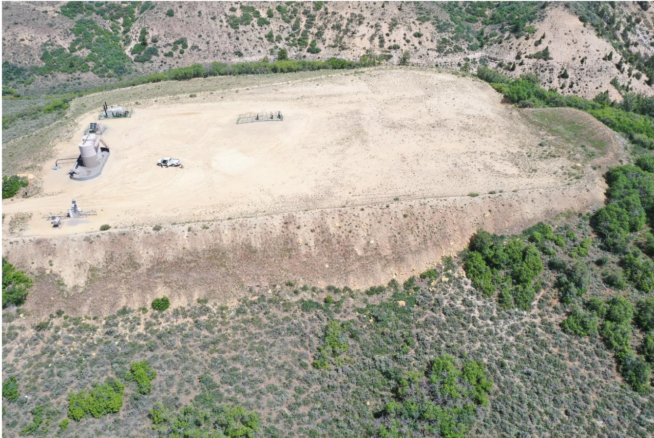
Photo 8: Photo taken from the south of the pad, facing north. Photo shows aerial image of the Location. Photo shows areas of the Location not necessary for production has not been reclaimed in accordance with Rule 1003.b