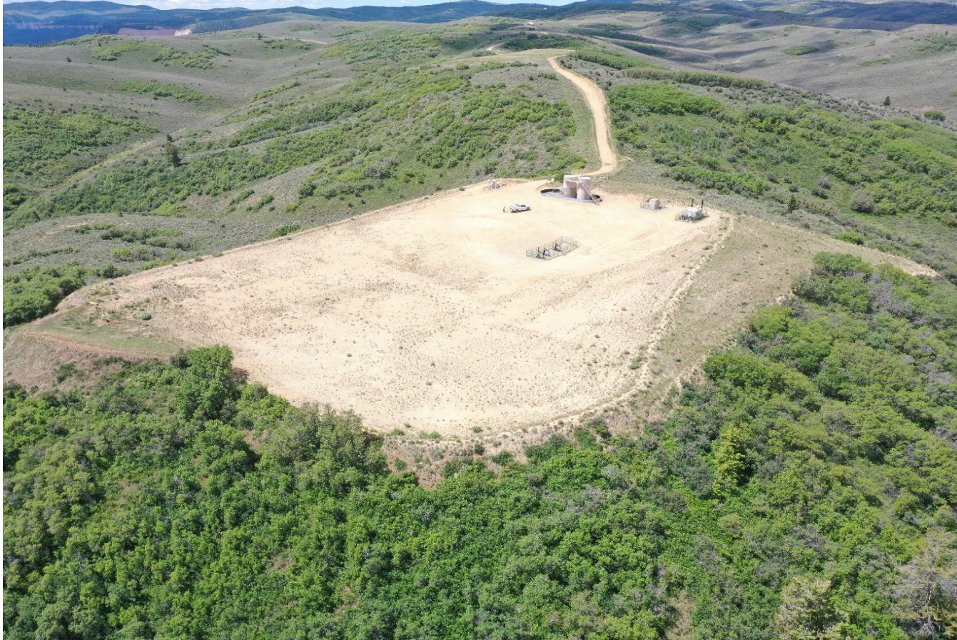
Photo 6: Photo taken from the northeast of the pad, facing southwest. Photo shows aerial image of the Location. Photo shows areas of the Location not necessary for production has not been reclaimed in accordance with Rule 1003.b