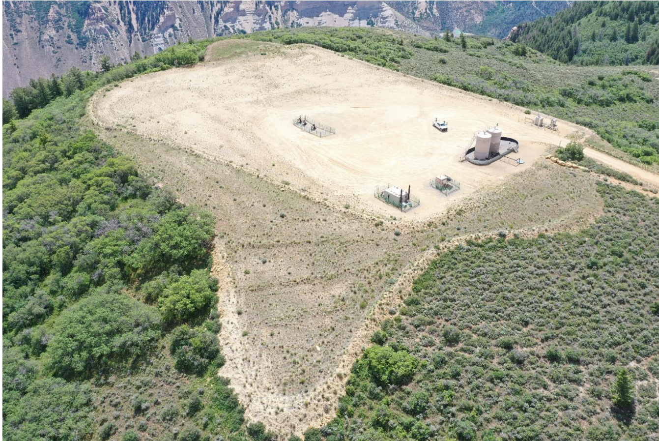
Photo 9: Photo taken from the northwest of the pad, facing southeast. Photo shows aerial image of the Location. Photo shows areas of the Location not necessary for production has not been reclaimed in accordance with Rule 1003.b