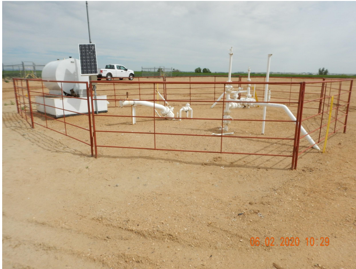
Photo 3. Photo taken from the southern tank battery location, facing North. Photo illustrates equipment remains for the TA wells.