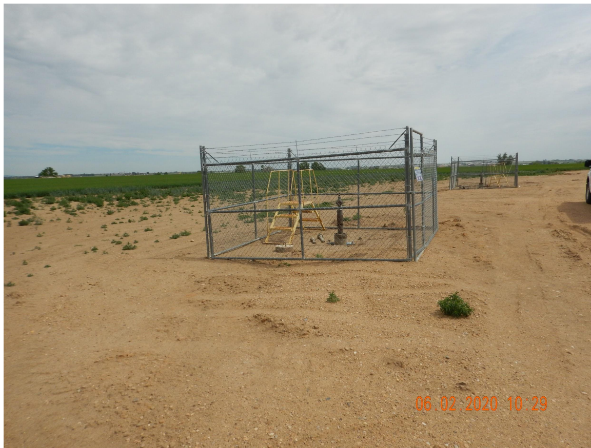
Photo 2. Photo taken from the western well location, facing North. Photo illustrates three well have been plugged while two wells remain in TA status.