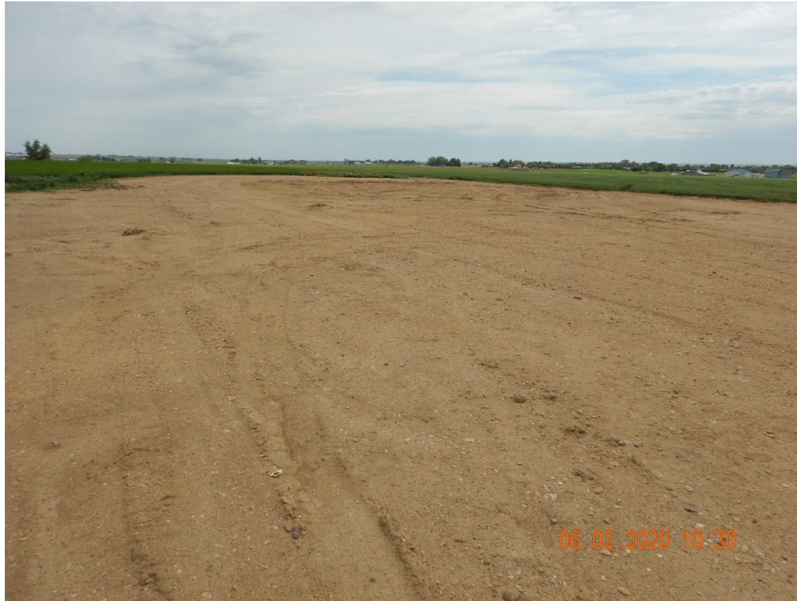
Photo 4. Photo taken from the central tank battery location, facing North. Photo illustrates the northern equipment, including a partially buried produced water vessel, has been removed.