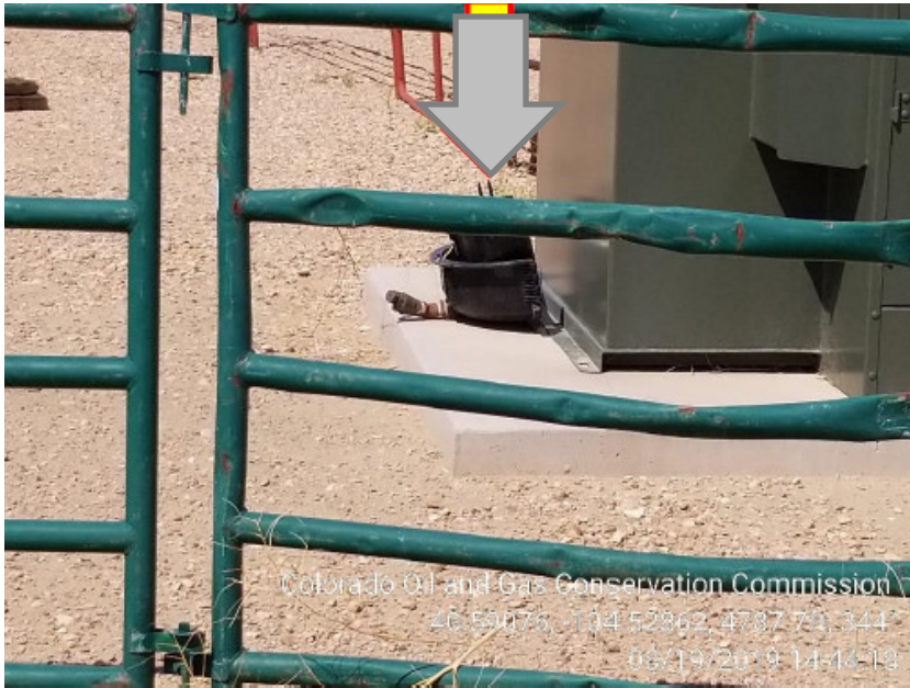
Photo #7 Jeanie AB10-01R Wellsite Unused pollution pot prior insp.