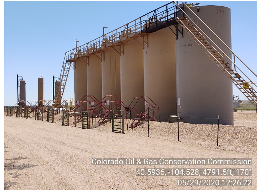
Photo #2 Dillard AB 10-08, Jeanie AB10-01R Battery site Inactive | Shut-down