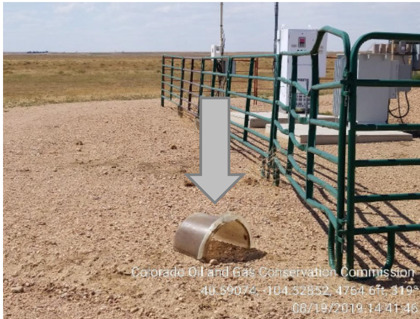
Photo #5 Jeanie AB10-01R Wellsite Unused pollution pot prior insp.