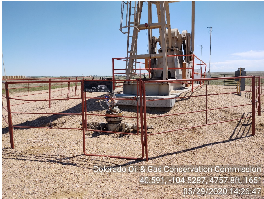
Photo #1 Jeanie AB10-01R (05-123-36262) Wellsite Temporarily Abandoned | TA