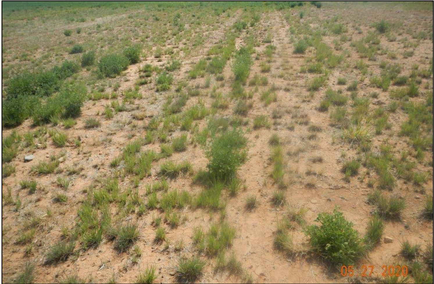
Photo 3. Another view of failed vegetation within the project area. Crop area is irrigated and only supporting sparse alfalfa that are stunted.