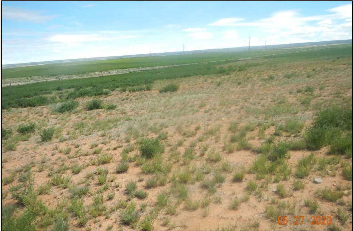
Photo 4. View of the northern project area.