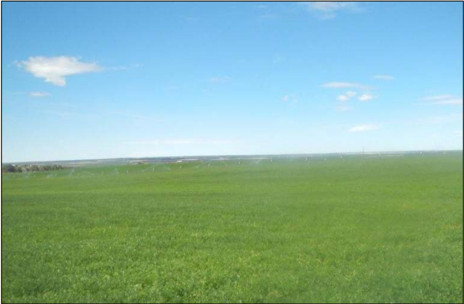
Photo 6 View of reference area vegetation comprised of irrigated alfalfa field.