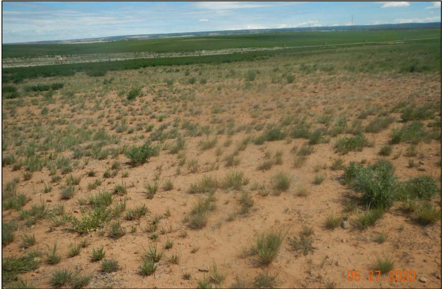
Photo 2. View of the project area facing northeastward. Foxtail ( Hordeum jubatum ) grasses do not match reference area comprised of alfalfa crop field.