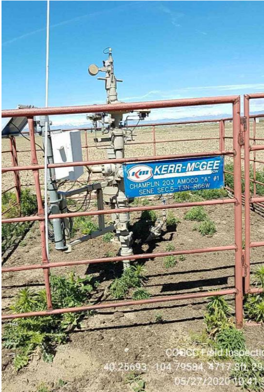
Photo 1 05-123-14601CHAMPLIN 203 AMOCO 'A'1

Location ID, Name: 327384, CHAMPLIN 203 AMOCO 'A'-63N66W 5SENE