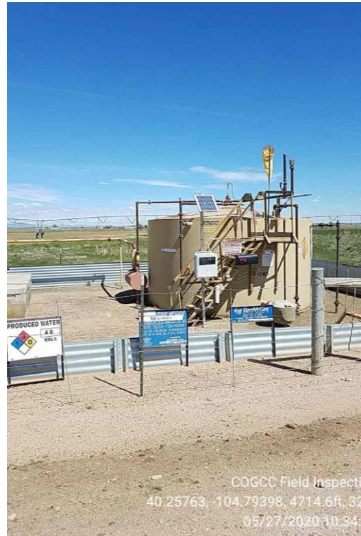
Photo 2 Battery