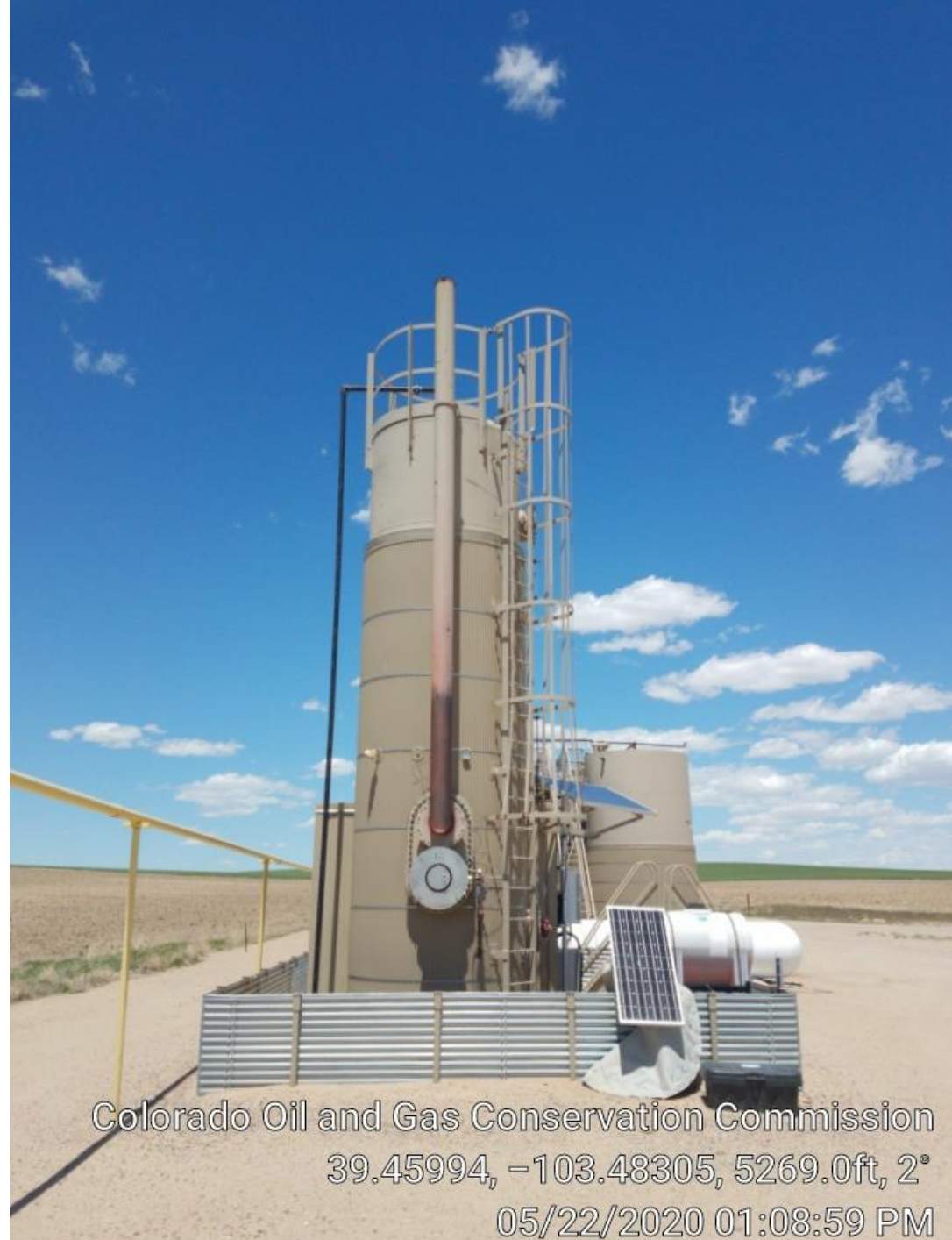
Colorado Oil and Gas Conservation Commission 39.45994, -103.48305, 5269.0ft, 2° 05/22/2020 01:08:59 PM